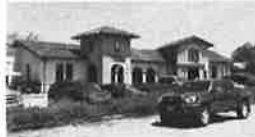
Willow Market, Nipomo

People in one Nipomo neighborhood have been complaining for several years of rank odors coming from Willow in Nipomo, and now the town's water district may take action to get the stinky situation resolved.