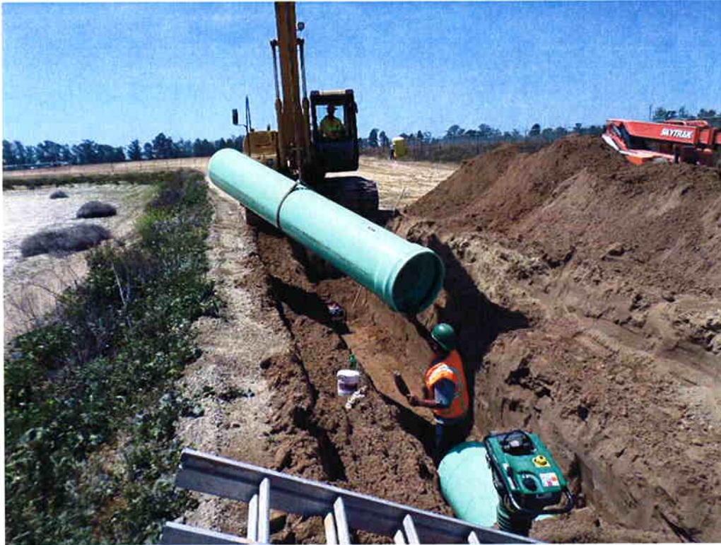
Cushman installing 24-inch SE piping to Ponds 9 & 10.