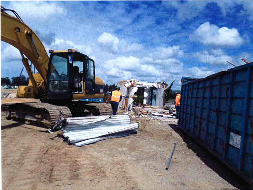
Demolition of existing blower building.