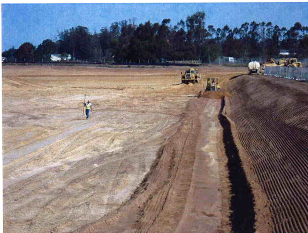
Switzer finishing the bottom of Ponds 9 & 10 and checking grade.