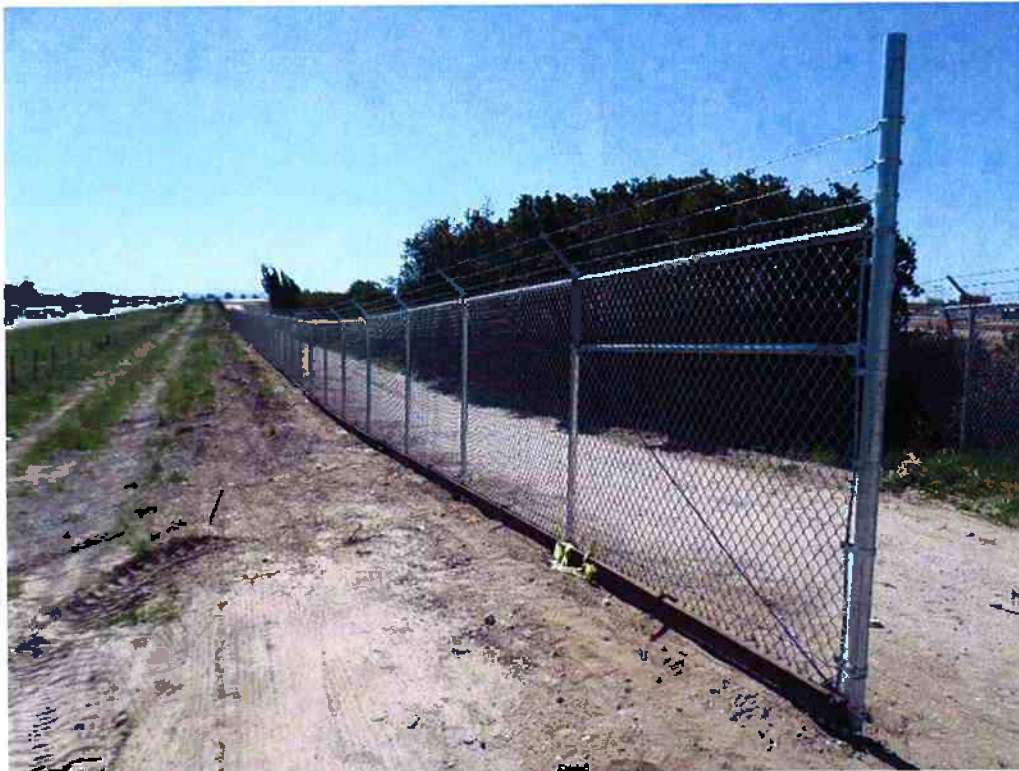
New fencing being installed along the Hwy 101 border.