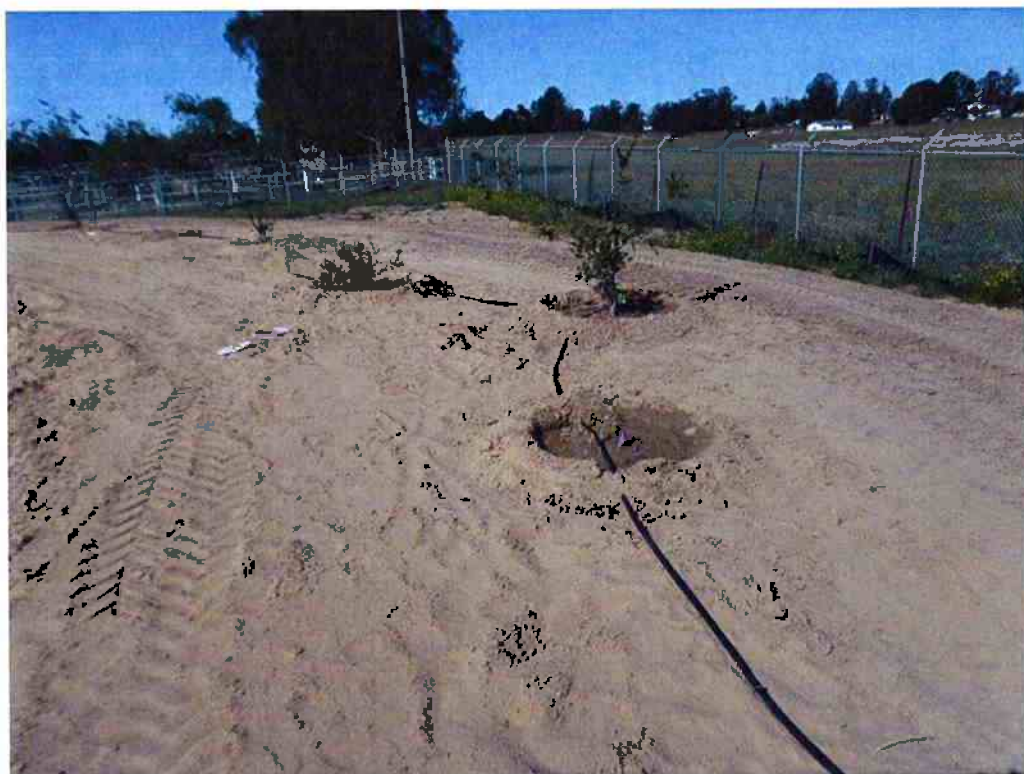
KCI Environmental installing irrigation lines to new plants.