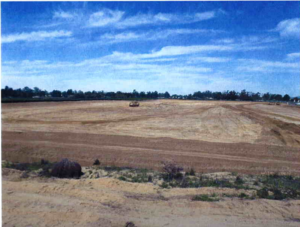
Switzer excavating Area F for Ponds 9 & 10.