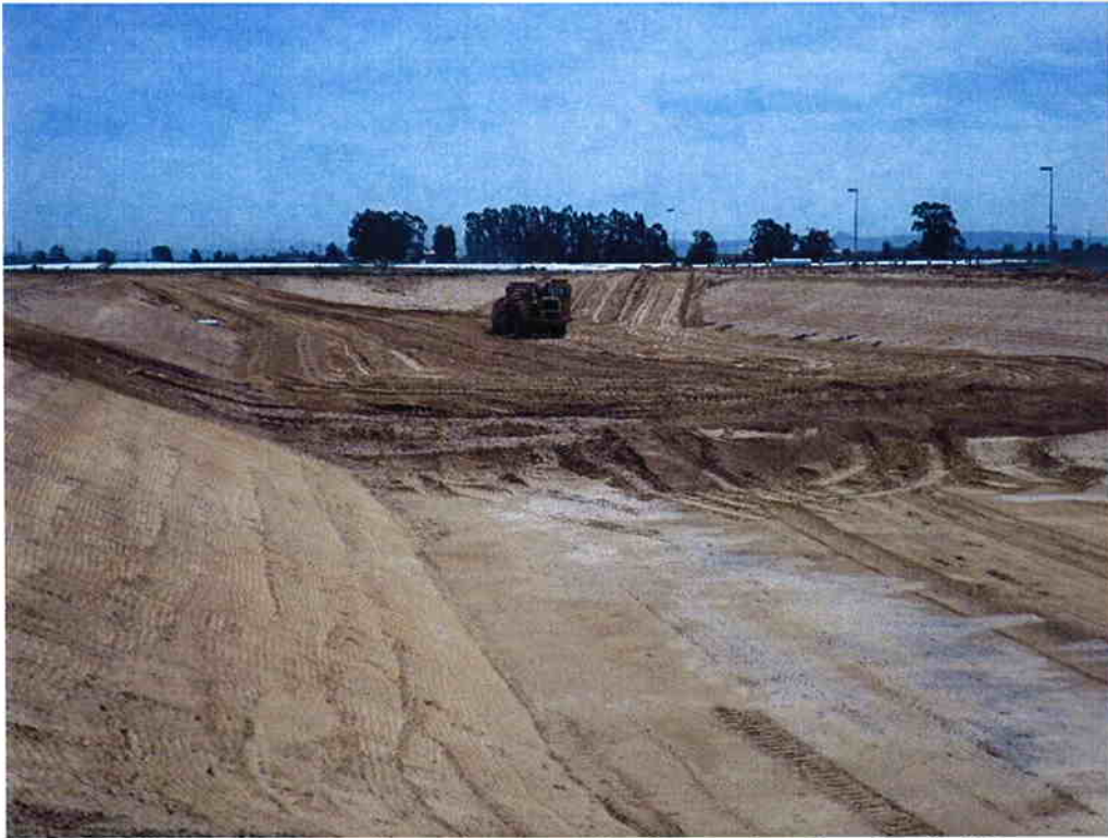
Switzer filling Pond 4 and creating berm for future Aeration Basin #2.