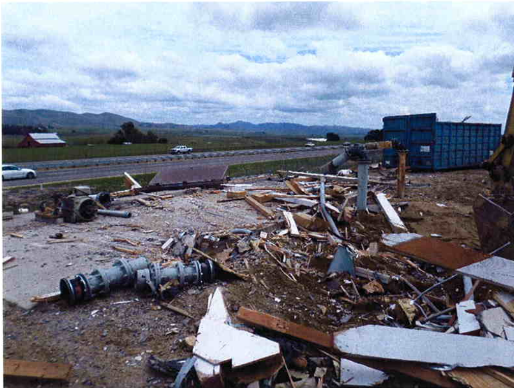
Demolition of existing blower building.