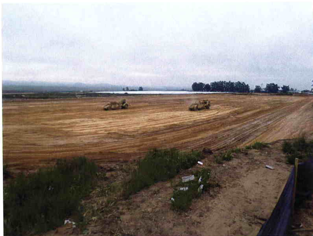
Switzer continuing work on Ponds 9 & 10 in Area F.