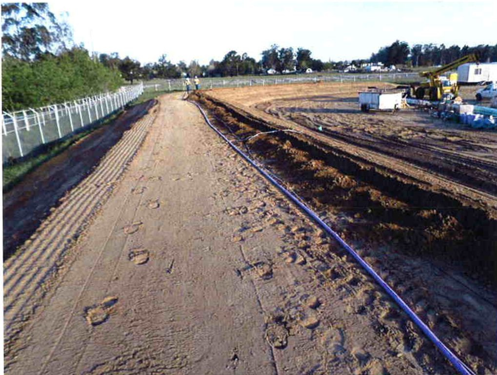
KCI Environmental installing reclaimed water irrigation system on berm to the east of the site.