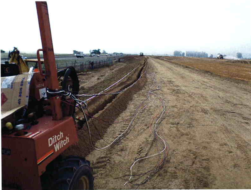
KCI Environmental laying out and installing reclaimed water irrigation lines and power to controllers.