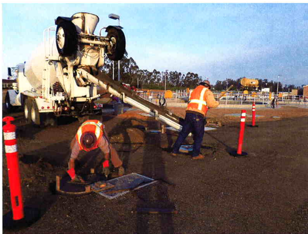
Cushman pouring concrete collars around valves.