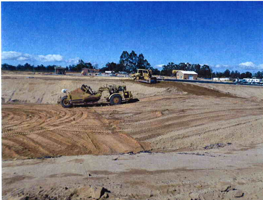
Switzer filling Ponds 2 & 3 with native material from Ponds 9 & 10.