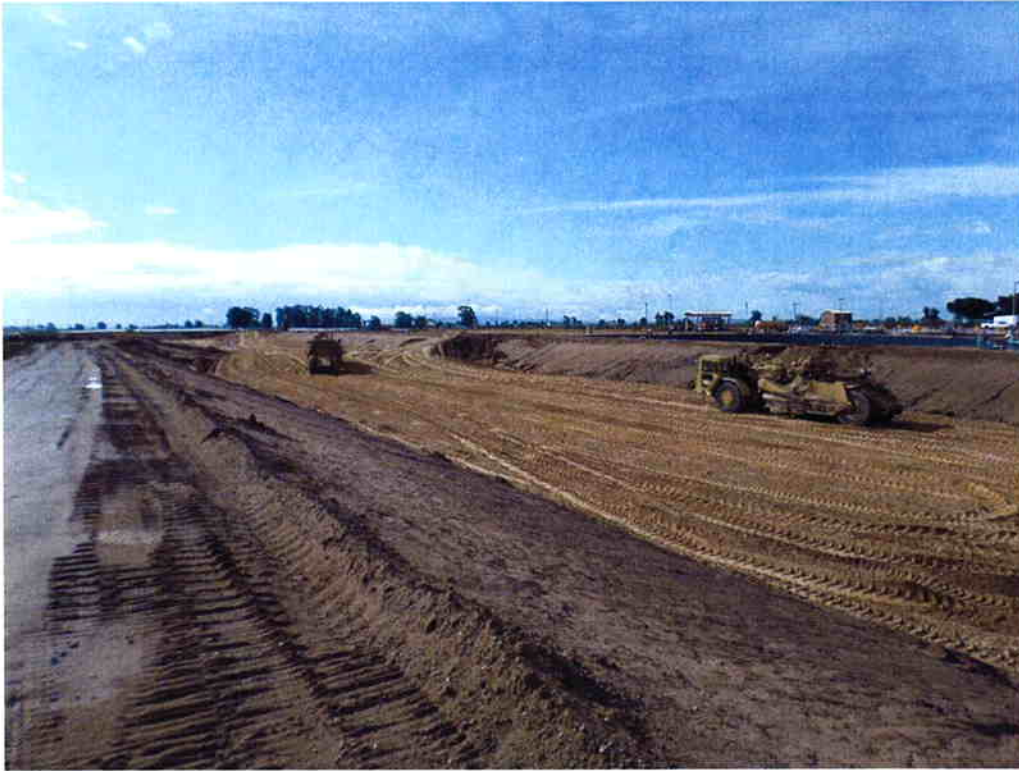
Switzer continuing to fill Ponds 2 & 3 with native material.