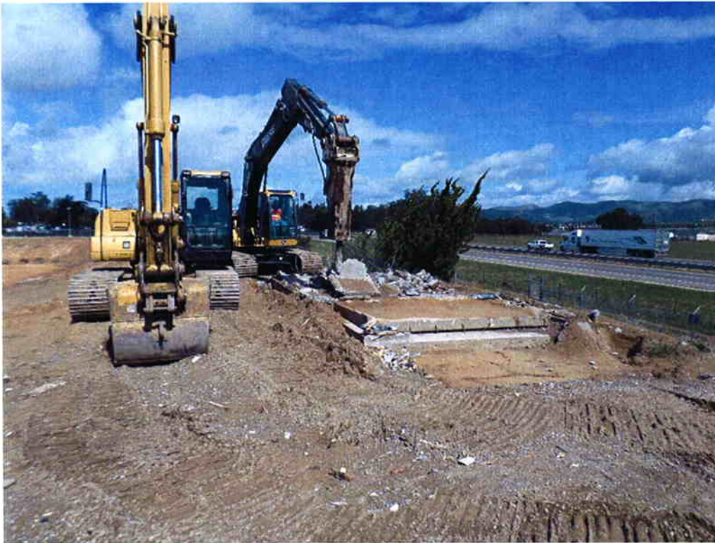
Cushman completing demolition of the existing building.