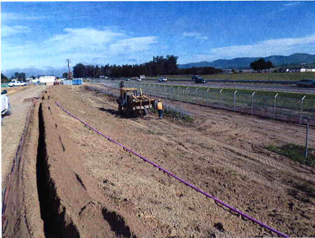
Cushman removing shrubs and existing chain link fence.