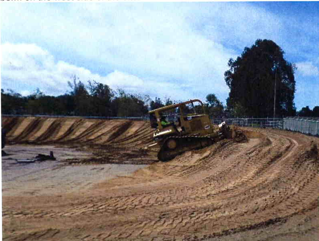
Switzer shaping berm on the west side of the side.