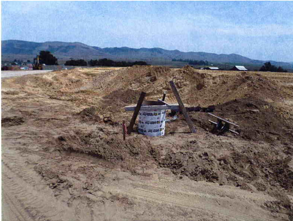
Form for street light base.