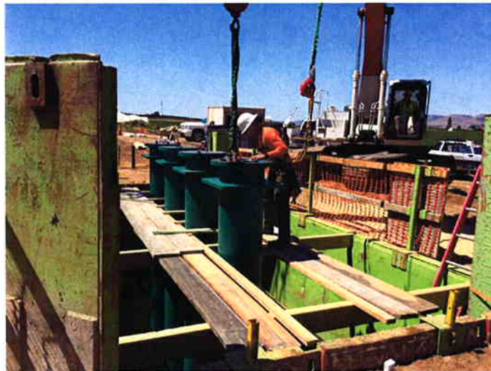
Pump Can Installation - Bottom