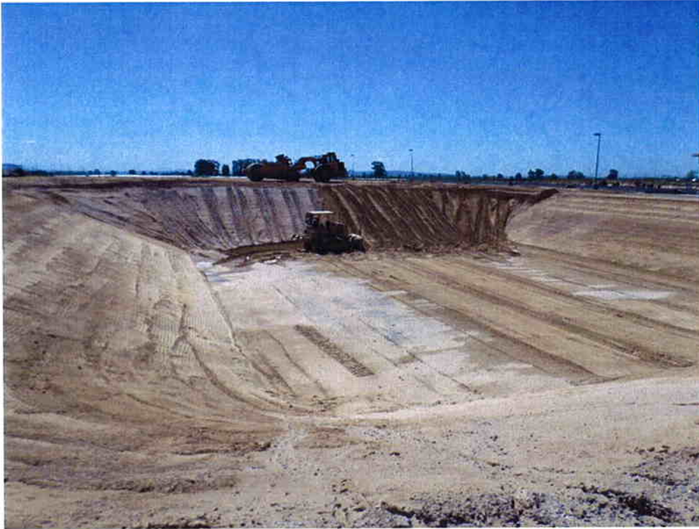
Switzer cleaning up slopes and finishing future Aeration Basin #2, which was constructed from half of existing Pond 4.