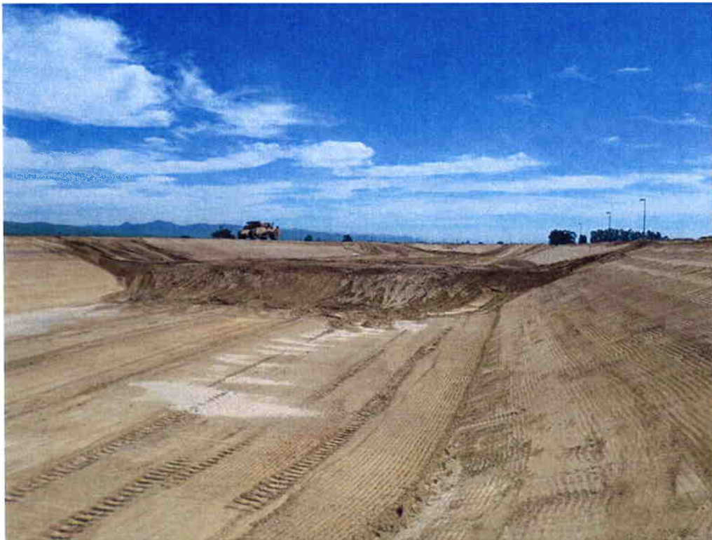
Switzer continuing to fill Pond 4 and build berm for future Aeration Basin #2.