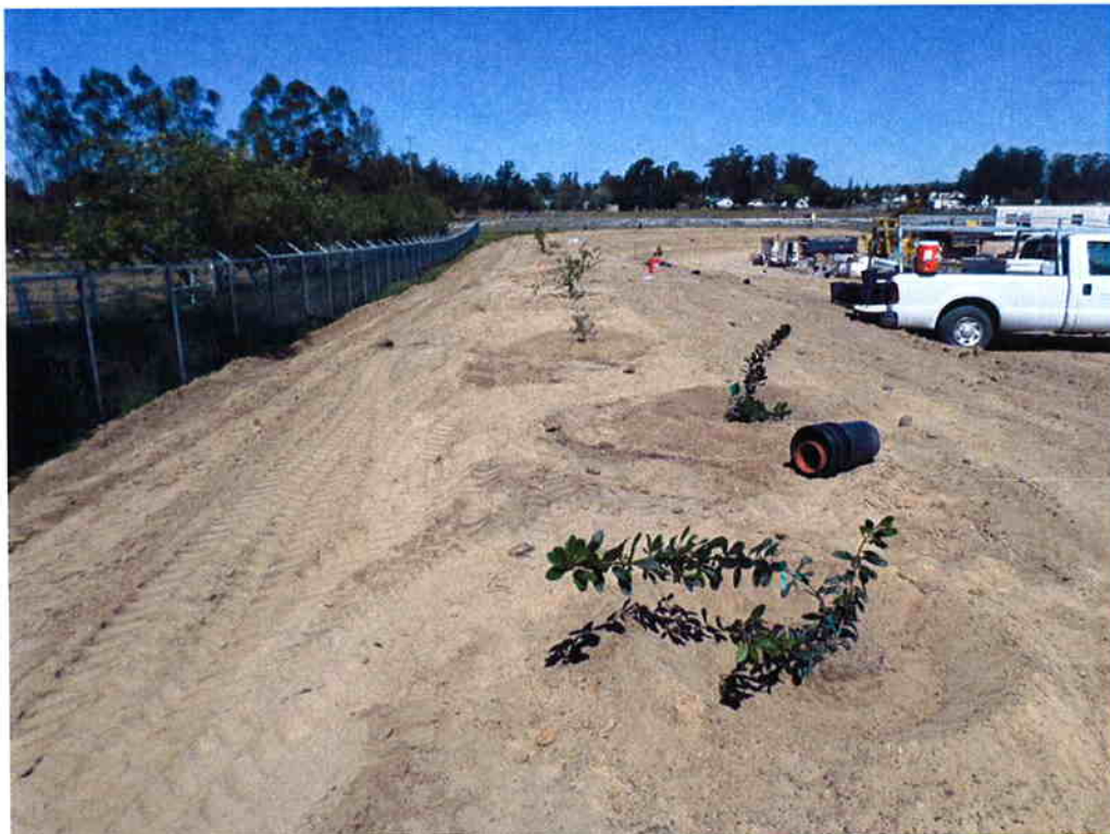
Planting new plants on east berm.