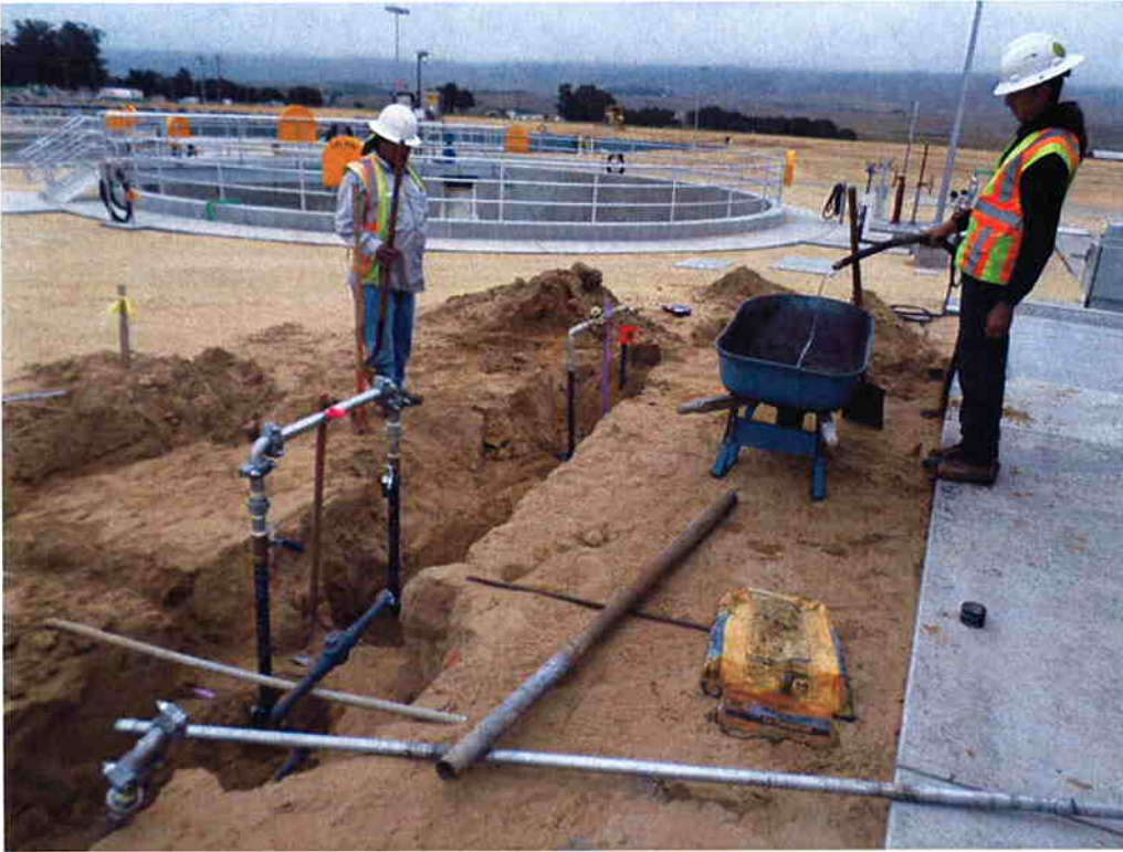
KCI Environmental installing back flow prevention assembly.