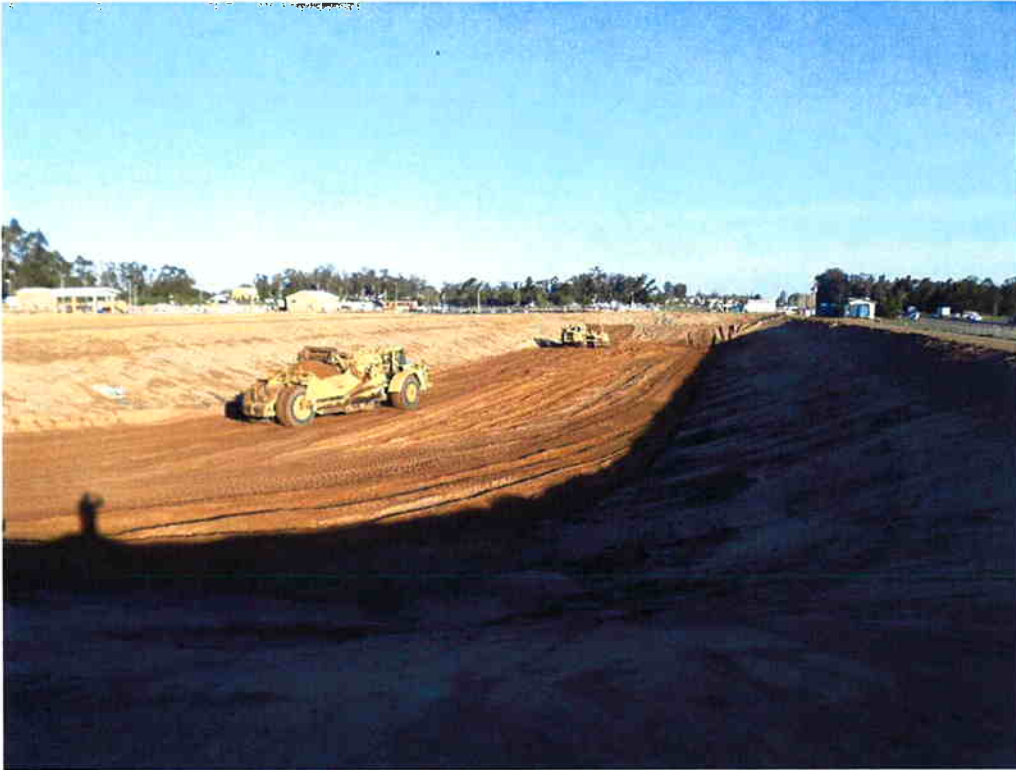
Switzer filling existing Ponds 2 & 3 with native material from construction of Ponds 9 & 10.