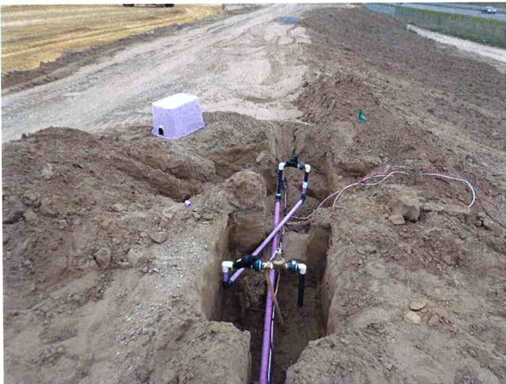
Installing piping for landscaping.