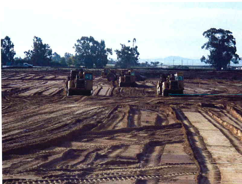
Switzer excavating material from Area F to build Ponds 9 & 10.