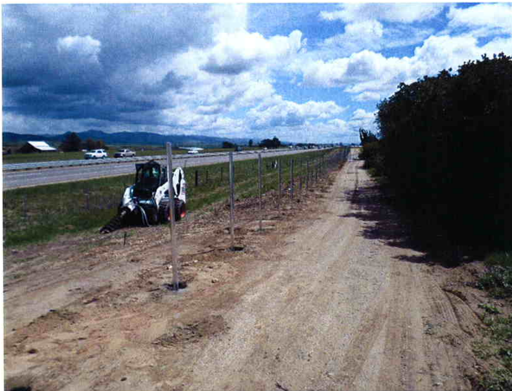
Valley Fence setting posts for the new fence along the east side of the site and Hwy 101.