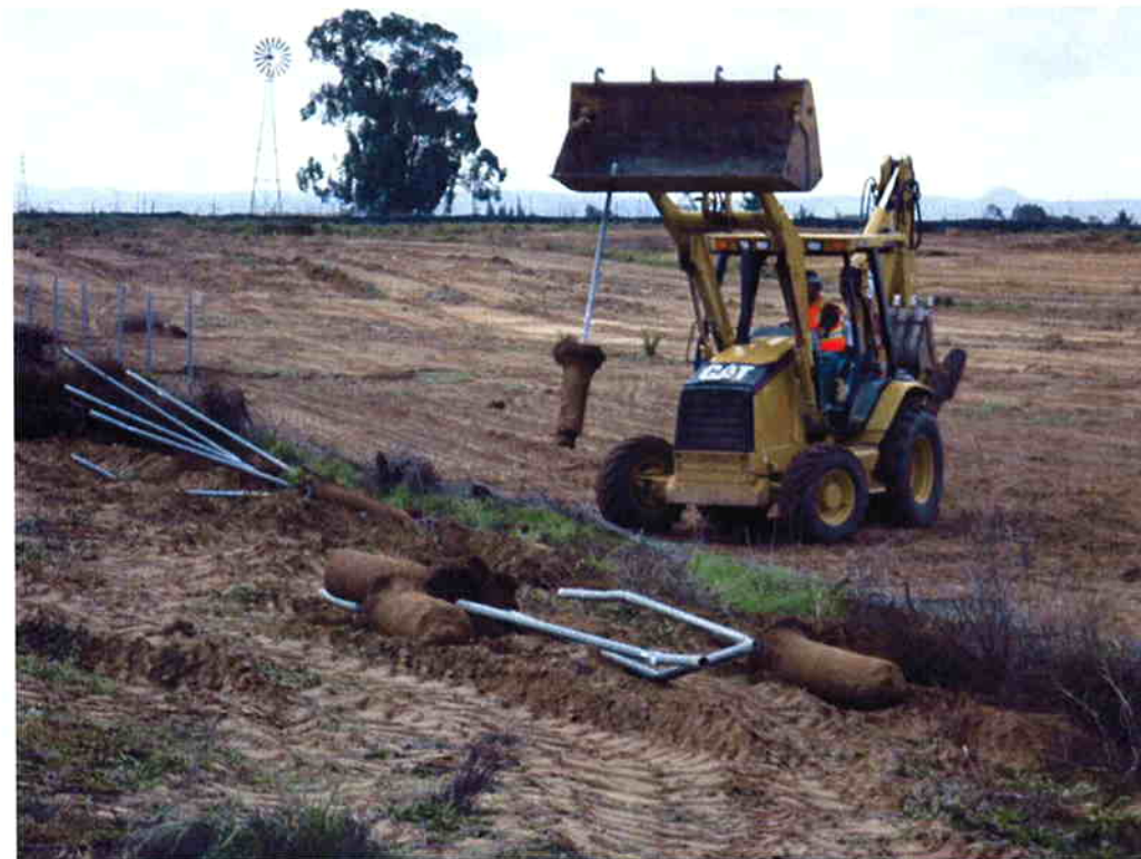
Cushman removing existing fence around Area F.