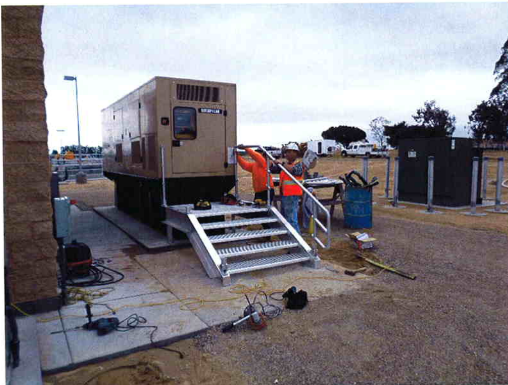
Cushman installing aluminum stairs and deck to access new emergency generator.