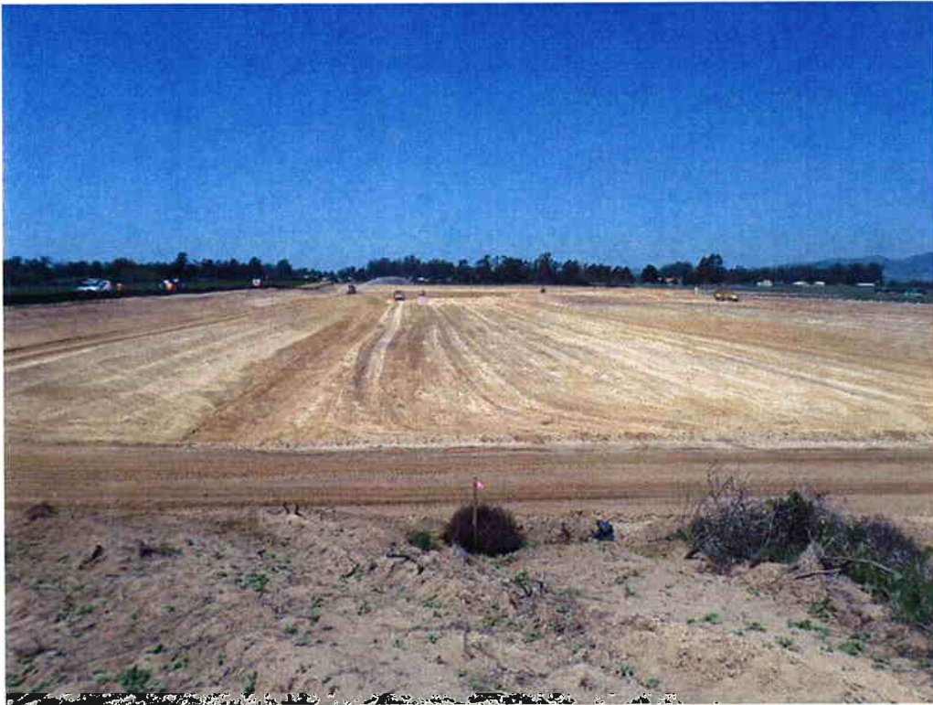
Switzer continuing to excavate material to build Ponds 9 & 10.