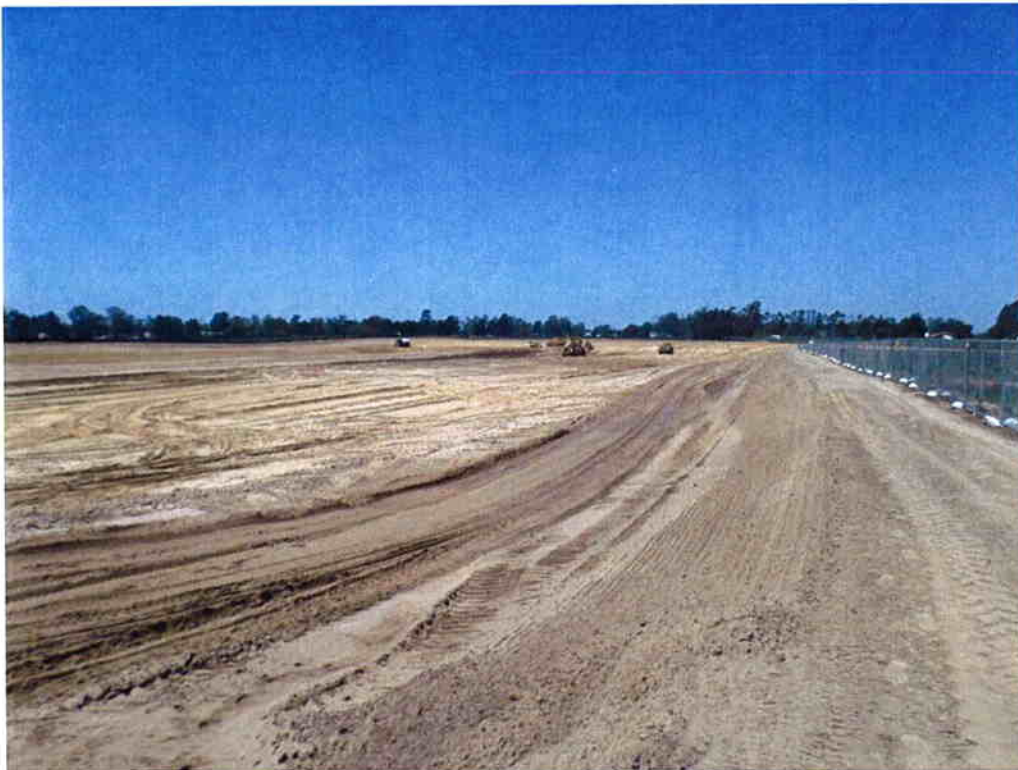
Switzer continuing to excavate in Area F to build Ponds 9 & 10.