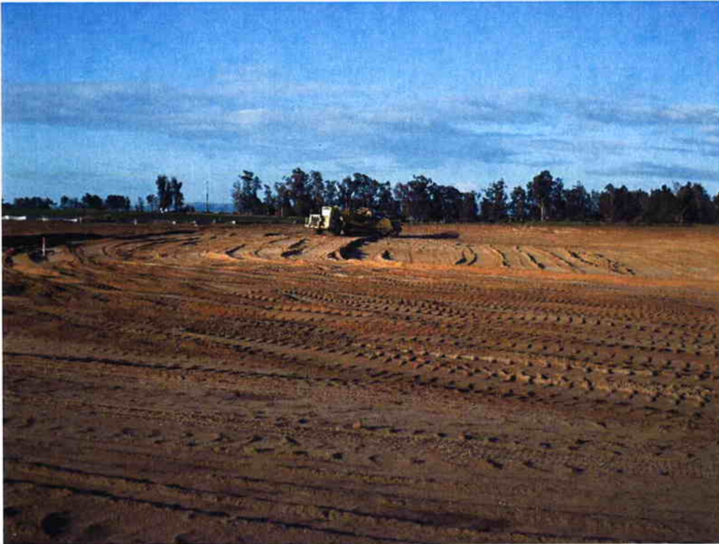
Switzer excavating Ponds 9 & 10 in Area F.