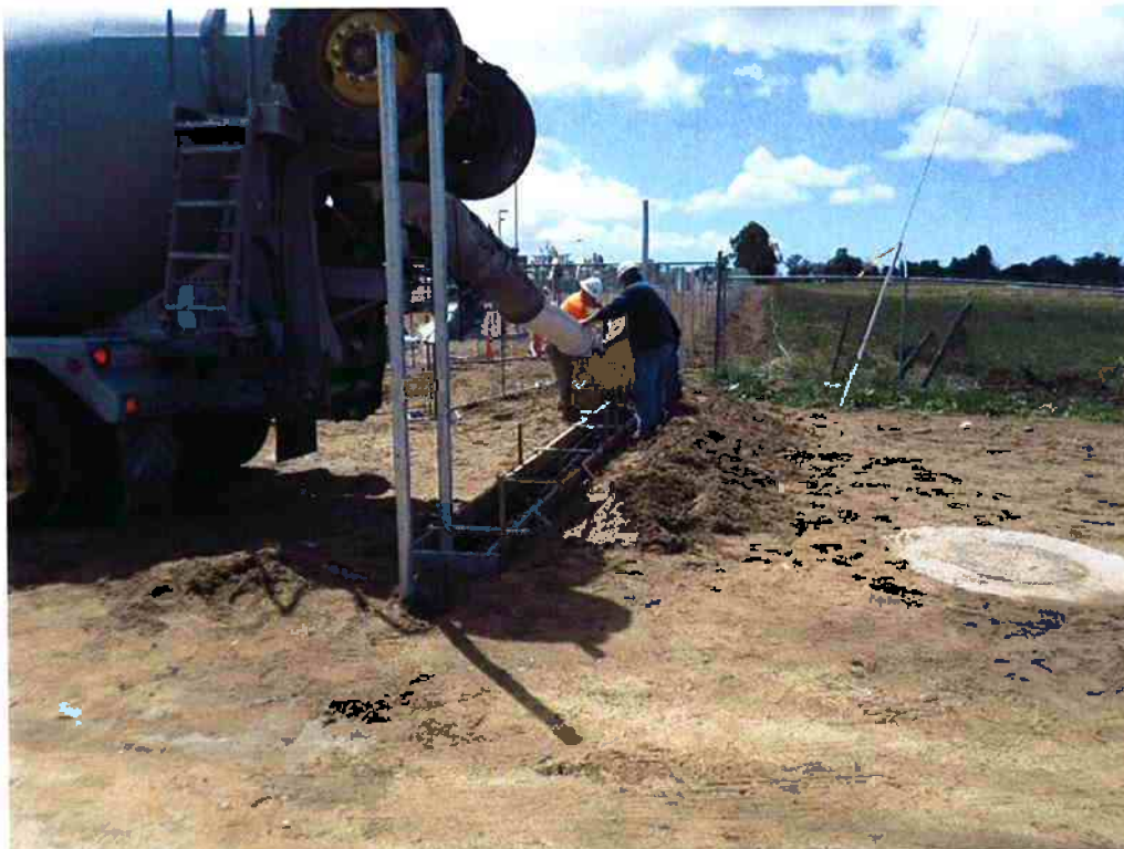
Cushman pouring concrete channel for new electric gate at site entrance.