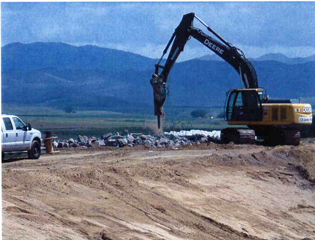
Cushman breaking up slab from existing building.