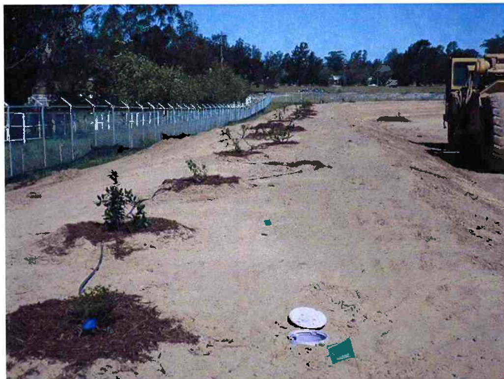
KCI Landscaping placing mulch around new plants on east berm.