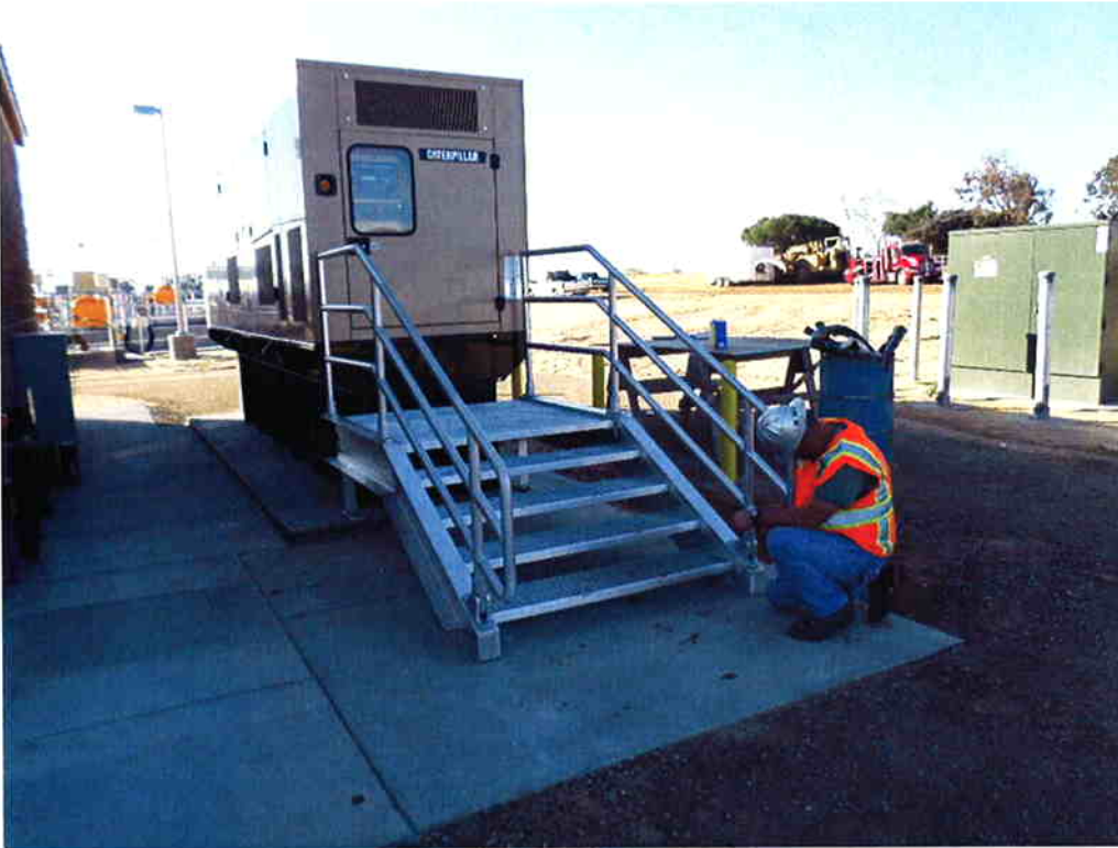
Cushman installing handrail at stairs for new emergency generator.