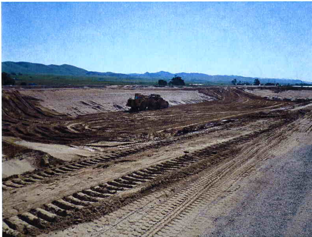
Switzer starting to backfill existing Pond 4 and build berm in the middle to create future Aeration Basin #2.