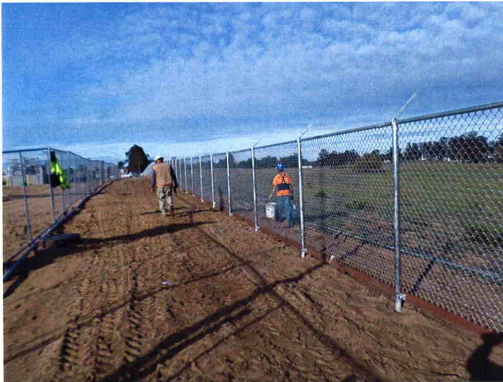
Fencing on the north side of the WWTF installed.