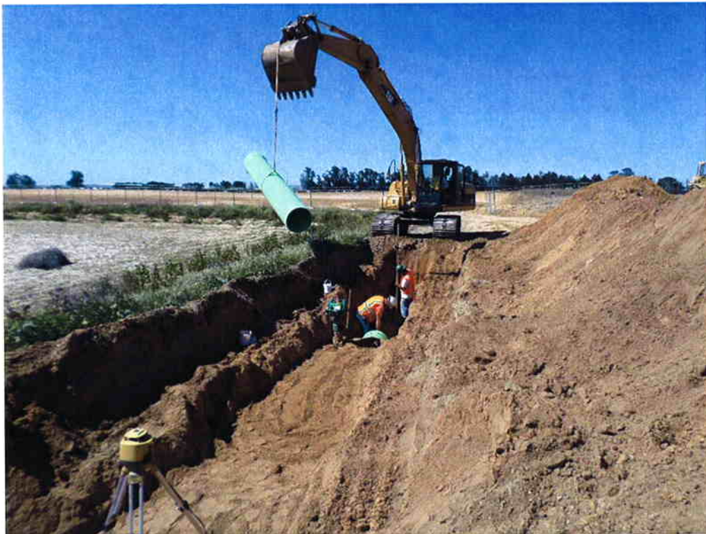
Cushman installing 24-inch SE piping to Ponds 9 & 10.