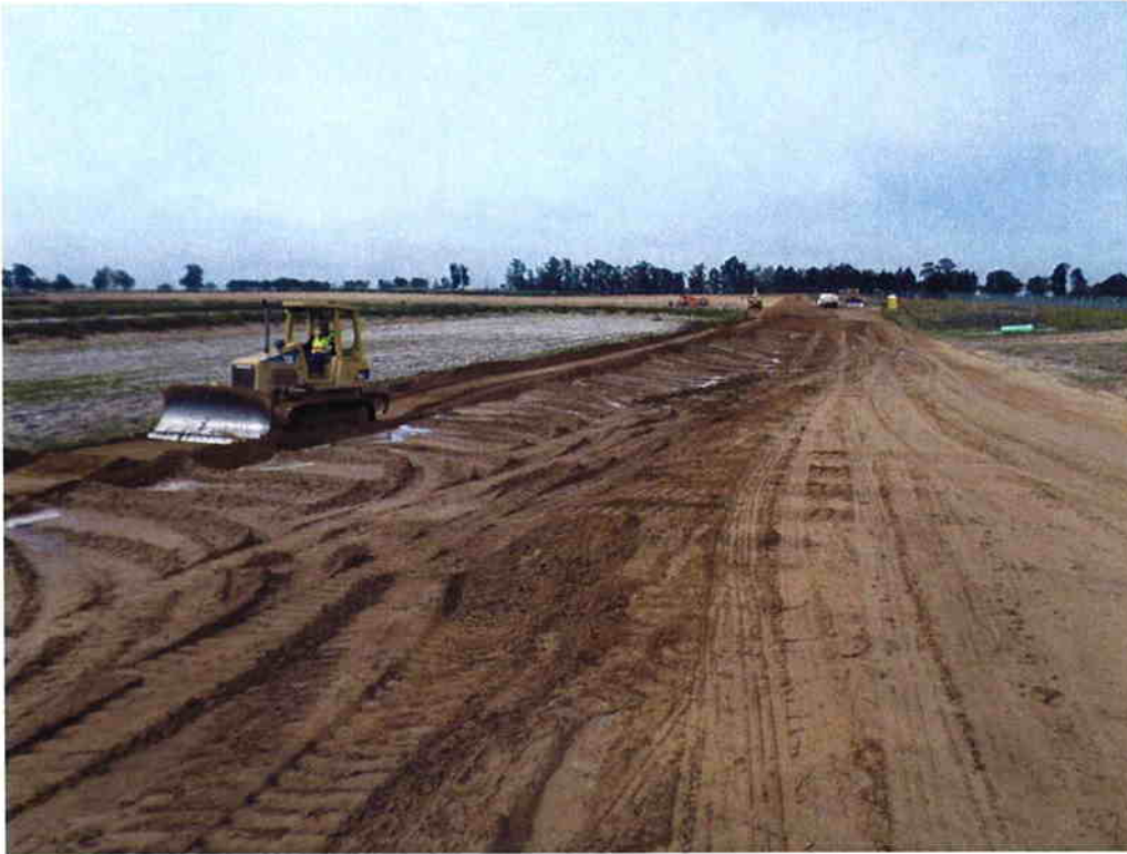
Cushman backfilling and compacting over new 24-inch SE pipe to Ponds 9 & 10.