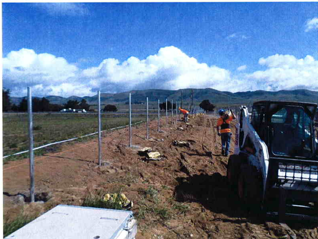
Valley Fence installing new fence on the north border of the site.