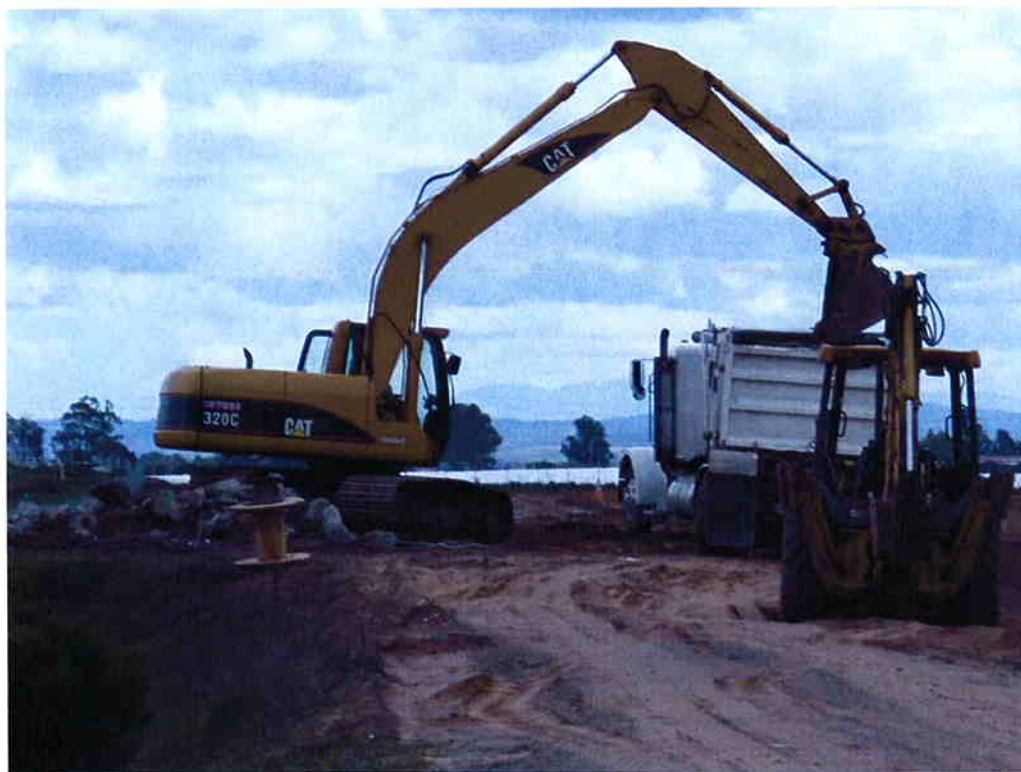
Cushman loading and hauling debris from existing building.