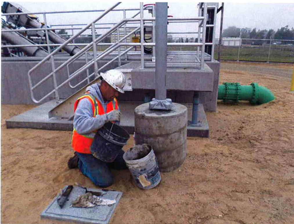
Cushman grouting street light bases.