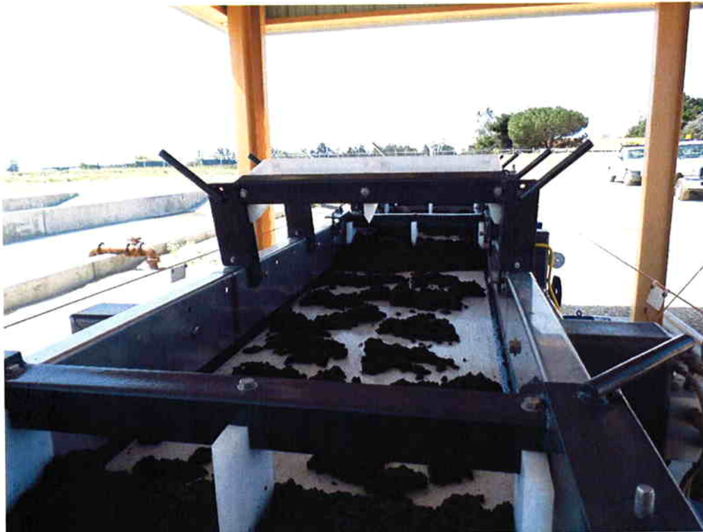
Commissioning and testing the Sludge Thickening System.