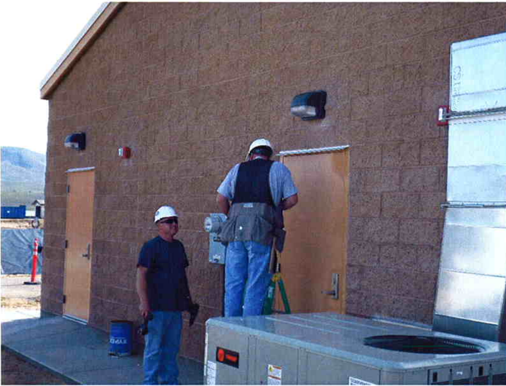
J N J Doors installing aluminum rain guards over doors.