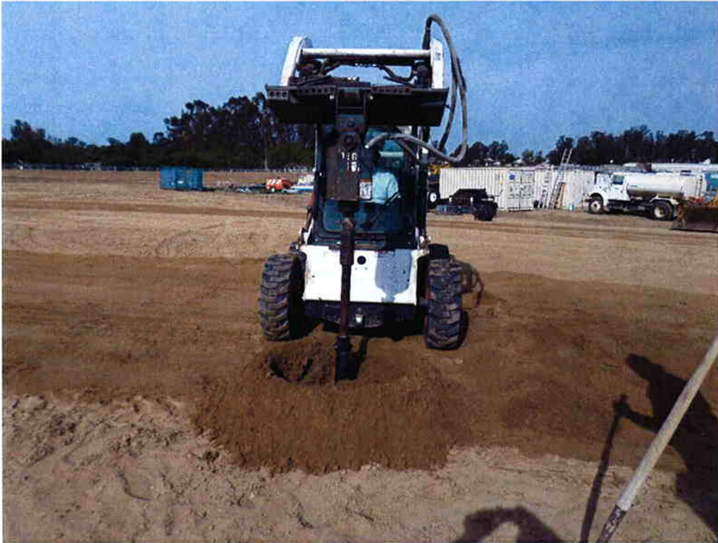
Cushman using auger to bore hole for remaining street light bases.