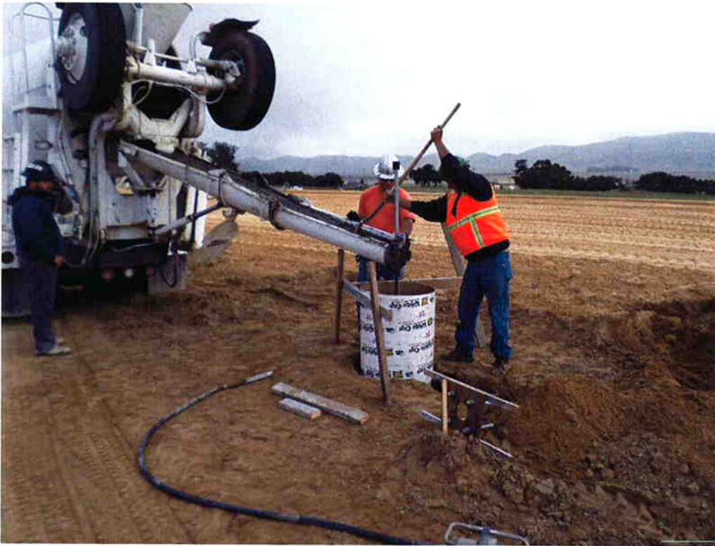
Cushman pouring bases for remaining street lights.