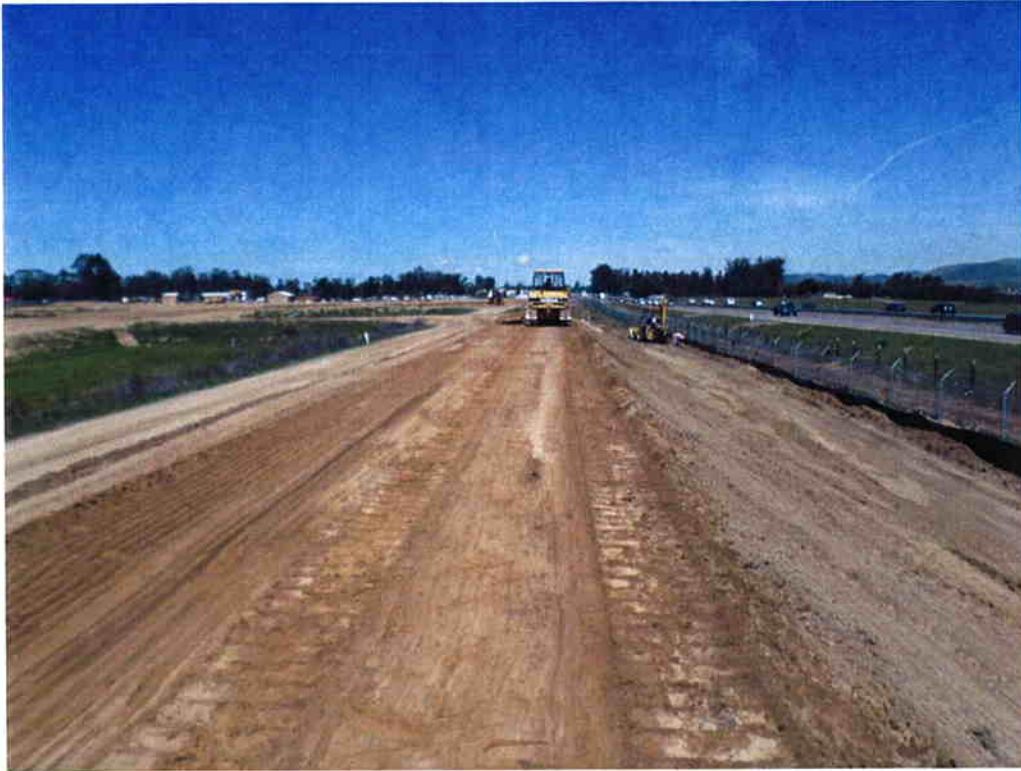
Switzer finish construction of berm on the east side of the site and Hwy 101.