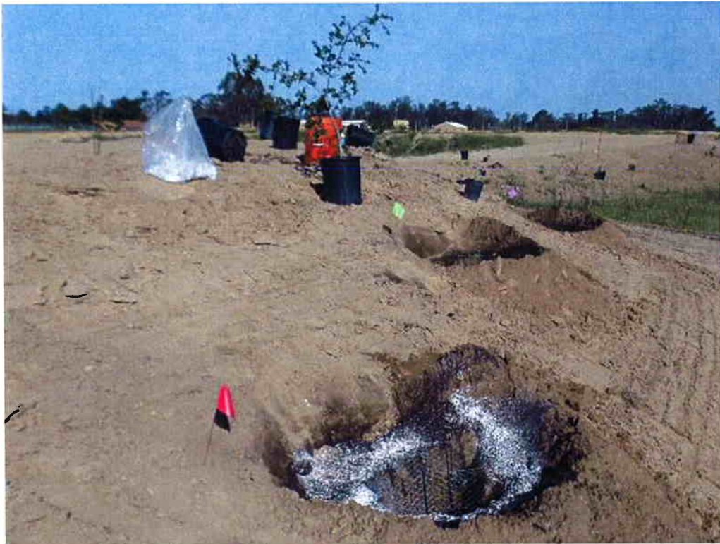
Installing plants along east berm and Hwy 101 border.