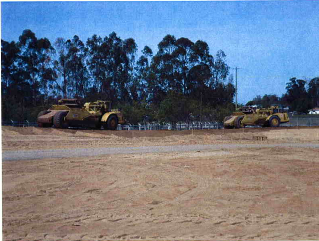
Switzer scrapers using native material from Area F, construction of Ponds 9 & 10, to build up the berm on the west side of the site.