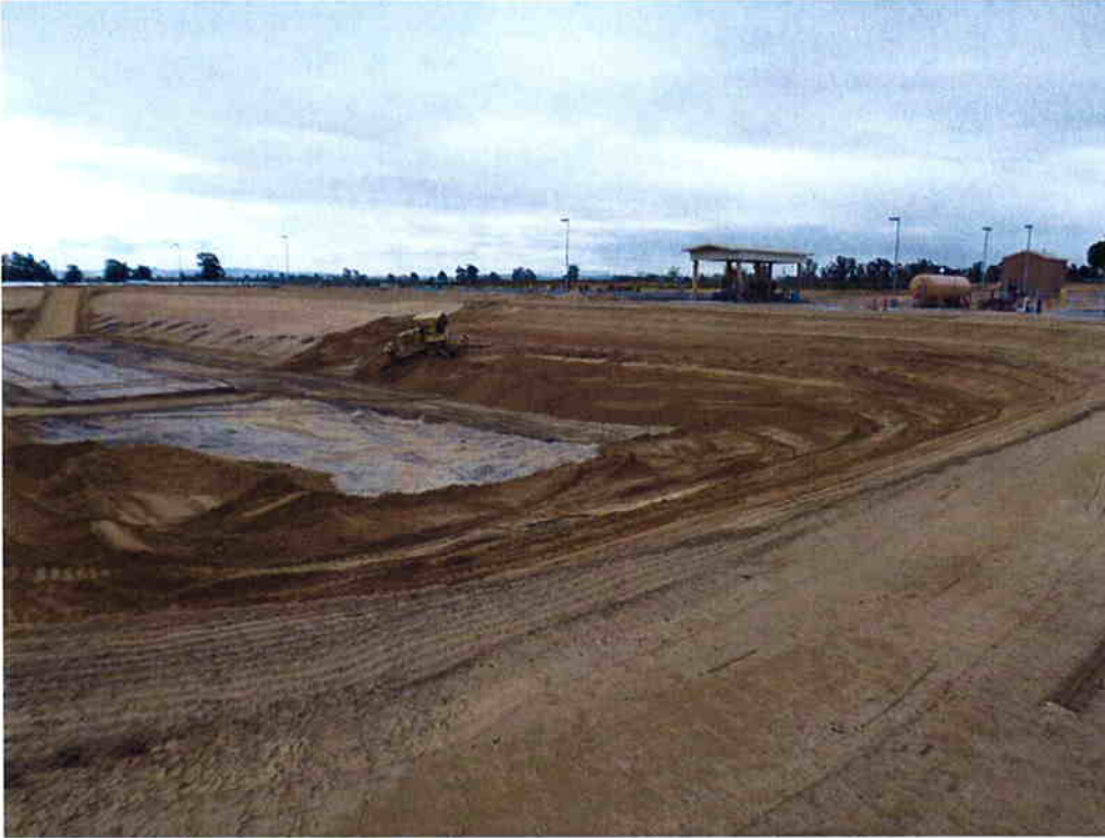
Switzer starting to cut existing banks of Pond 4 to shape it for future Aeration Basin #2.