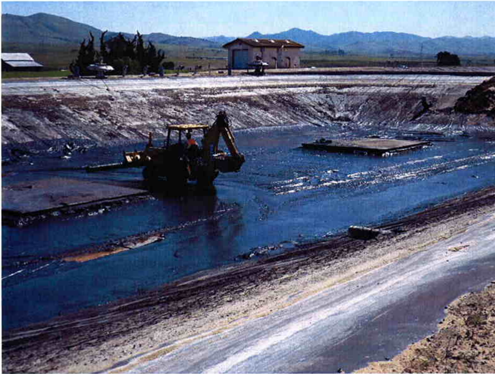
Cushman pushing and pumping sludge out of Influent Pond #2.