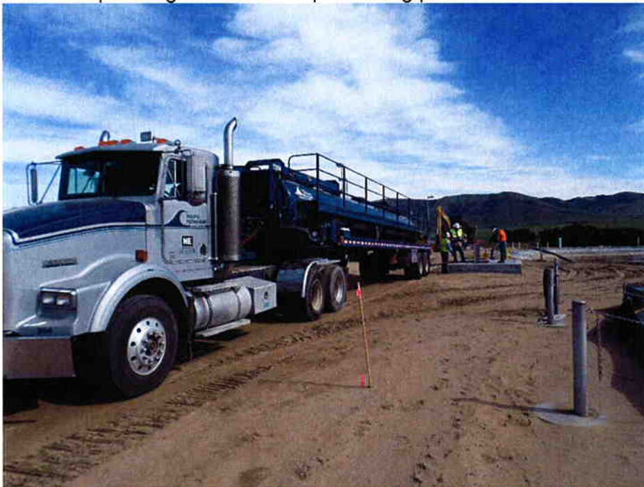
Cushman and District taking delivery of activated sludge from San Luis Obispo to seed the new treatment plant.