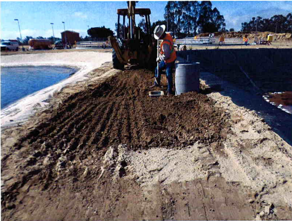
Cushman compacting around pull boxes for street lights.