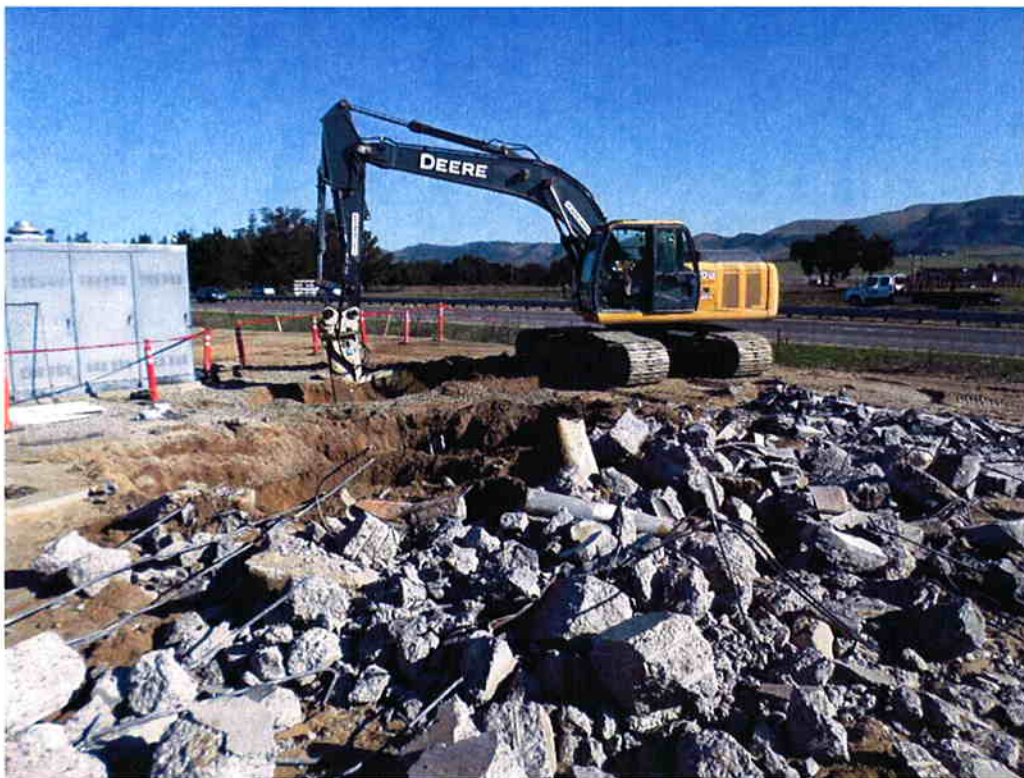
Cushman performing demolition at the existing wet well and manhole.