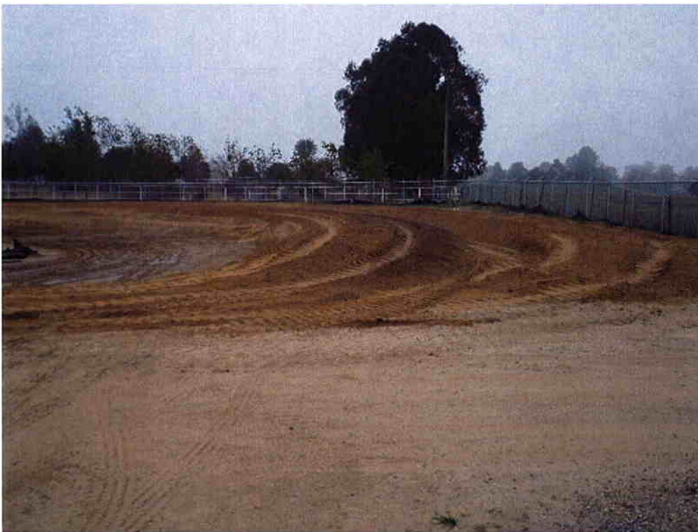
Start of new berm for landscape and screening from neighboring properties using material excavated from Alternative Y work.