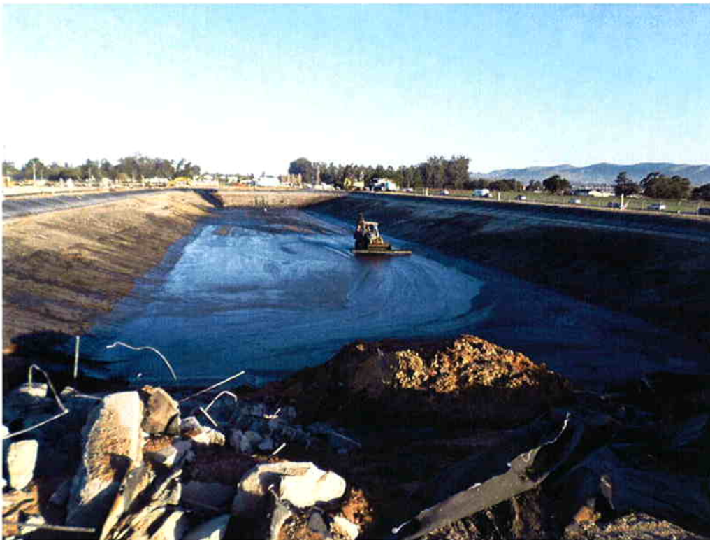
Cushman pushing sludge to pump in Influent Pond #3.