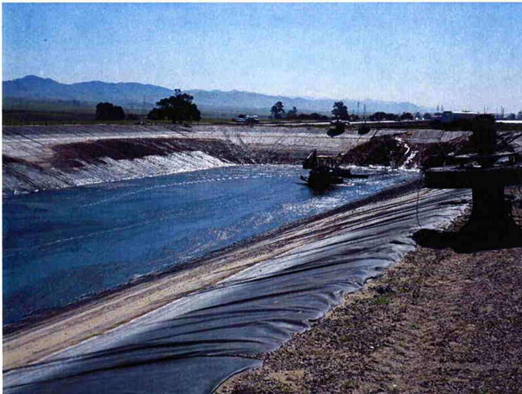
Cushman removing sludge from Influent Pond #3.