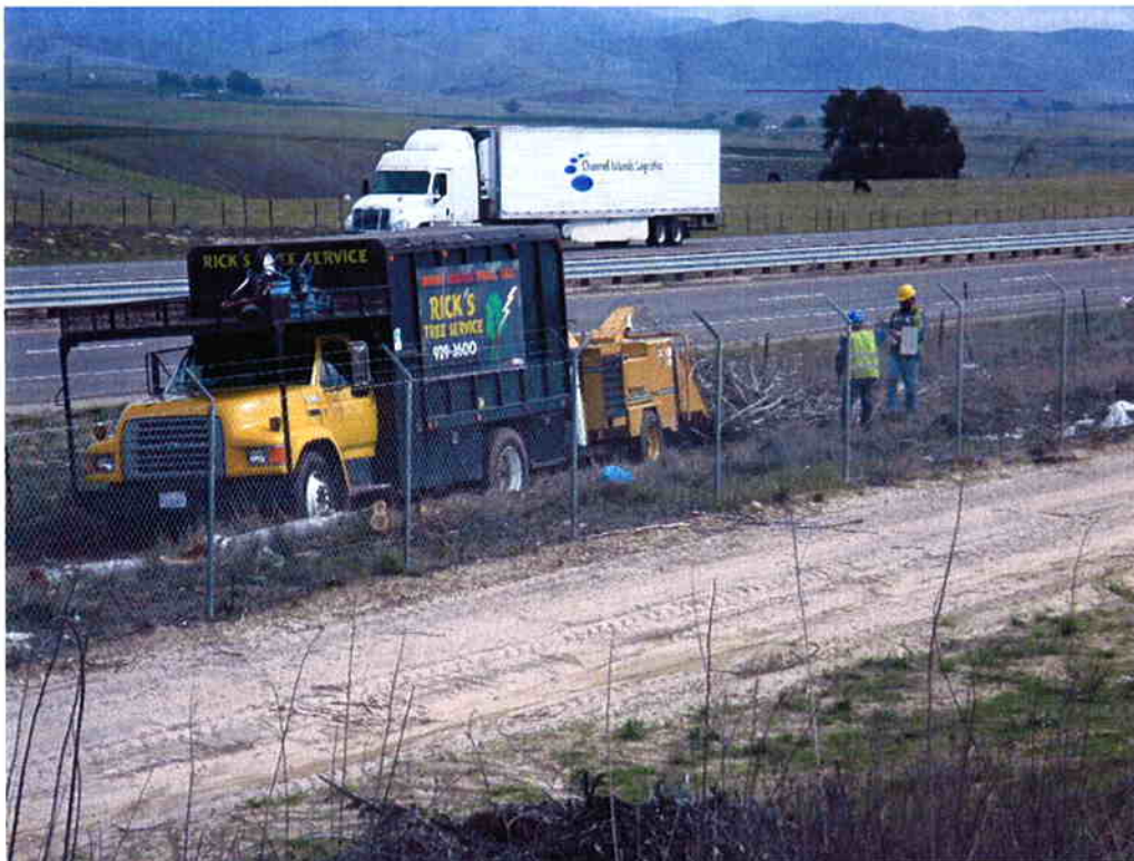
Rick's Tree Service removing trees from the east side of the WWTF, along Highway 101, as part of the new landscaping plan.