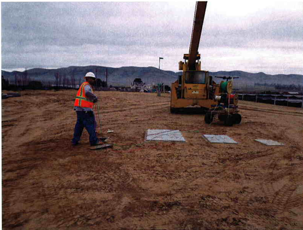
Bergelectric pulling wire for street lights.