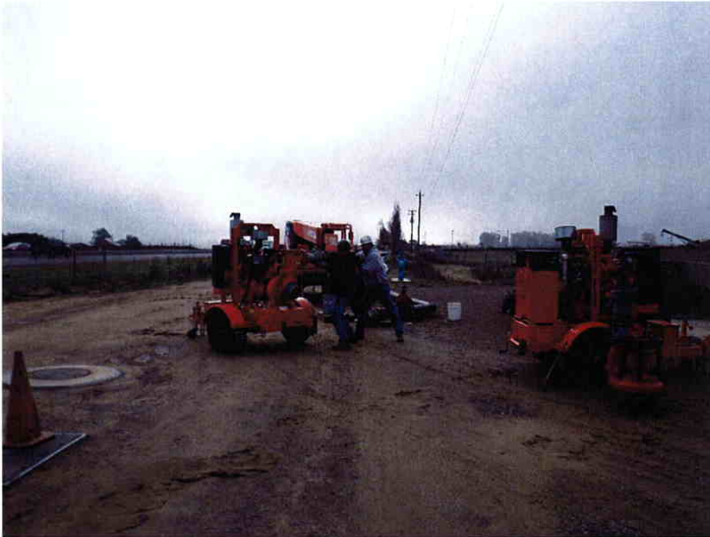
Cushman setting up temporary pumps for the tie-in to the new treatment plant.