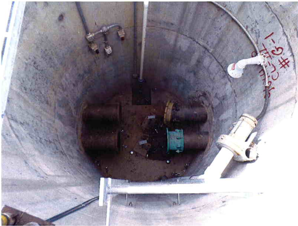
Cushman performing demolition of existing pump station and grinder at influent to old treatment facility.