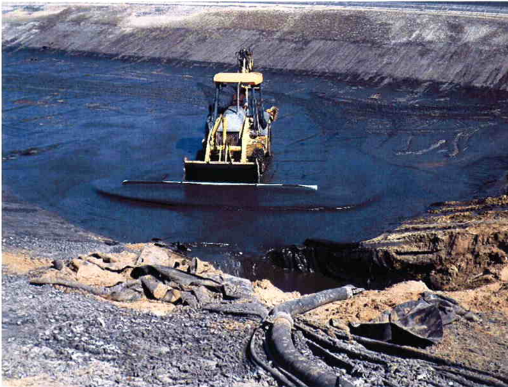
Cushman pushing sludge to pump in Influent Pond #3.