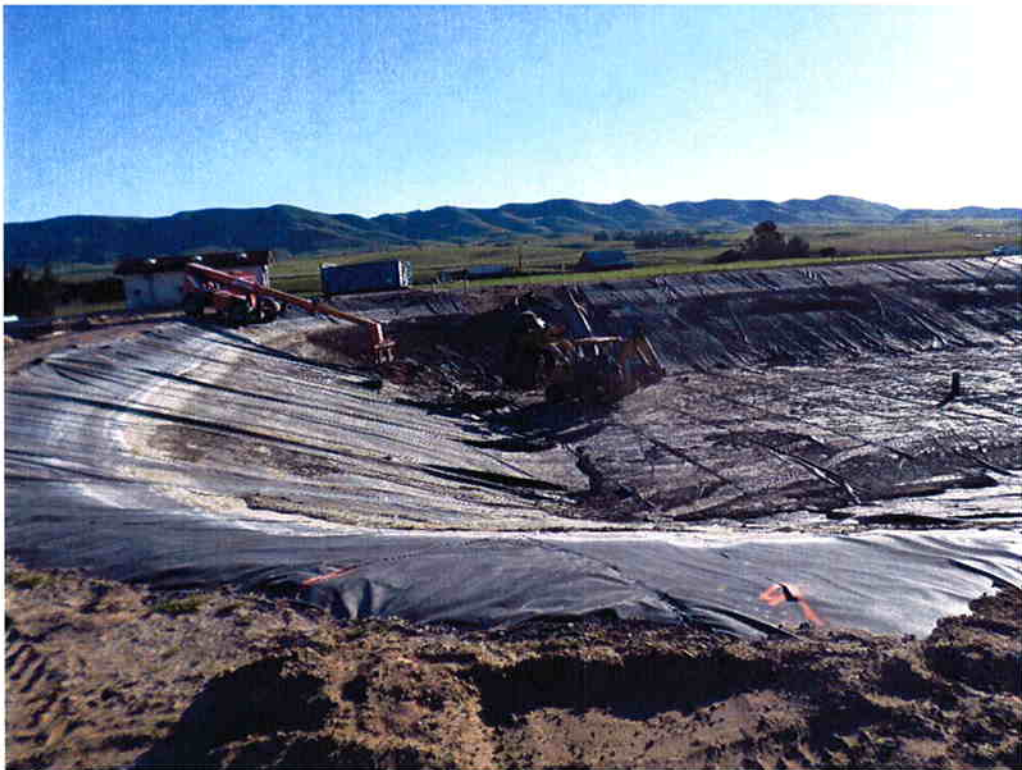
Cushman starting removal of the liner in Influent Pond #3.