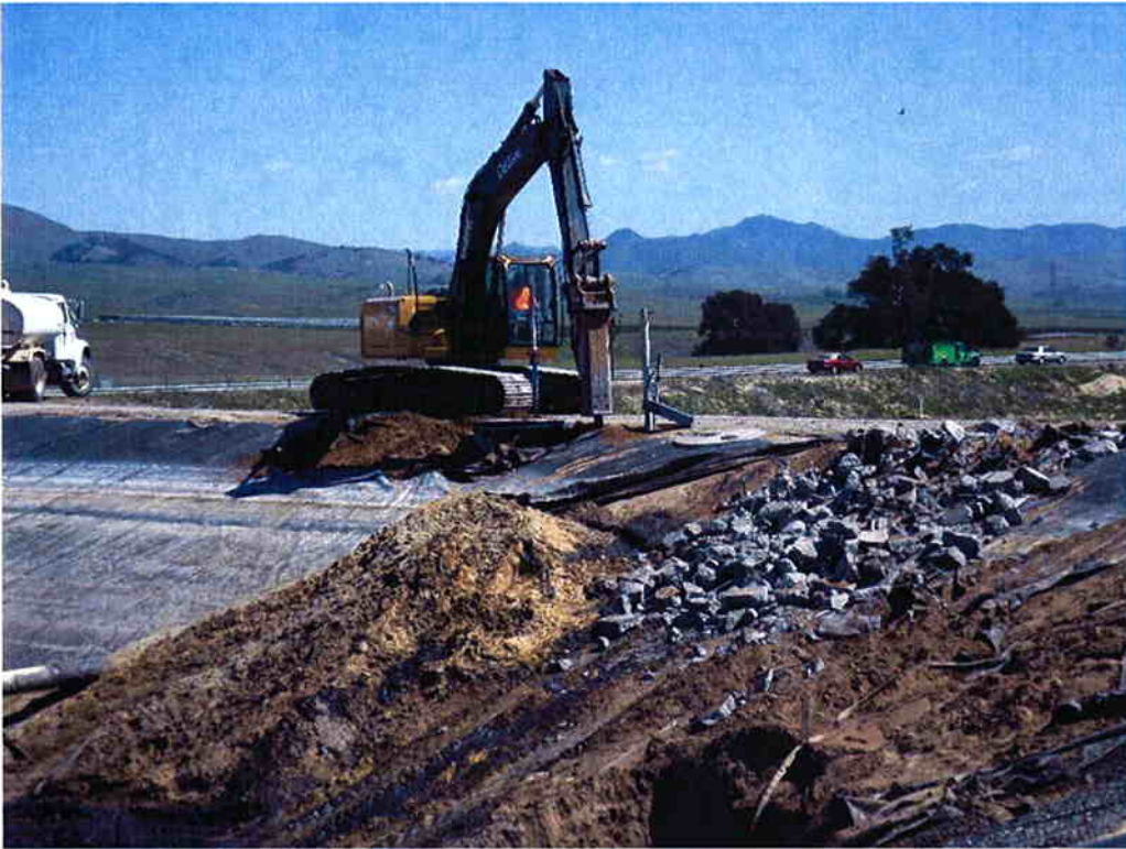
Cushman performing demolition of concrete structures at existing Influent Ponds.