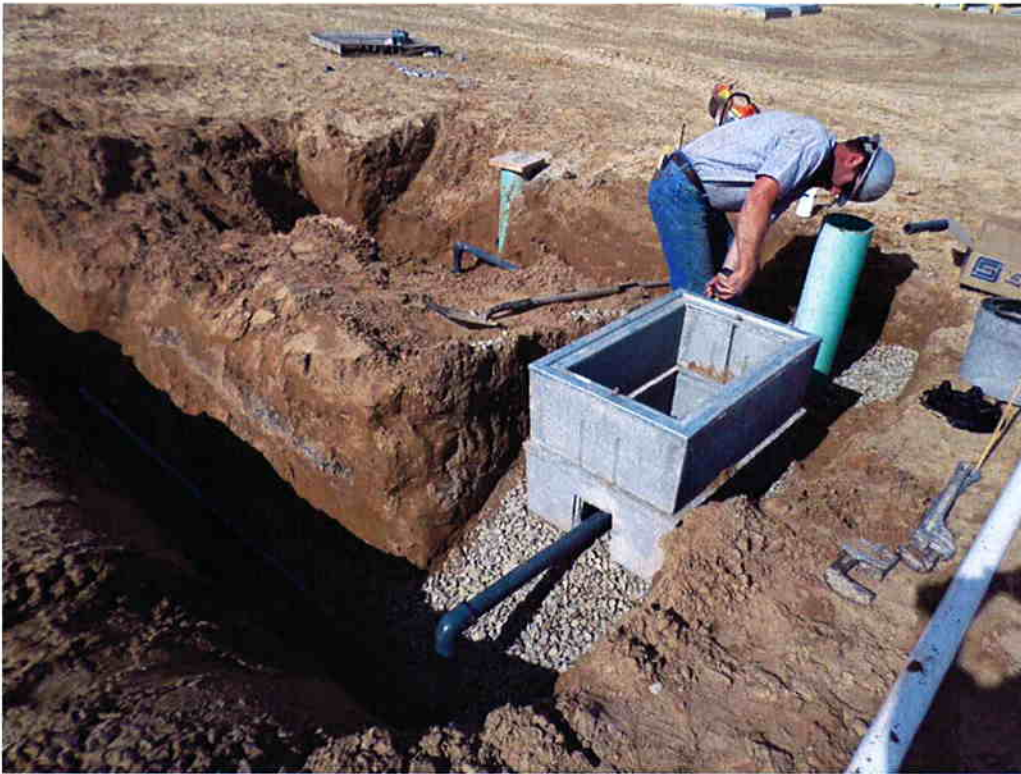
Cushman installing a pressure reducer on the 2-inch potable waterline.