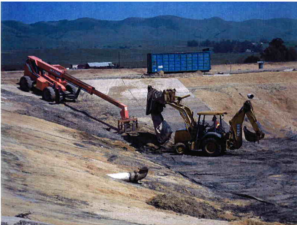
Cushman removing liner from Influent Pond #4.