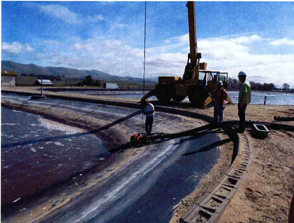
Cushman setting up pumps to pump sludge out of Influent Pond 2.