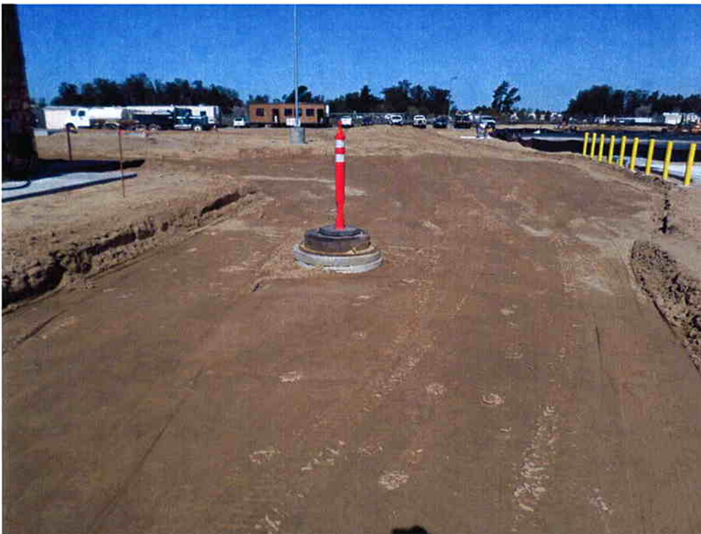
Mark Switzer Excavating cutting new site roads to subgrade.