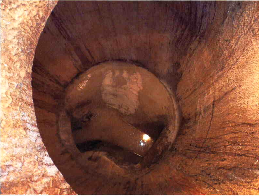
Plug complete prior to manhole being put back into service.