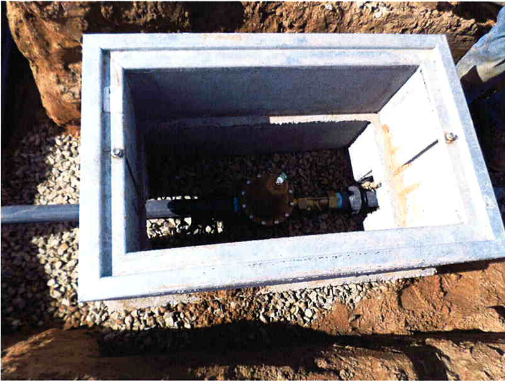
Pressure reducing installed on the 2-inch potable waterline.