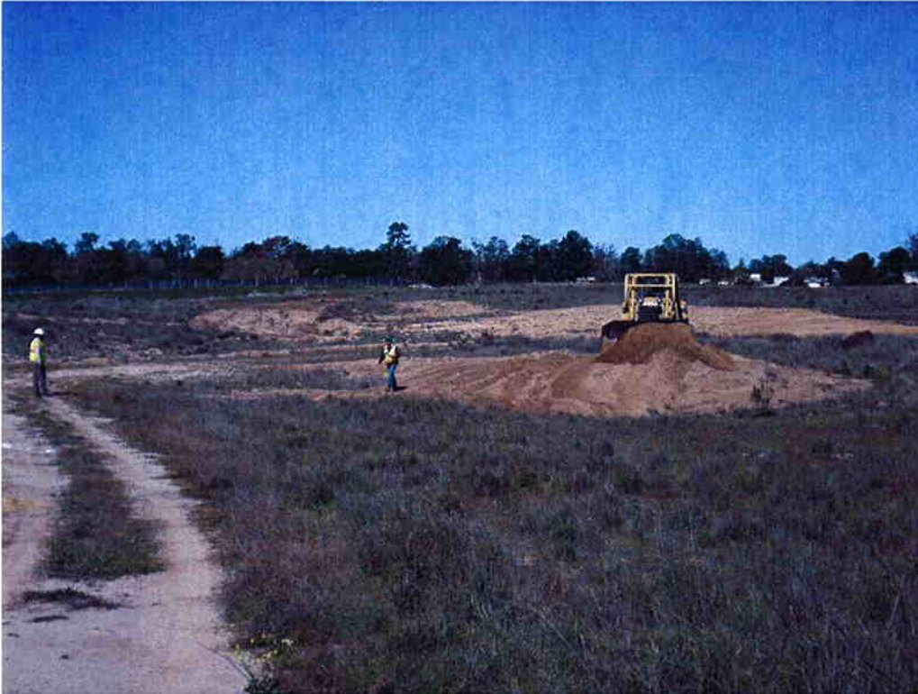
Rincon staff on site during clear and grub by Mark Switzer Excavating for Alternative Y work to build new Infiltration Ponds 9 & 10.