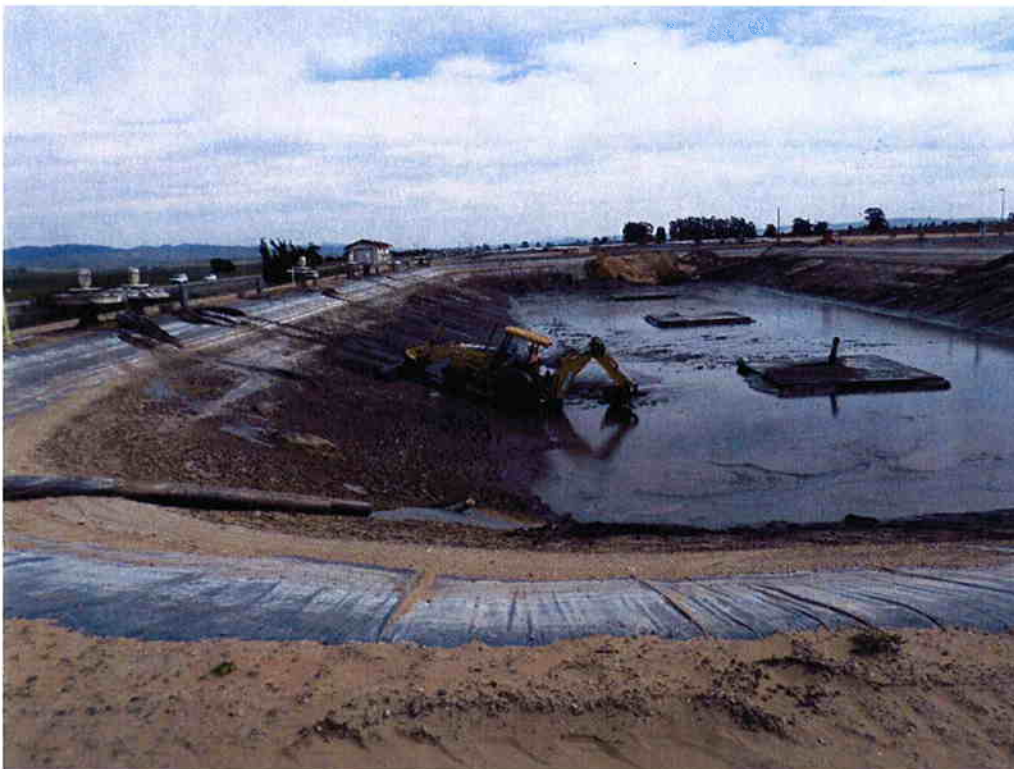
Cushman removing sludge from Influent Pond #2.