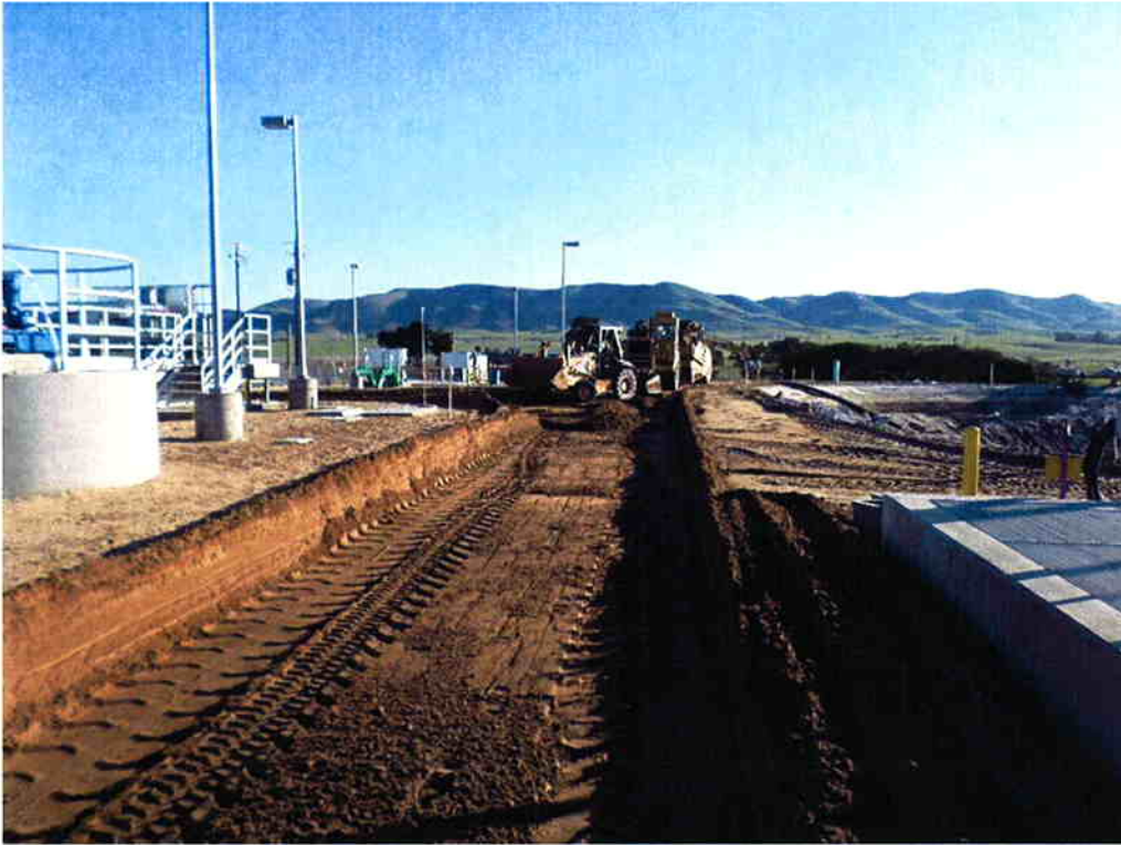
Mark Switzer Excavating cutting the new road to subgrade near the Headworks.