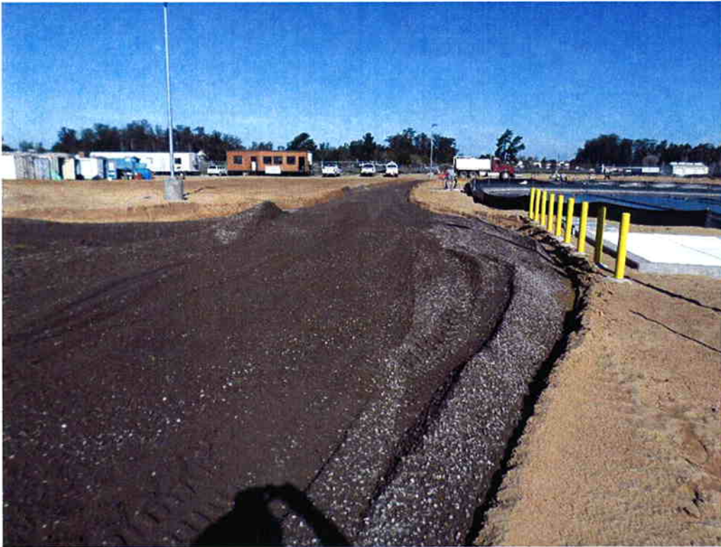
Mark Switzer Excavating placing aggregate base material for roadways around the site.