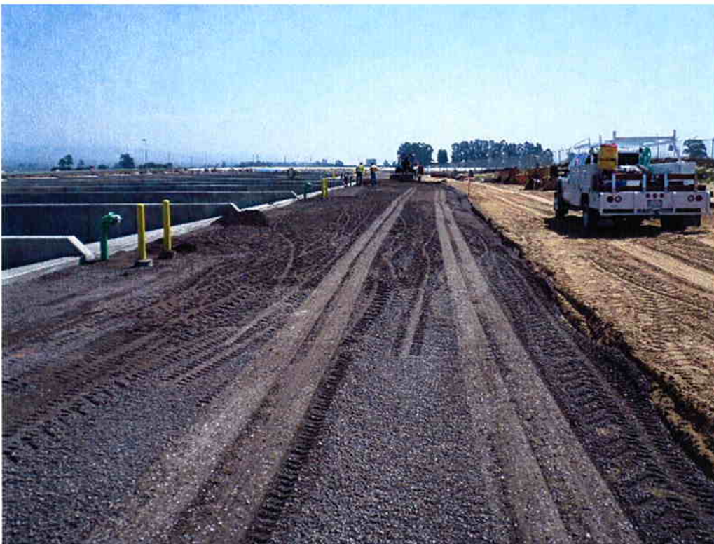
Mark Switzer Excavating placing aggregate base for roadway at the Sludge Drying Beds.