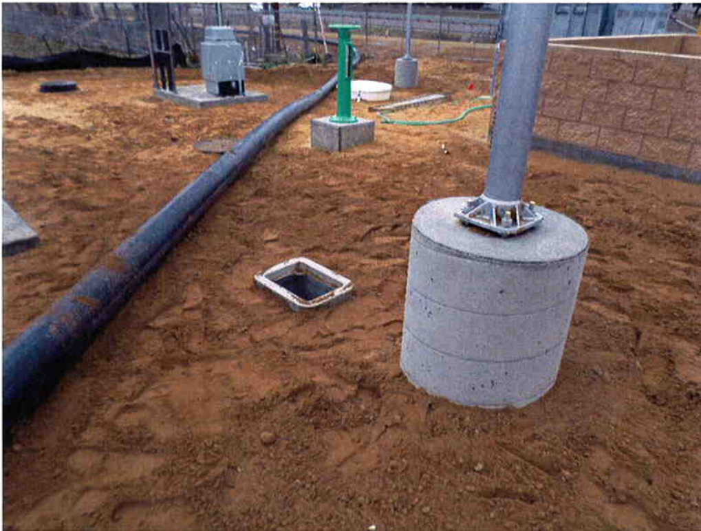
Bergelectric installing street light pull boxes and the temporary bypass pipe for the tie-in to the new treatment plant.