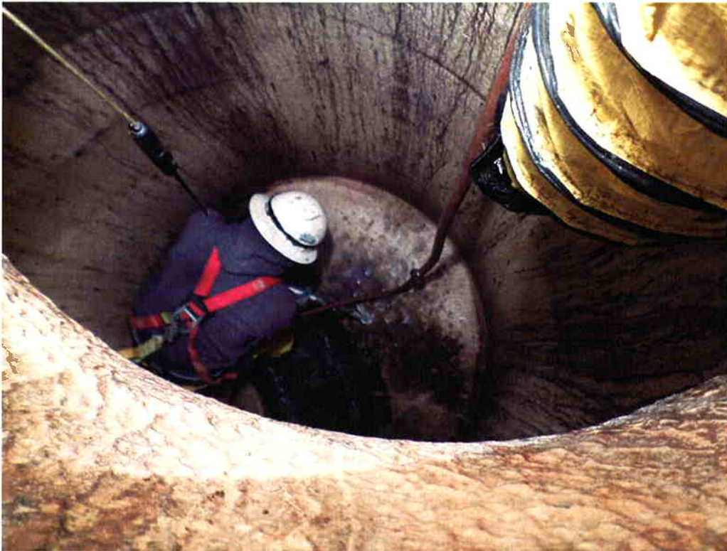
Cushman working at night on March 5, 2014 to break out grout plug in influent manhole, which was installed previously by R. Baker as part of the South Frontage Road Sewer Project in anticipation of this connection to the new WWTF.