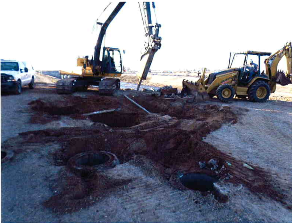
Cushman performing demolition of existing manholes.