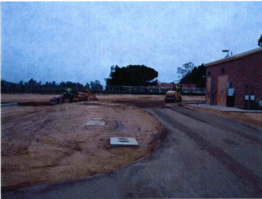
Mark Switzer Excavating compacting aggregate base material for roadways around the site.