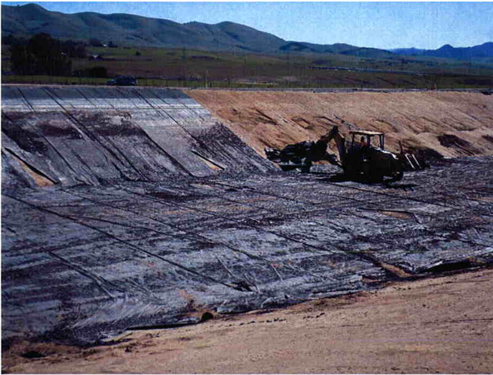
Cushman removing liner from Influent Pond #3.