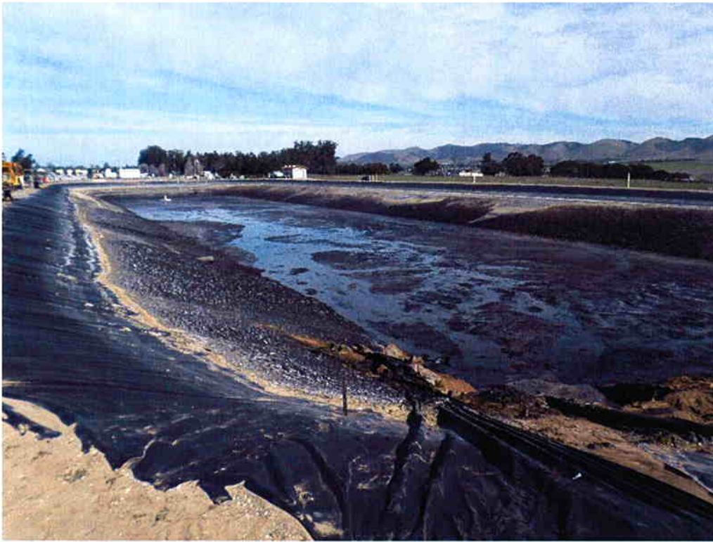
Cushman pumping sludge out of existing Influent Pond #3.