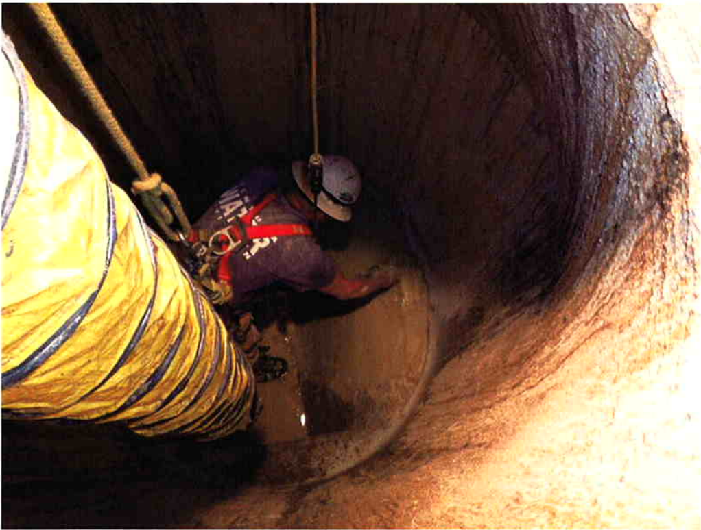
Cushman plugging the existing influent pipe penetration in the influent manhole after the plug for the new influent pipe was removed.