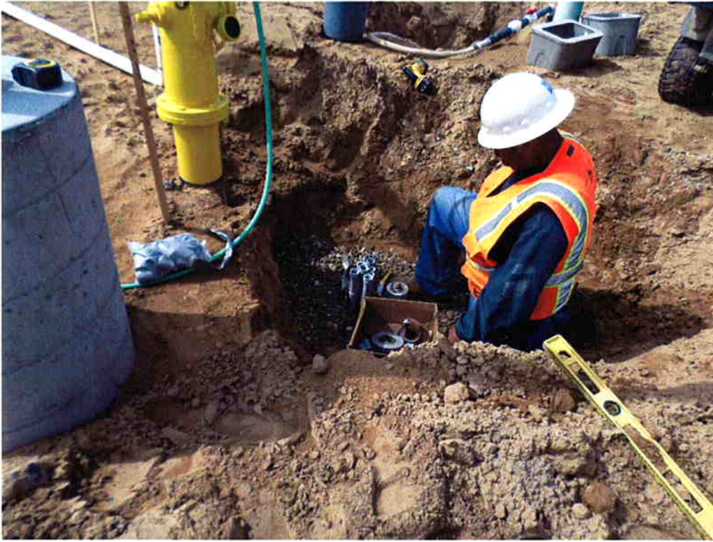
Bergelectric installing street light pull boxes.