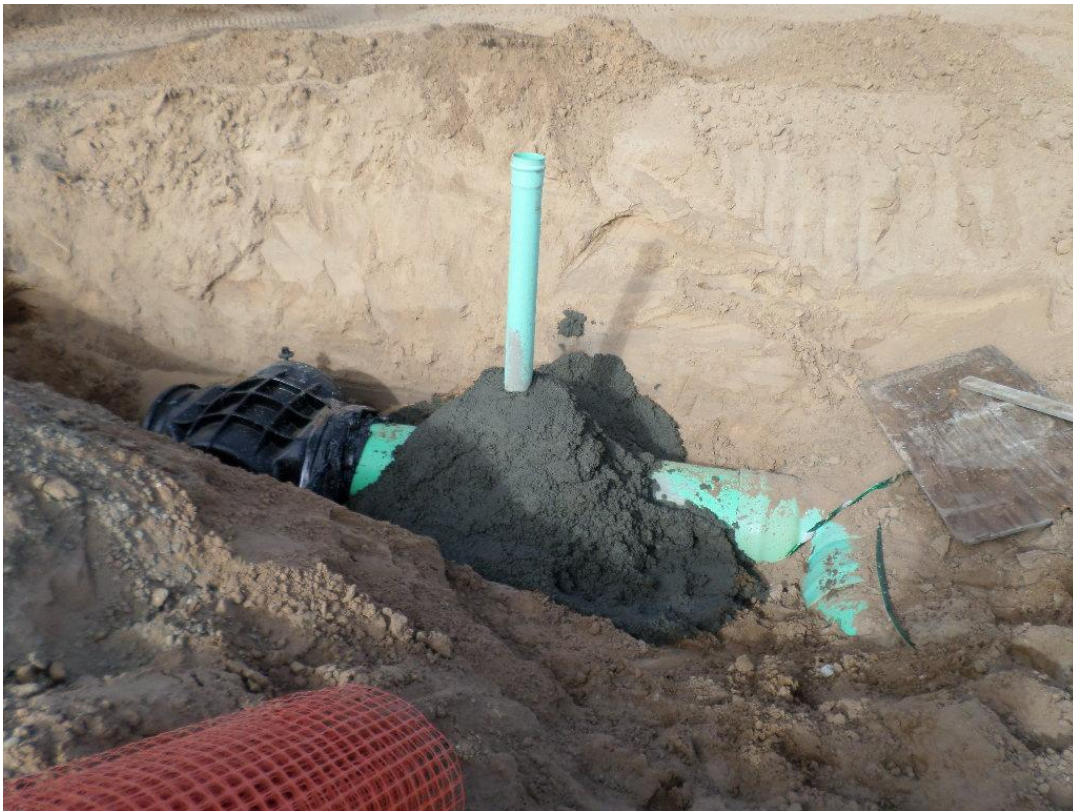
Concrete encasement around a cleanout on the 24-inch SE2 pipe line.