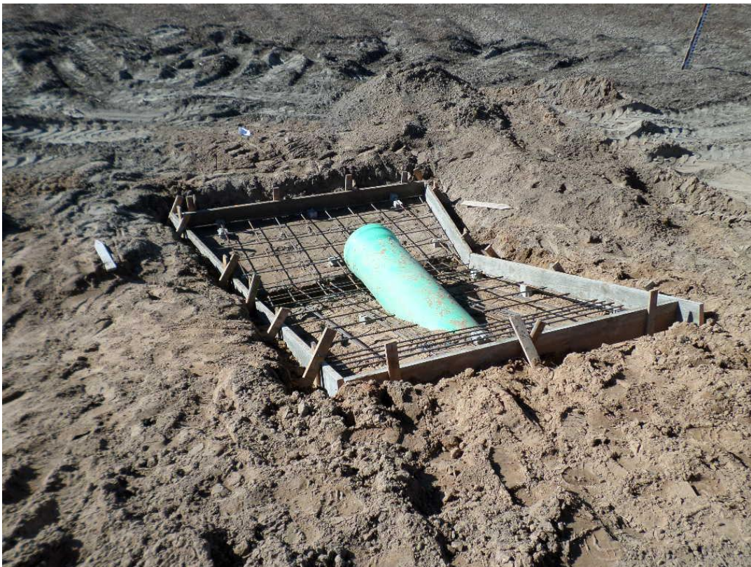
Reinforcing in place for splash pad at inlet structures.