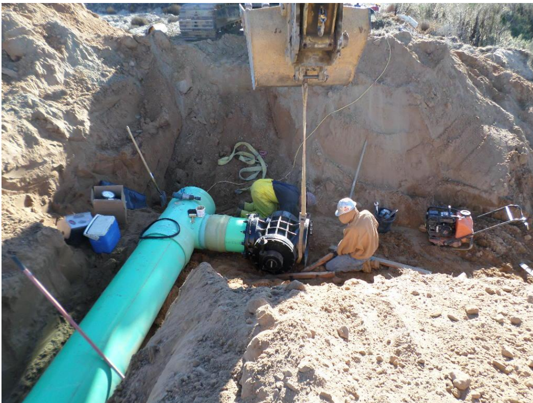
Cushman installing 18-inch inlet piping and valve from the 24-inch SE2 pipe to one of the Infiltration Ponds.