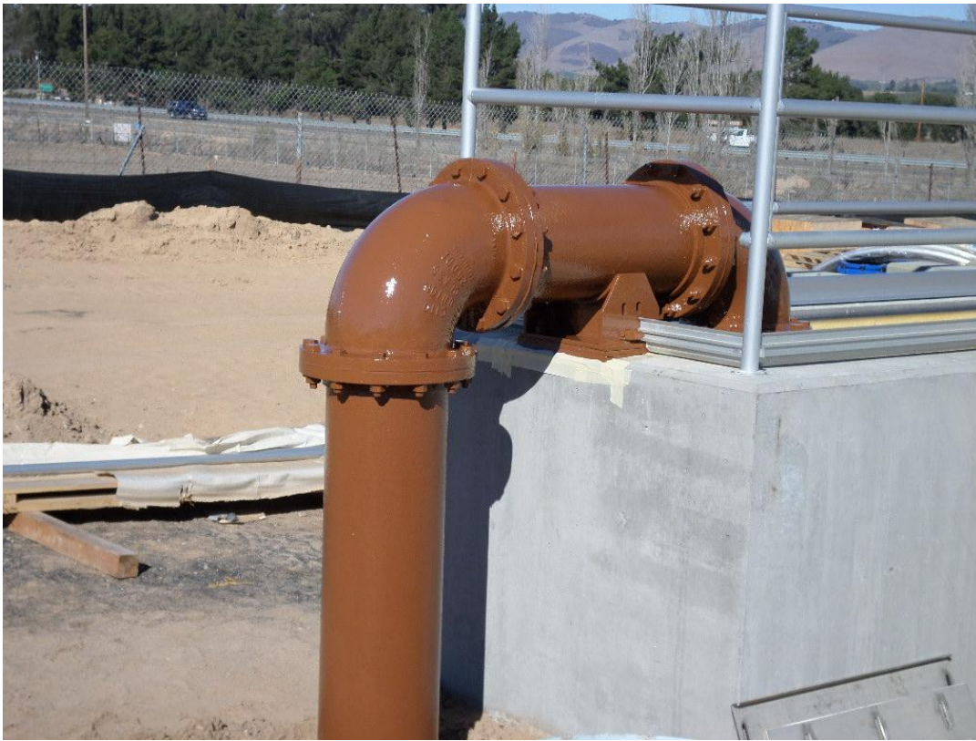
Finish coating on the RAS piping.