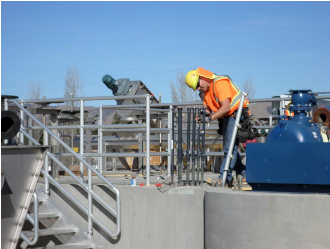
Bergelectric installing PVC coated conduit.