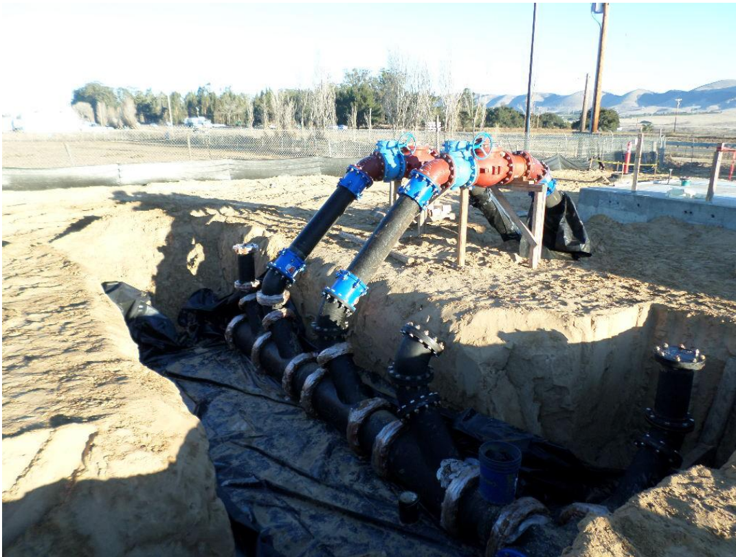
Cushman installing the 16-inch RW piping from the Influent Pump Station to the Headworks.