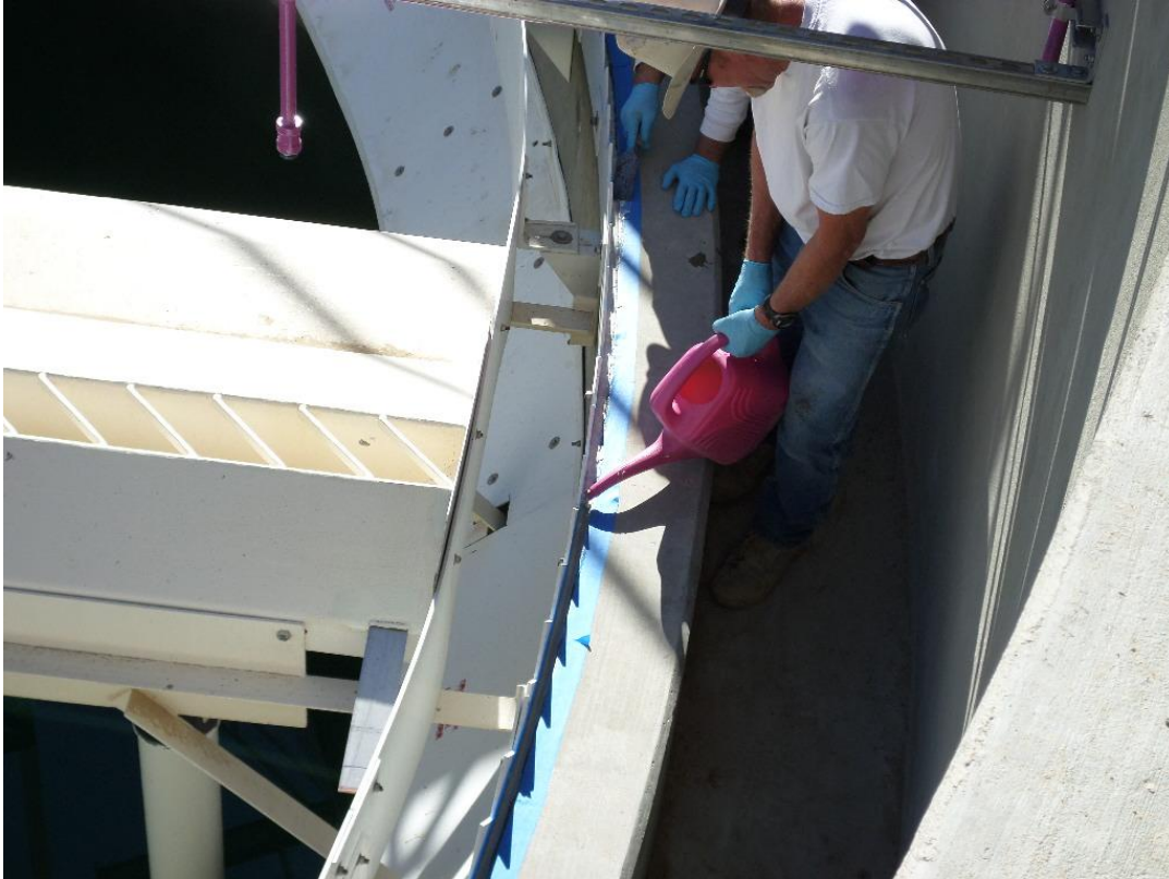
Cushman applying sealant to weirs in clarifiers.