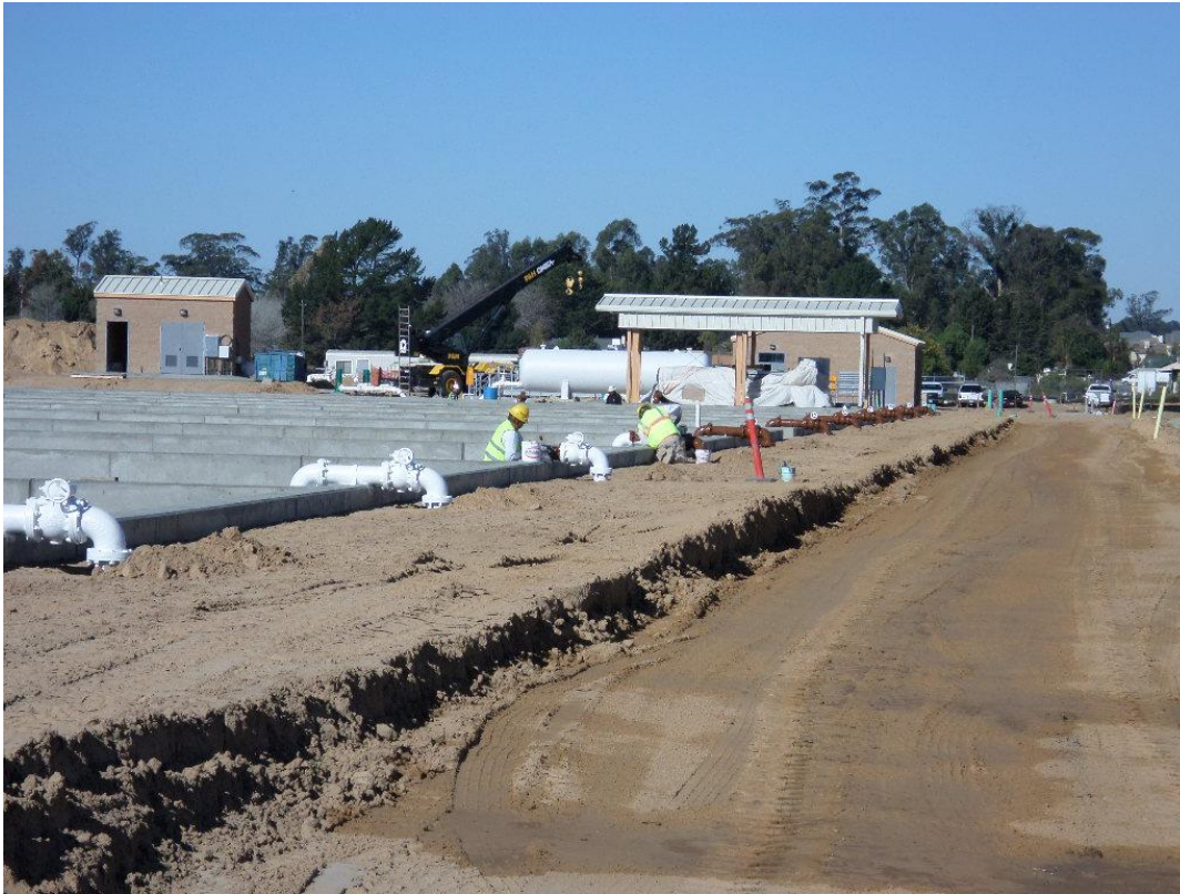
KNK Coating applying finish coat to the TWAS piping.