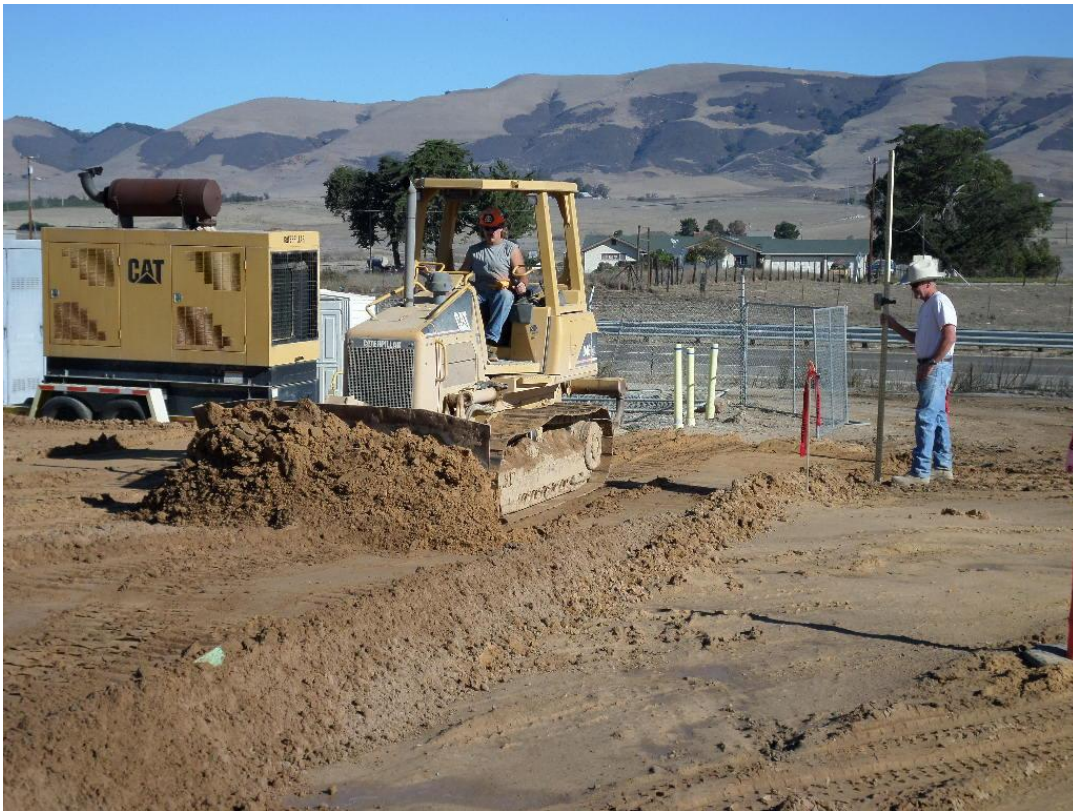
Cushman grading for the truck wash down station slab.