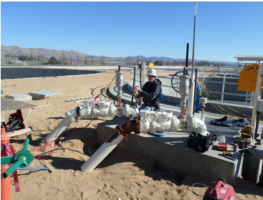
Bergelectric terminating wires at the pressure switches at RAS/WAS Pump Station #2.