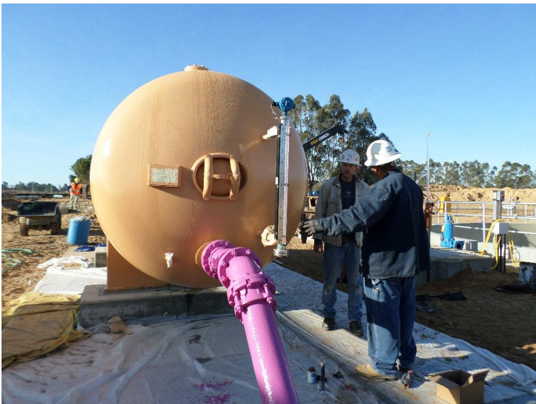
Bergelectric installing gauge and sensors at the Hydropneumatic Tank.