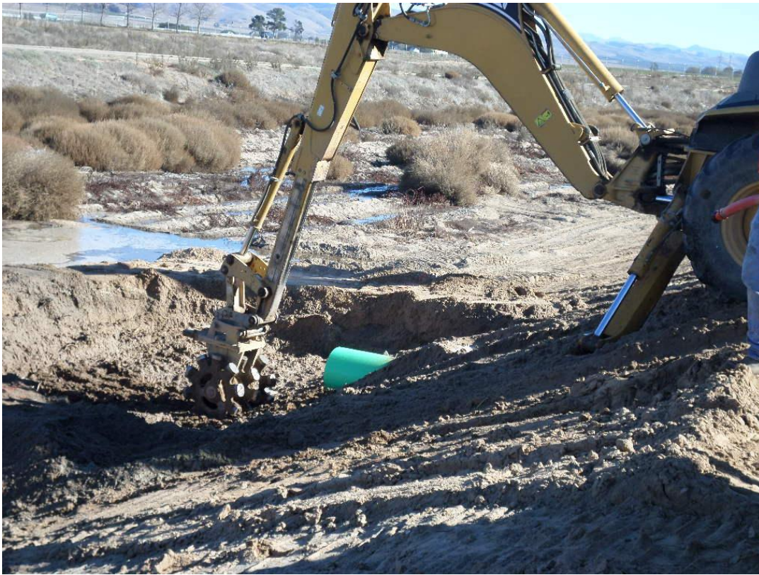
Compacting around inlet pipe at Infiltration Ponds.