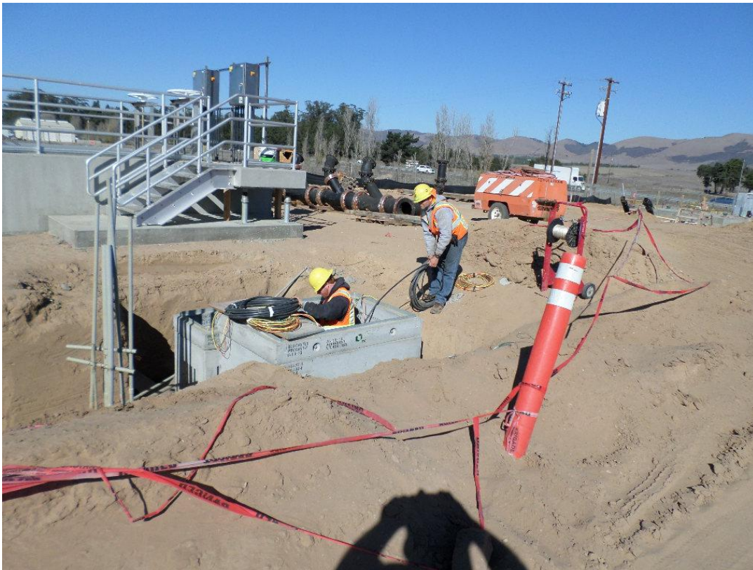
Bergelectric pulling wires to the Headworks.