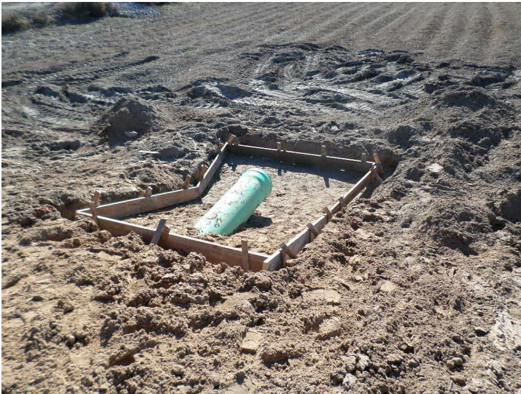
Forms in place for concrete splash pad at inlet structures.