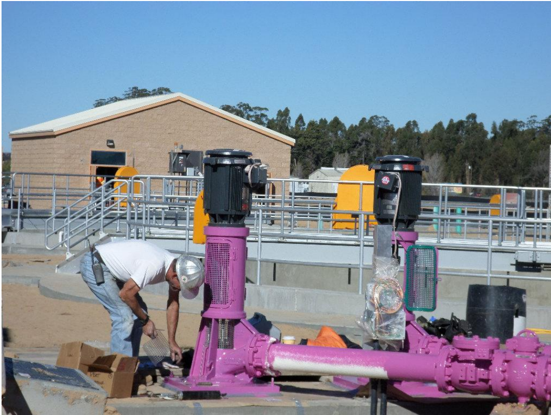
Cushman installing the Vertical Turbine Pumps.