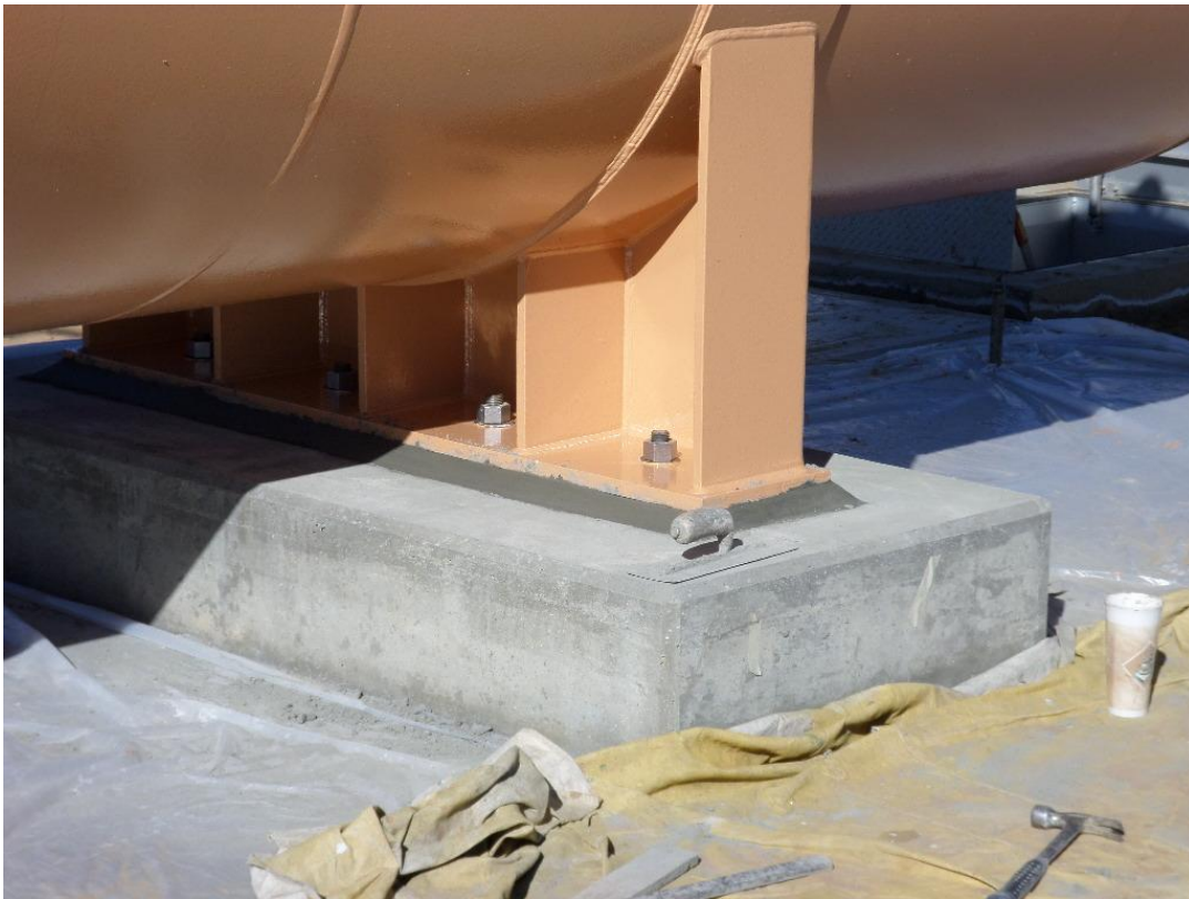
Dry packing installed at hydropneumatic tank supports.