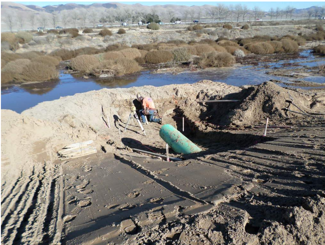
Laying out forms for inlet structures at Infiltration Ponds.