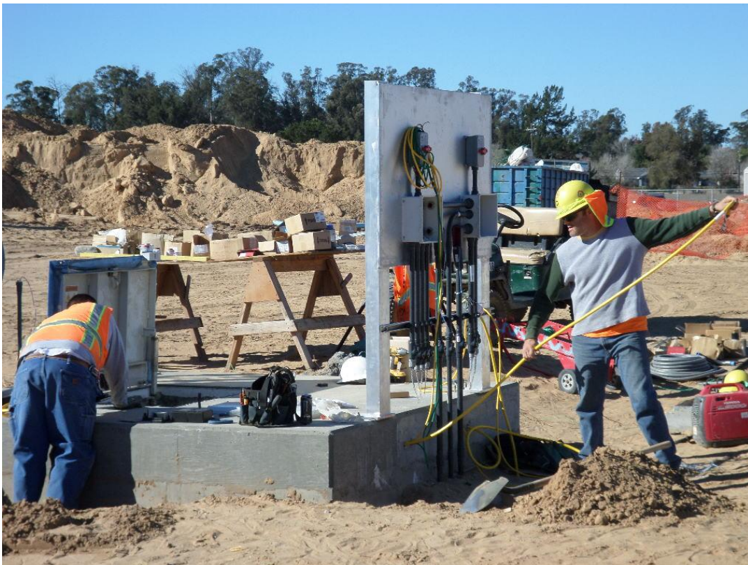
Bergelectric pulling leads to disconnect switches at the Scum Pump Station.