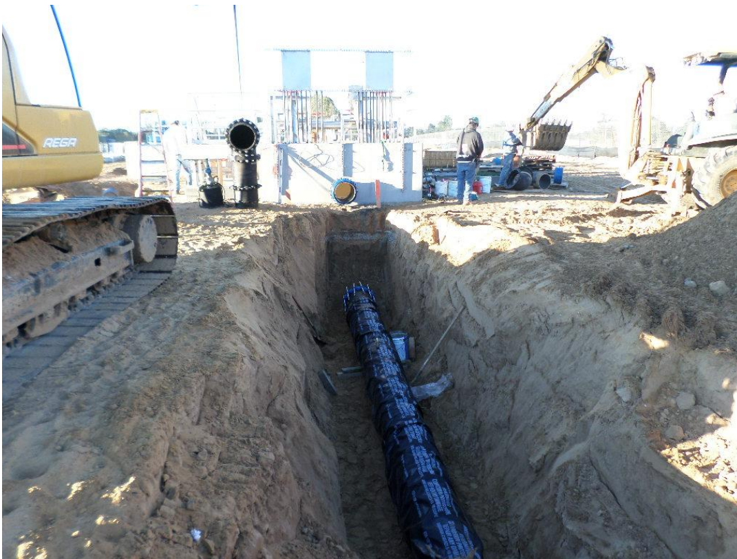
Installing the 16-inch RW from the Influent Pump Station to the Headworks.