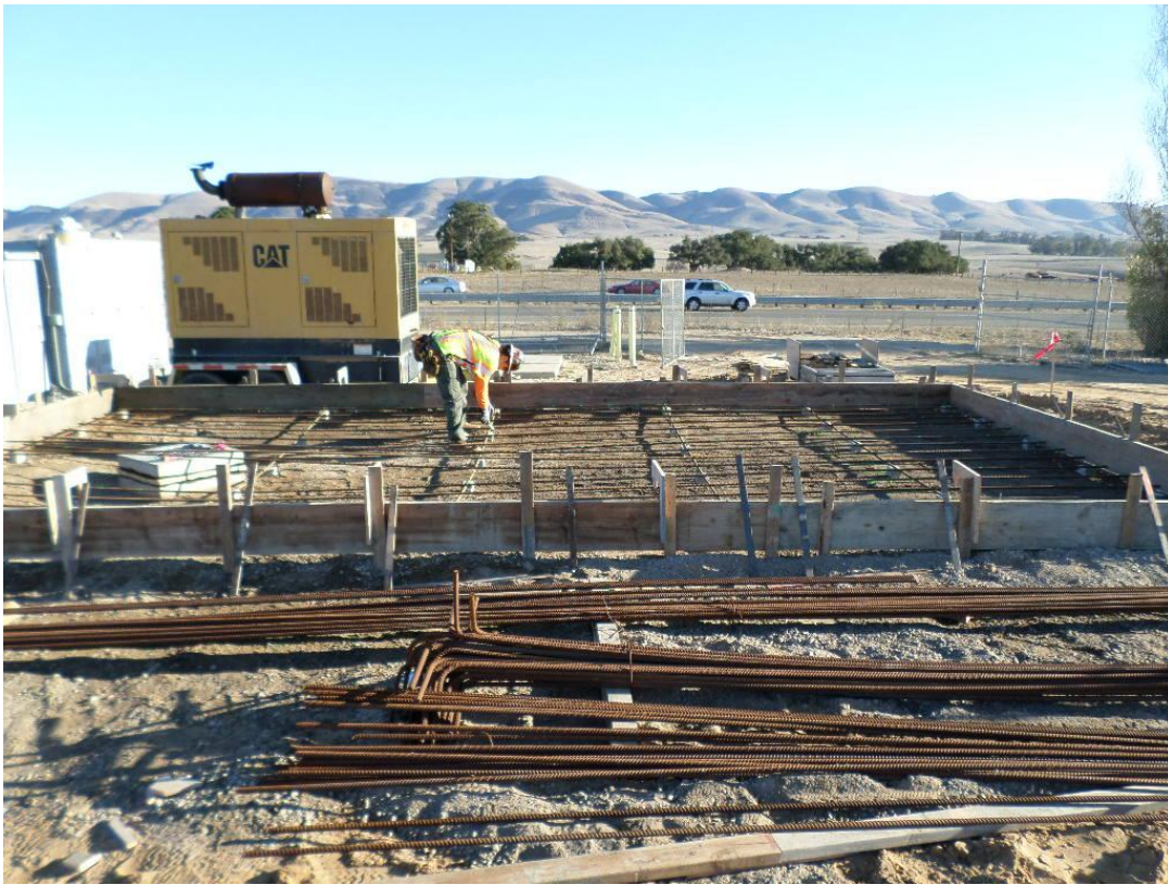
CMC Rebar tying reinforcing for the truck wash down station slab.