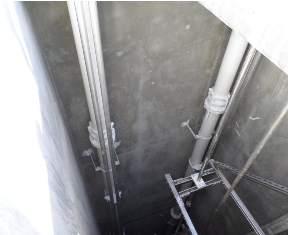
KNK Coating pipe inside RAS/WAS Pump Station #1.