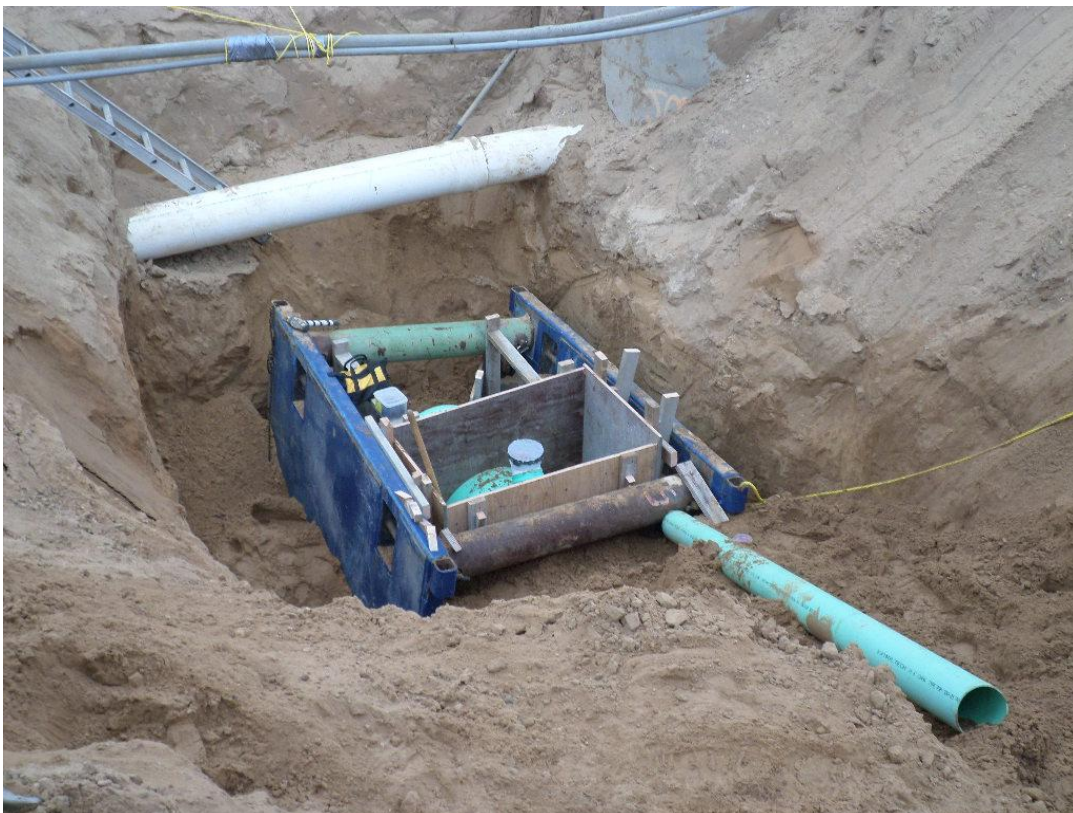
Cushman preparing to pour thrust block at cleanout on 24-inch SE2 pipe line.