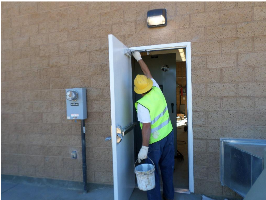
KNK Coating applying prime coat to the doors and trim.