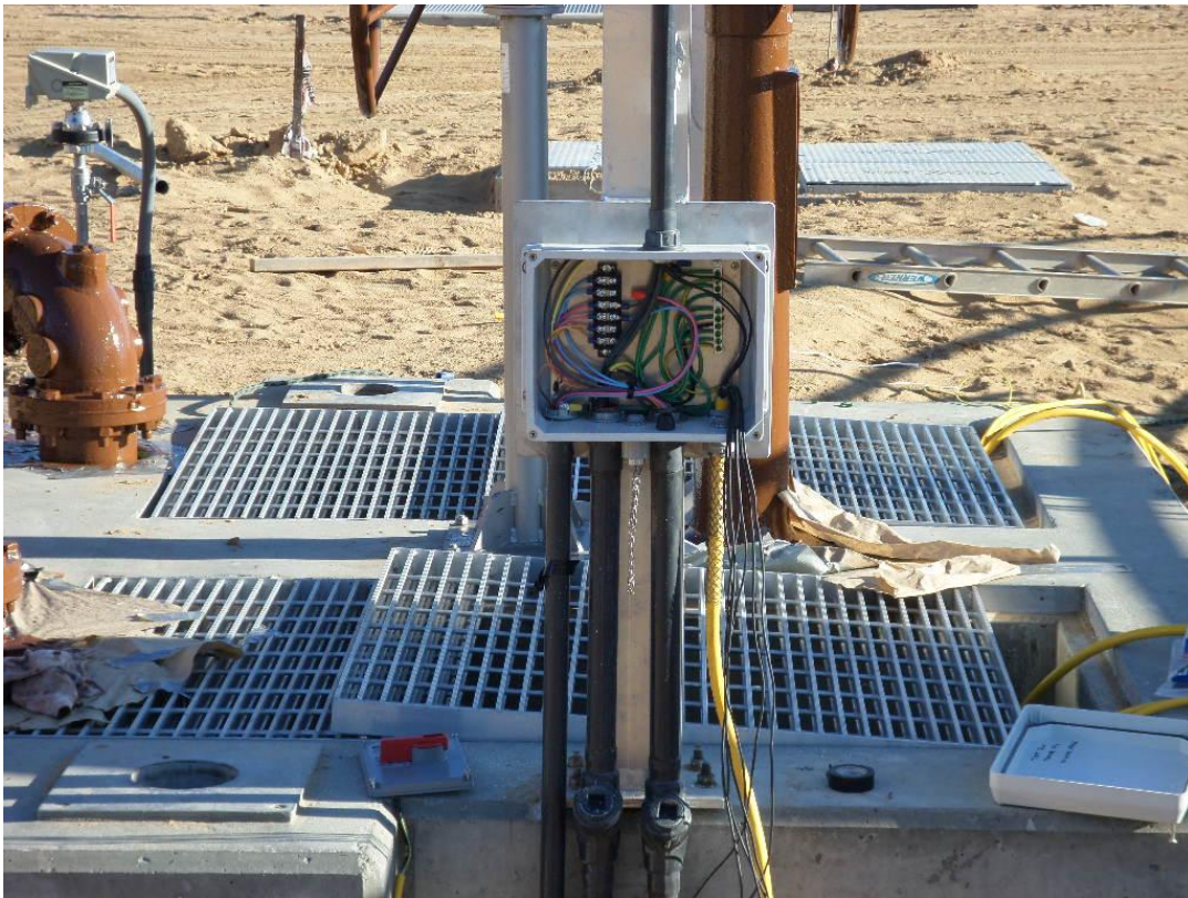
Bergelectric terminating leads at the RAS/WAS Pump Station #2.