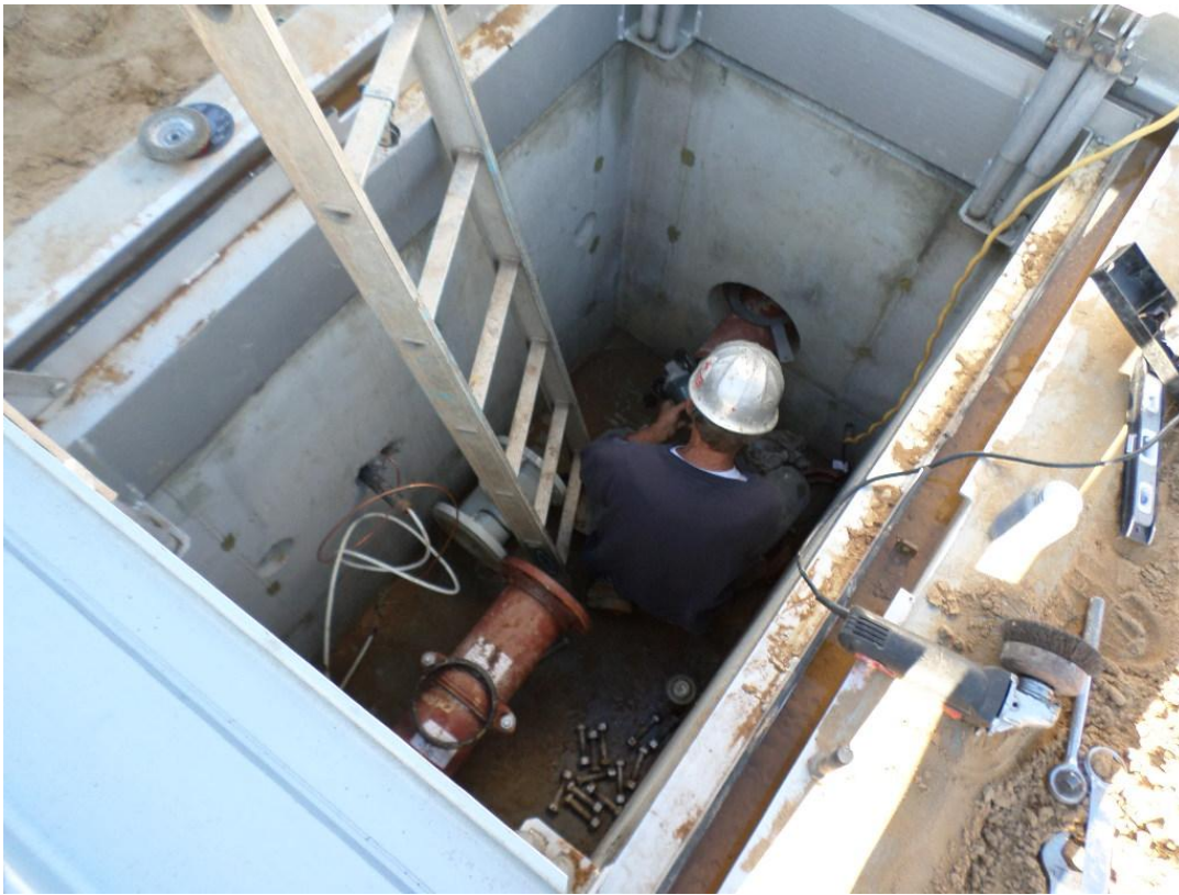
Cushman installing the flow meter in the WAS vault.