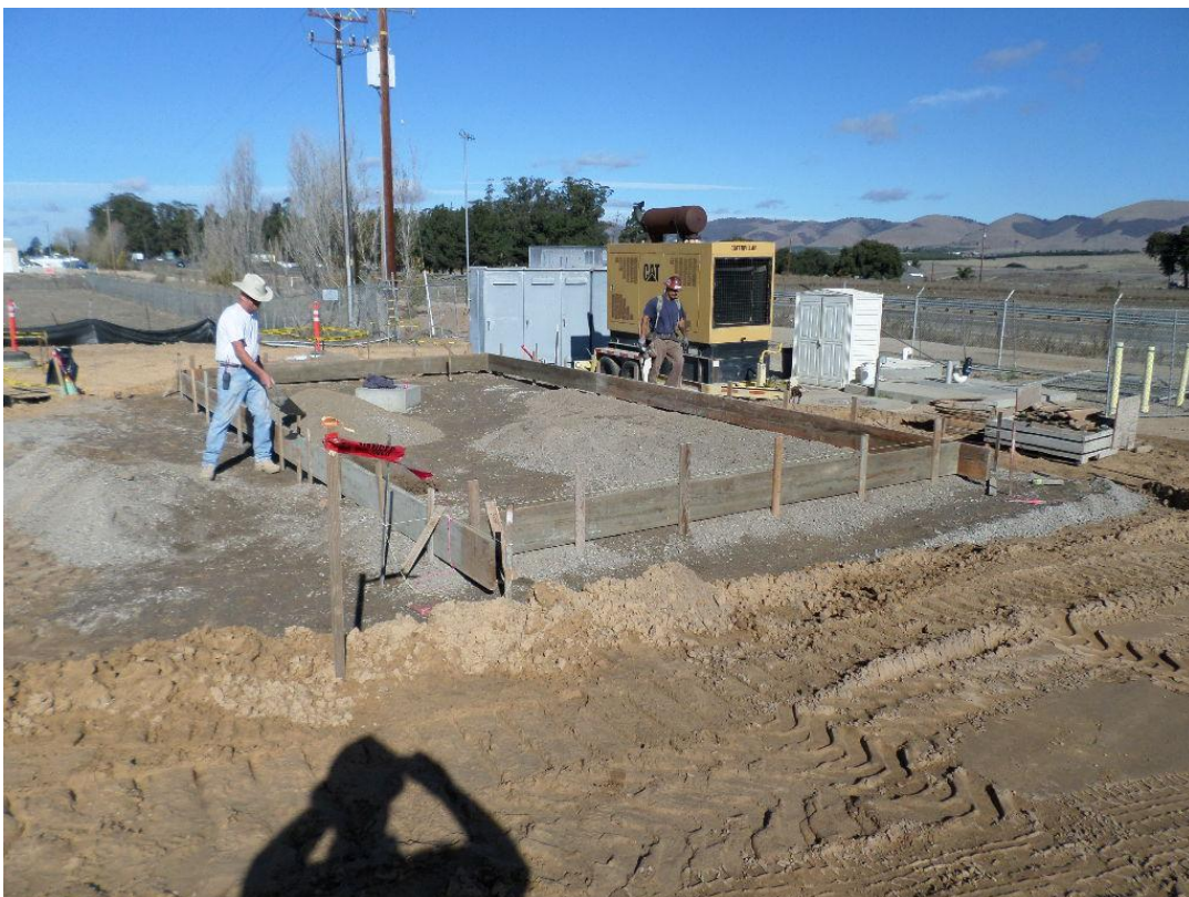
Cushman forming the truck wash down station slab.