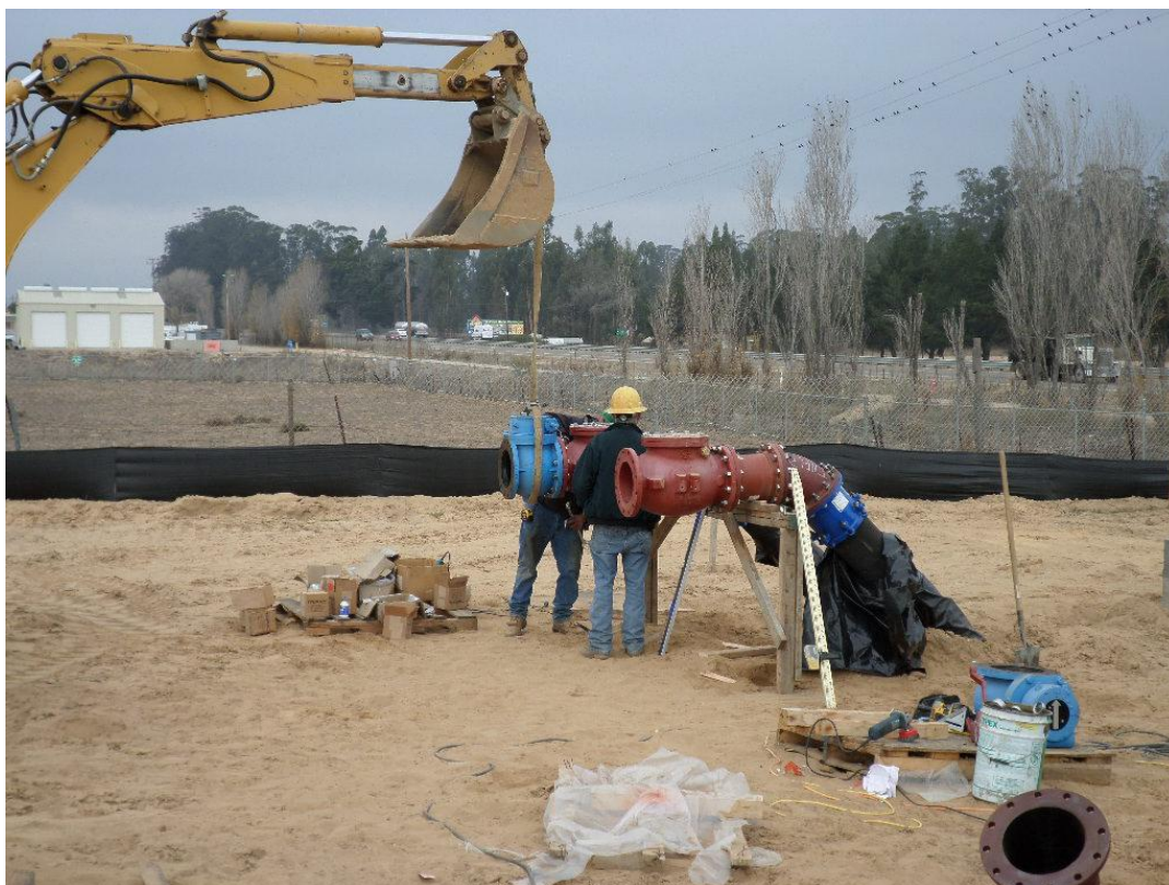
Cushman installing exposed 16-inch RW piping.