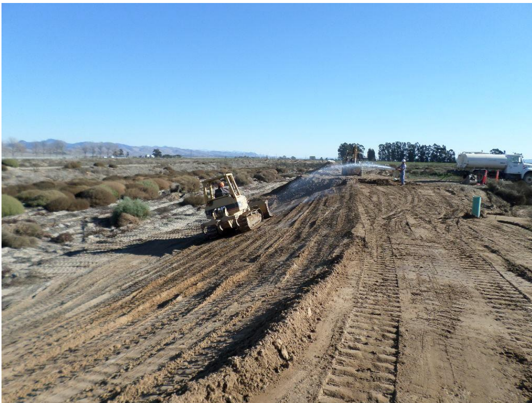
Grading at Pond #3 to rebuild pond sides after 24-inch SE2 pipe installation.