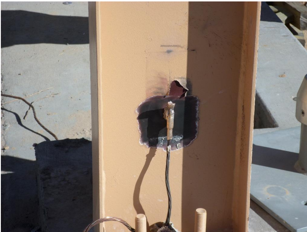
Bergelectric CAD welding the ground wire to the steel column at the Sludge Thickening Structure.