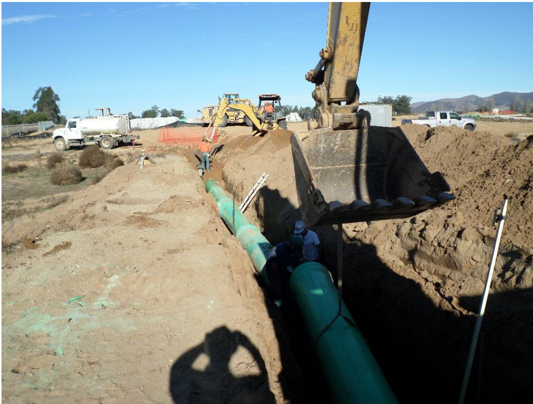
Cushman installing the 24-inch SE2 piping to the Infiltration Ponds.