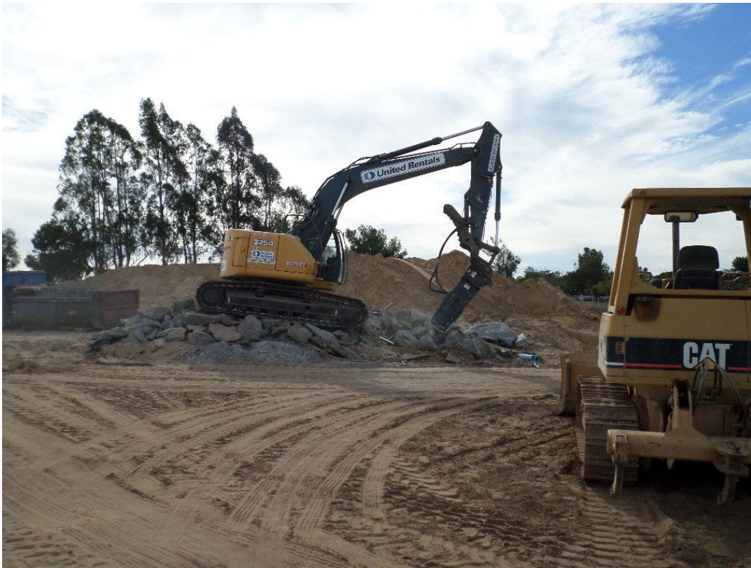
Breaking up concrete from inlet structures to prepare for disposal.