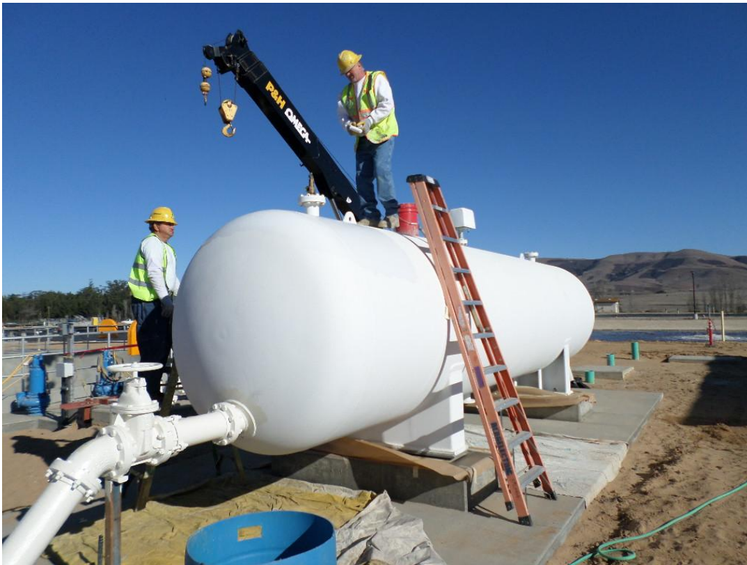
KNK Coatings applying Devoe 203 primer to the Hydropneumatic Tank.