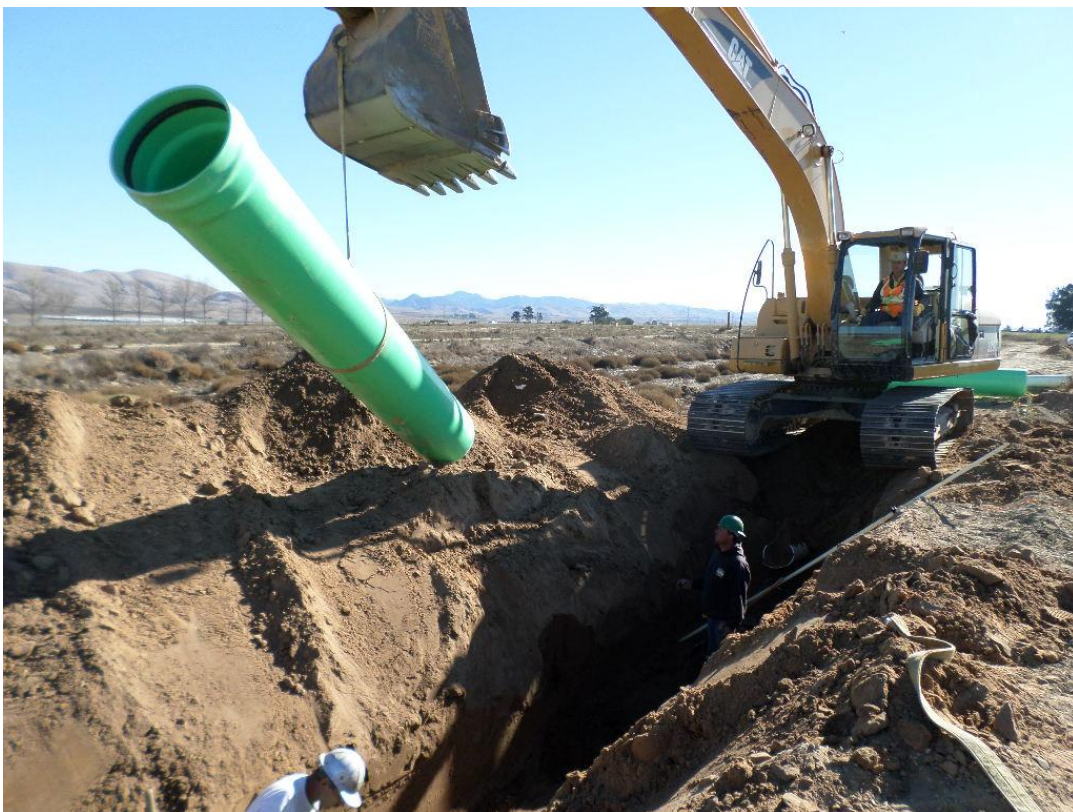
Cushman installing the 24-inch SE2 pipe to the Infiltration Ponds.