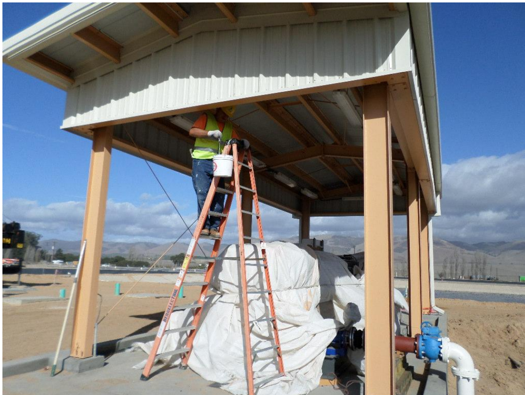
KNK Coating touching up coatings on Sludge Thickening Structure.