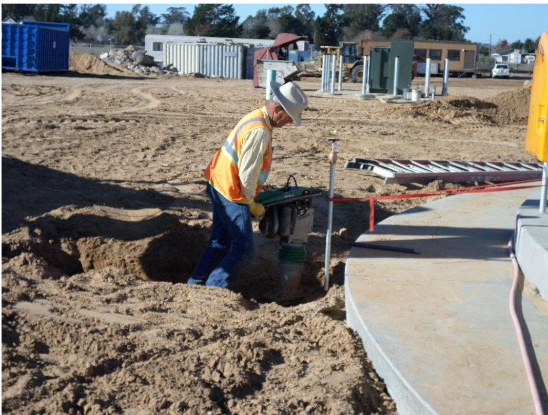
Cushman installing NPW and hose bibs at Clarifiers.