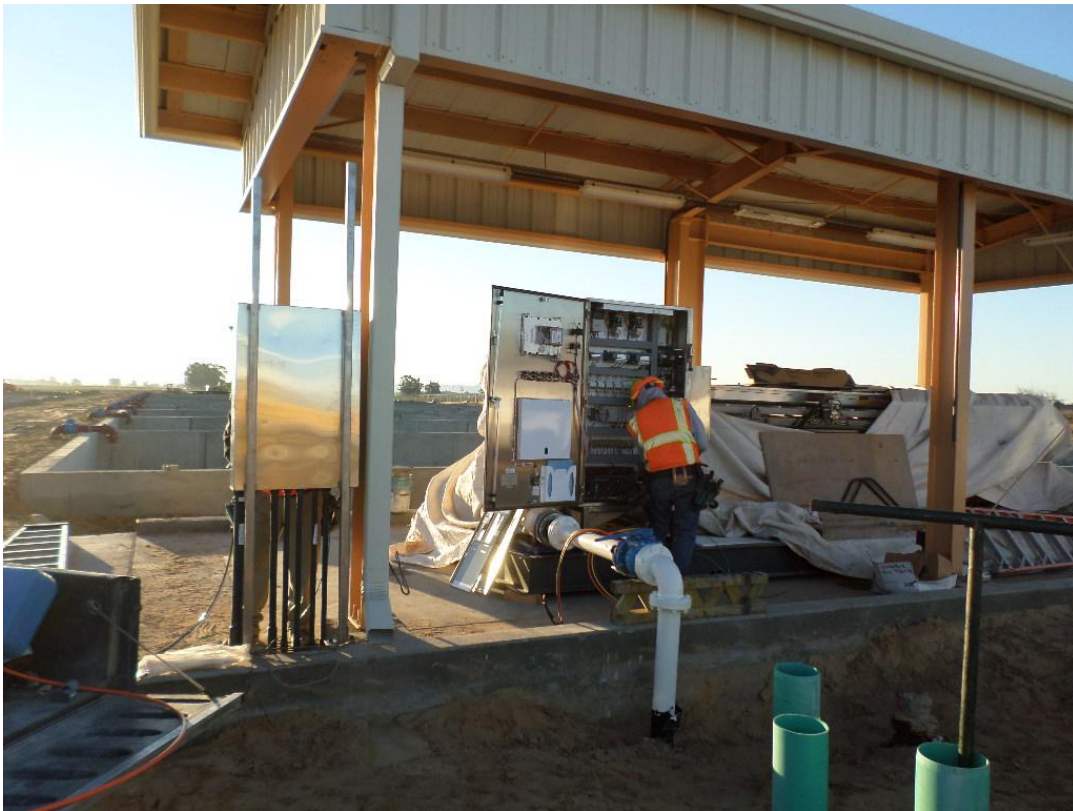
Bergelectric terminating power feed wire at the Sludge Thickening Structure.