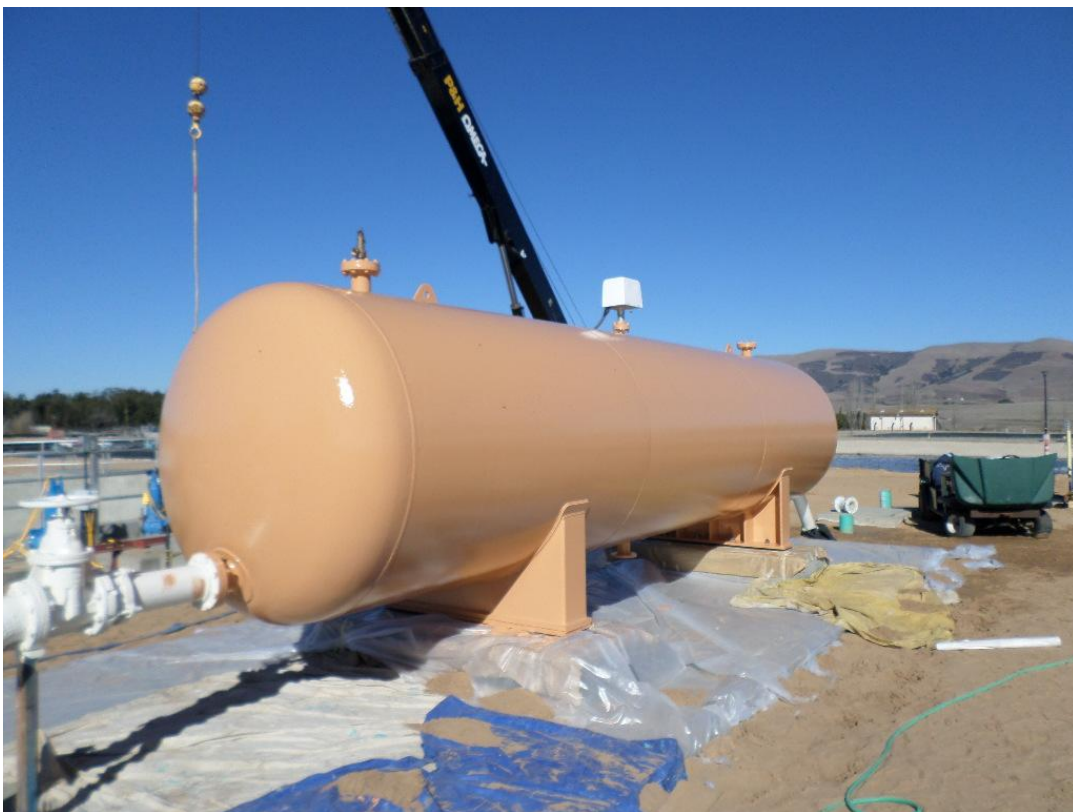
Finish coating applied by KNK Coating to the hydropneumatic tank.