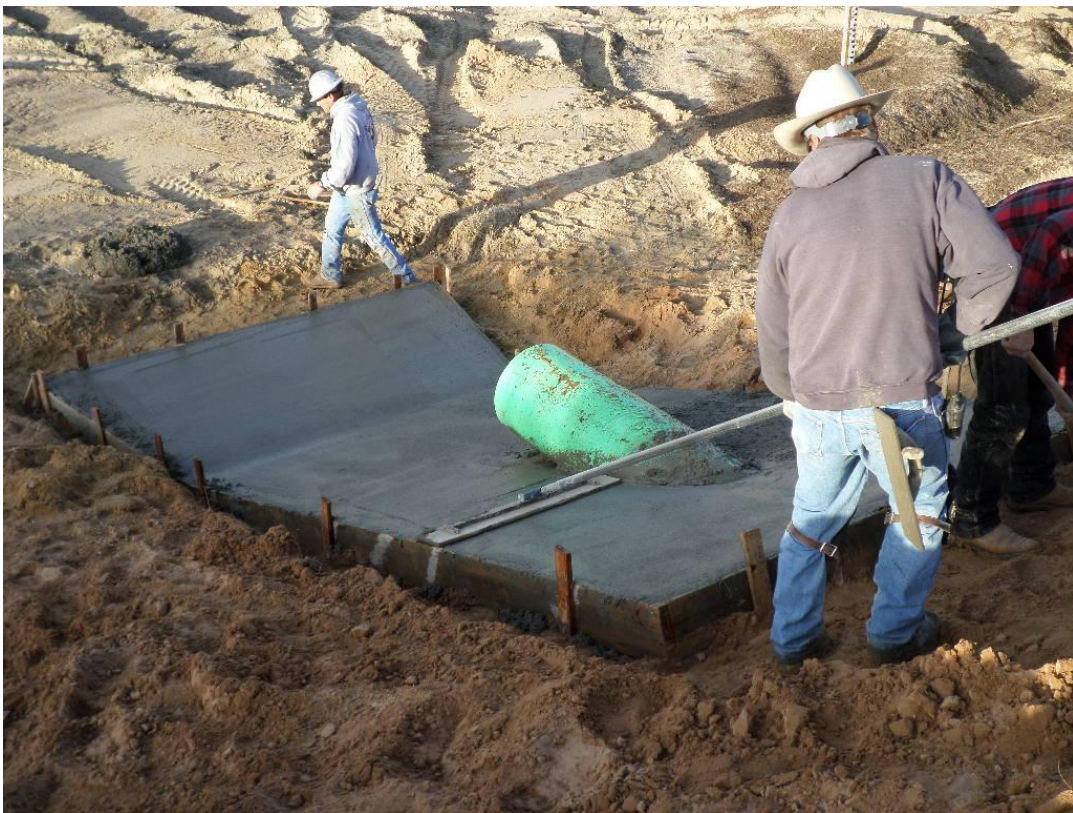
Finishing splash pads at inlet structures to Infiltration Ponds 4 thru 8.