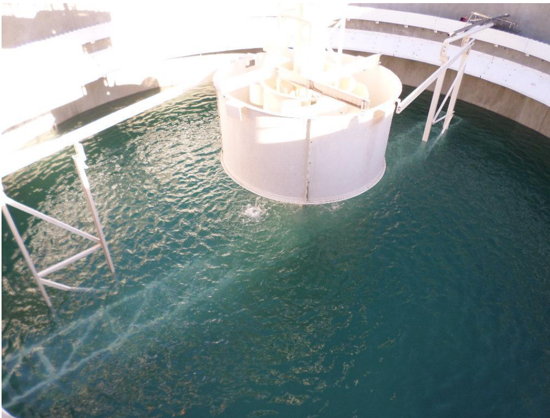
Filling Clarifier #1 for testing by transferring water from the Aeration Basin.