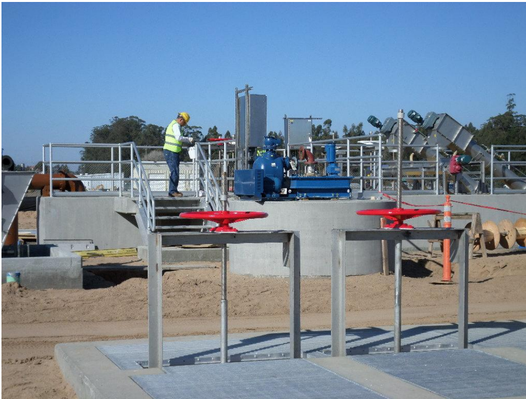
KNK Coating applying red coating to the actuators.