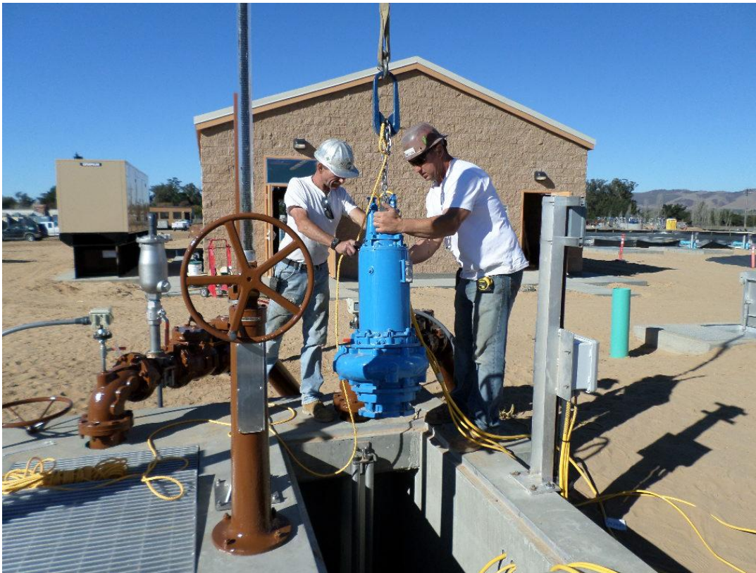
Cushman lowering pump back into place at the RAS/WAS Pump Station #2 after checking rotation.