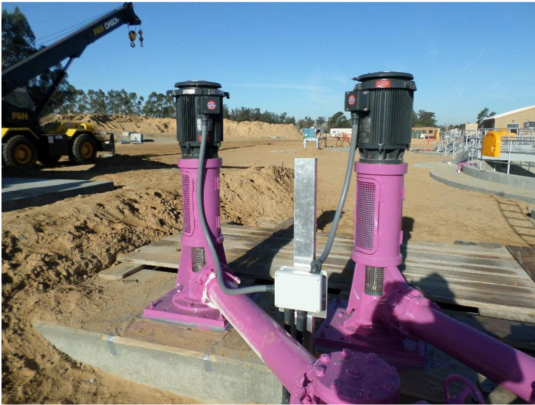
Bergelectric installing the flex conduit at the Vertical Turbine Pumps.