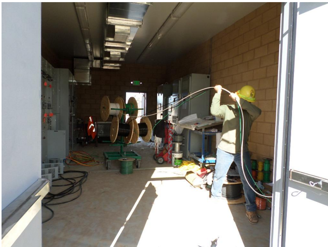
Bergelectric pulling wires in the MCC room.