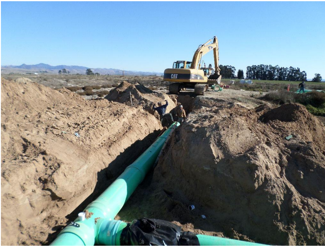
Cushman installing 24-inch SE2 piping.