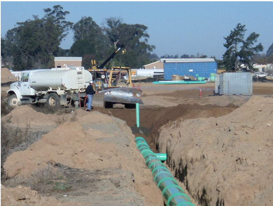
Cushman installing 24-inch SE2 piping and valves.