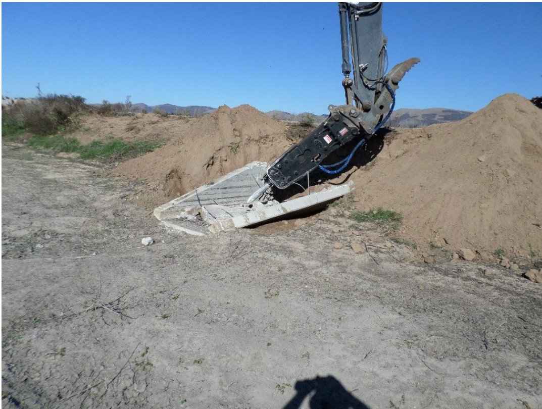
Breaking up existing concrete inlet structure at Infiltration Ponds 4 thru 8 for removal and replacement.