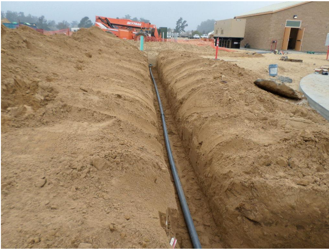
Installing the 3-inch NPW line.