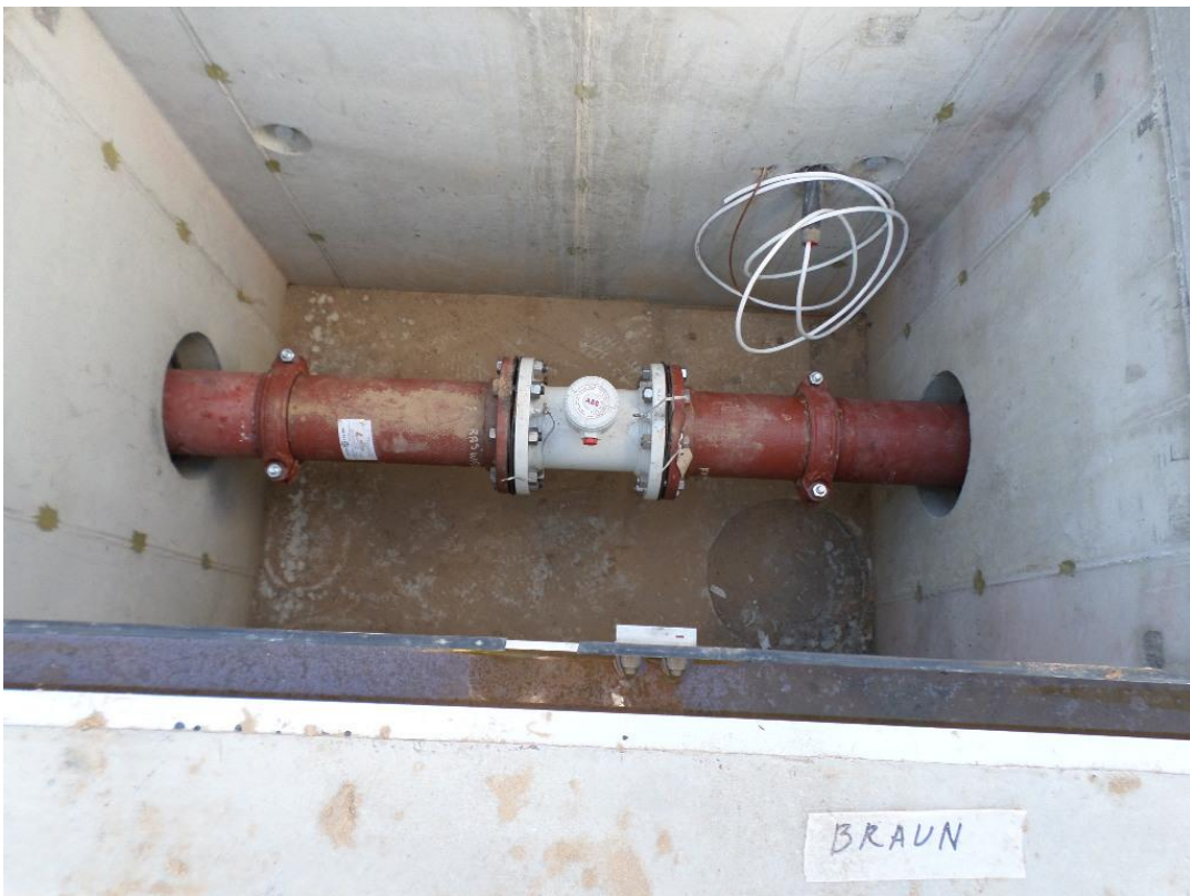
Flow meter installed in the RAS vault.