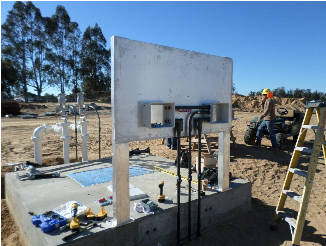
Bergelectric installing conduit and boxes on the rack at the Scum Pump Station.