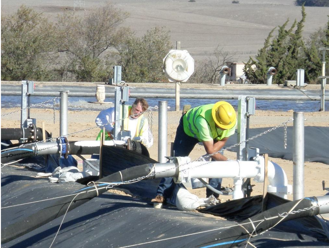
KNK Coating applying primer to the AR piping.