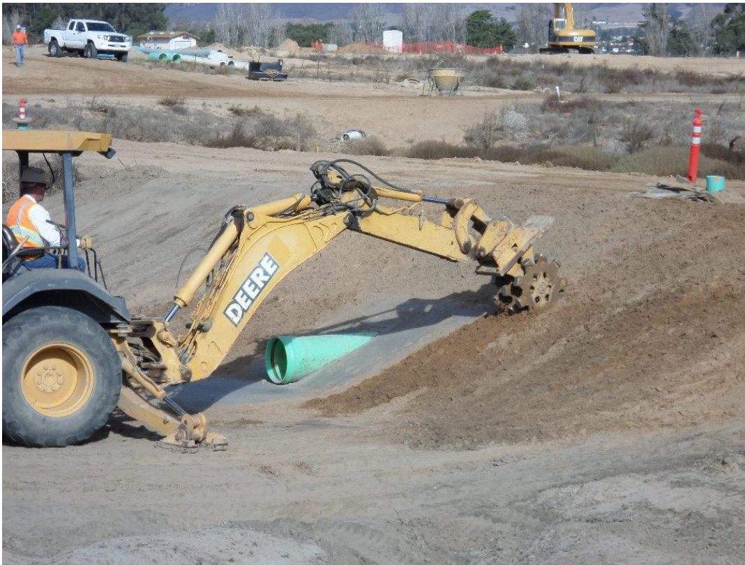
Cushman compacting material around new splash pads for inlets to Infiltration Basins 4 thru 8.