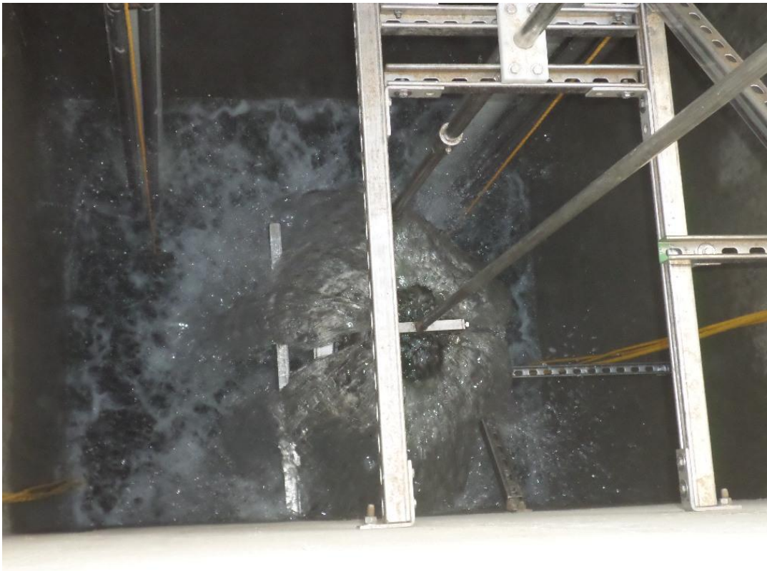
Cushman using telescopic valve to fill the RAS/WAS Pump Station.