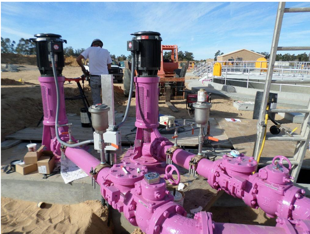
Cushman installing the air release valve and switch with gauge at the Vertical Turbine Pumps.