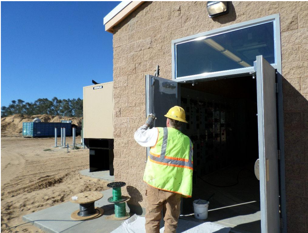
KNK Coating abrading and applying prime coat to the doors and trim.