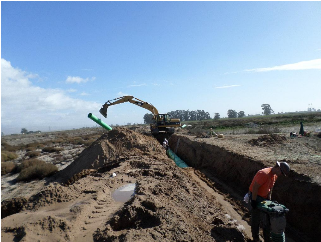
Cushman installing and backfilling the 24-inch SE2 piping to the Infiltration Ponds.