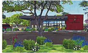
SANTA MARIA WISDOM CENTER Construction has started on the Santa Maria Wisdom Center at 2255 Depot St. The facility will provide comprehensive adult day health care services to elderly and medically frail adults in Santa Barbara and San Luis Obispo counties.

For more information, call Life Steps Foundation at 354-5320 or visit www.lifestepsfoundation.org .