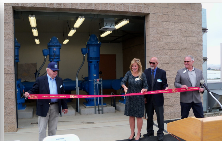
Ribbon Cutting Ceremony May 24, 2017