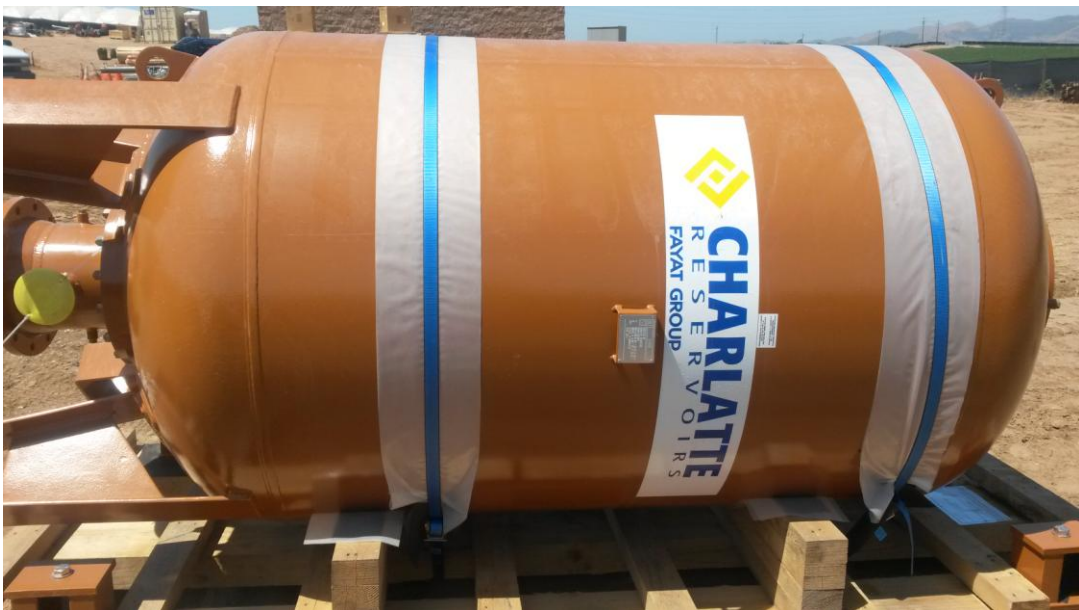
Surge tank delivered to pump station site.