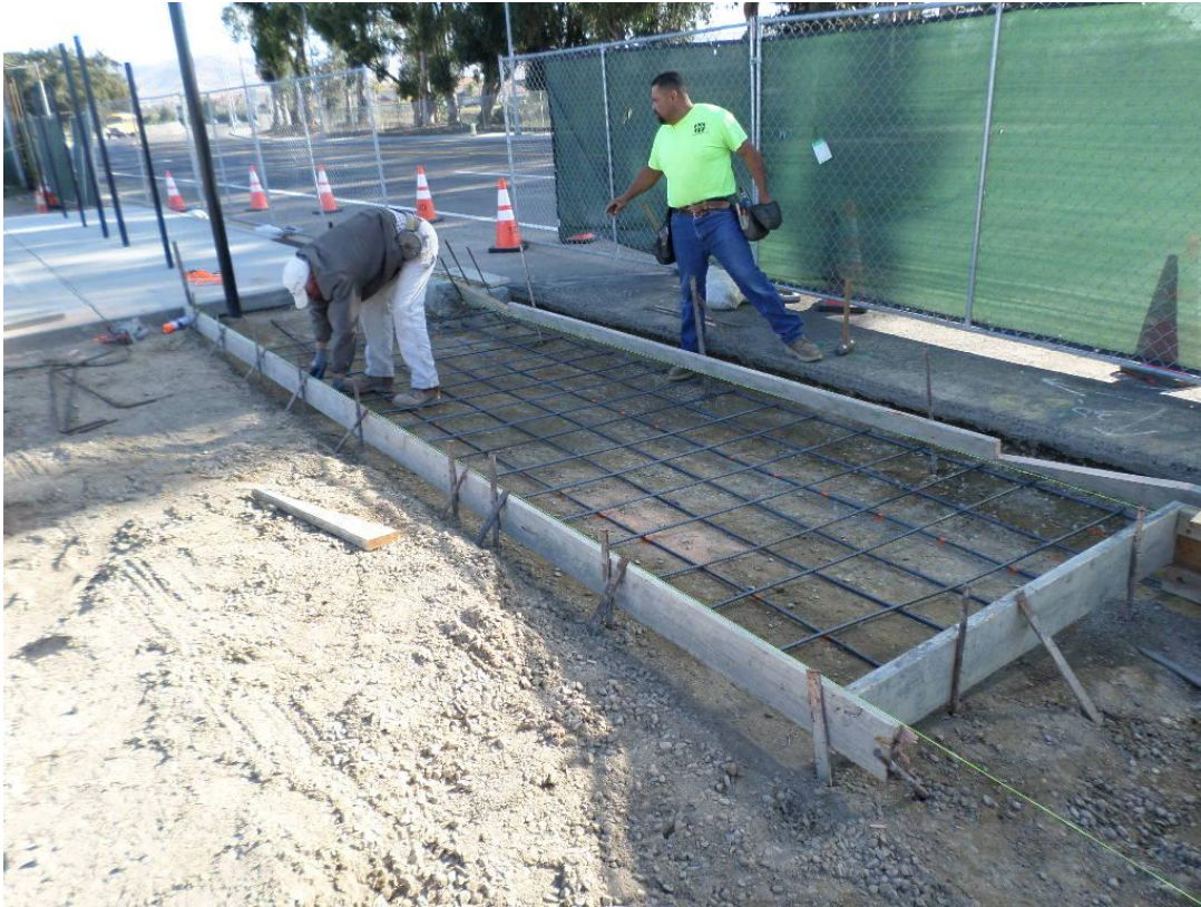
Spiess forming driveway approach.