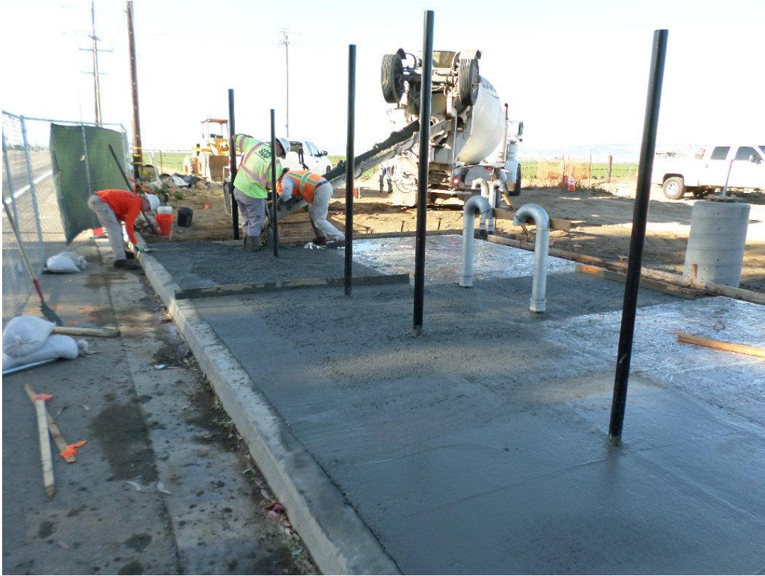
Spieß pouring concrete around vaults.