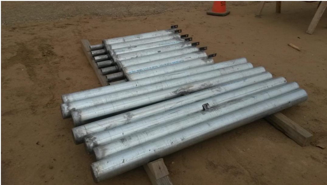
Removable bollards fabricated and delivered to pump station site.