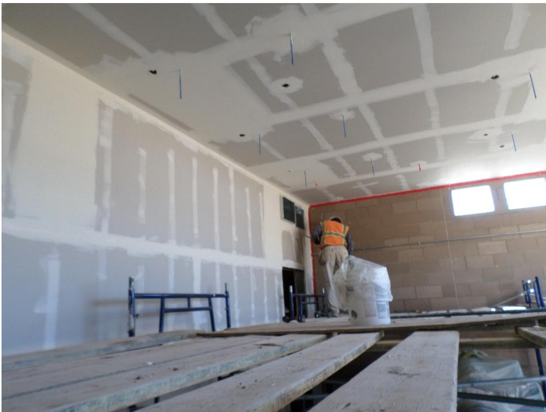
Ely Dodson Construction applying topping to sheet rock at pump station building.