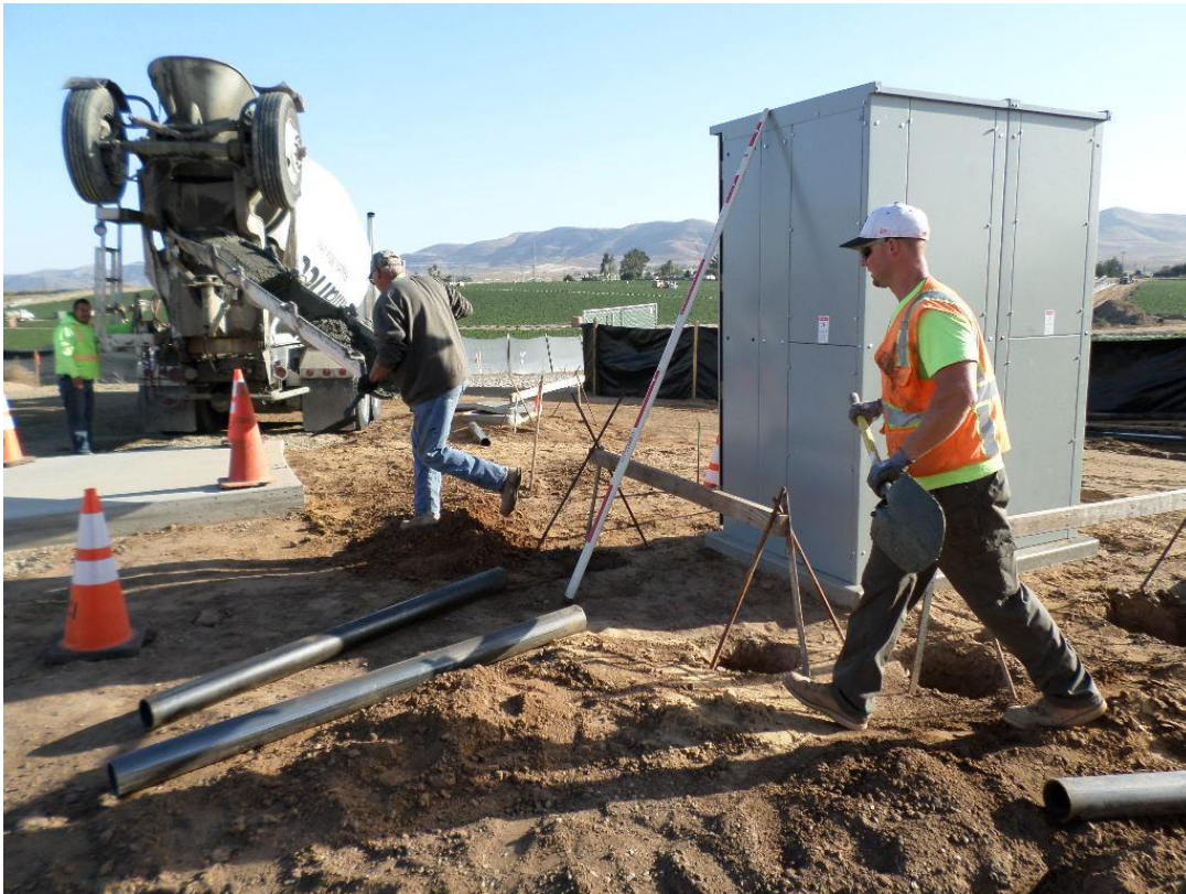
Spies pouring bases for stationary bollards at pump station site.