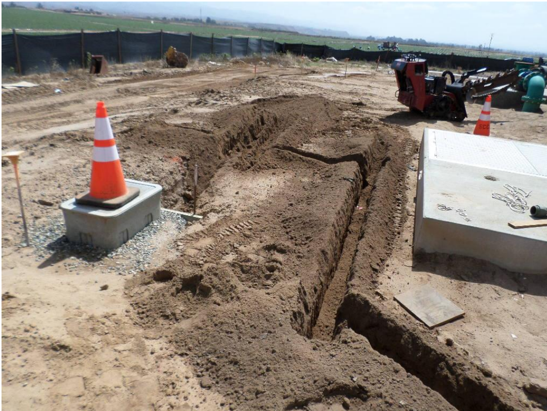
A.H. Ratterree installing landscape conduit.