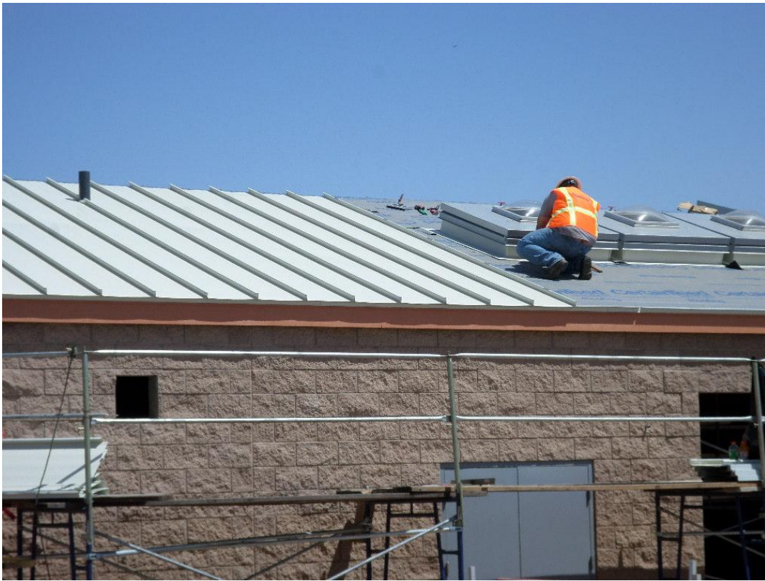
Quaglino Roofing installing seamless metal roof on pump station building.