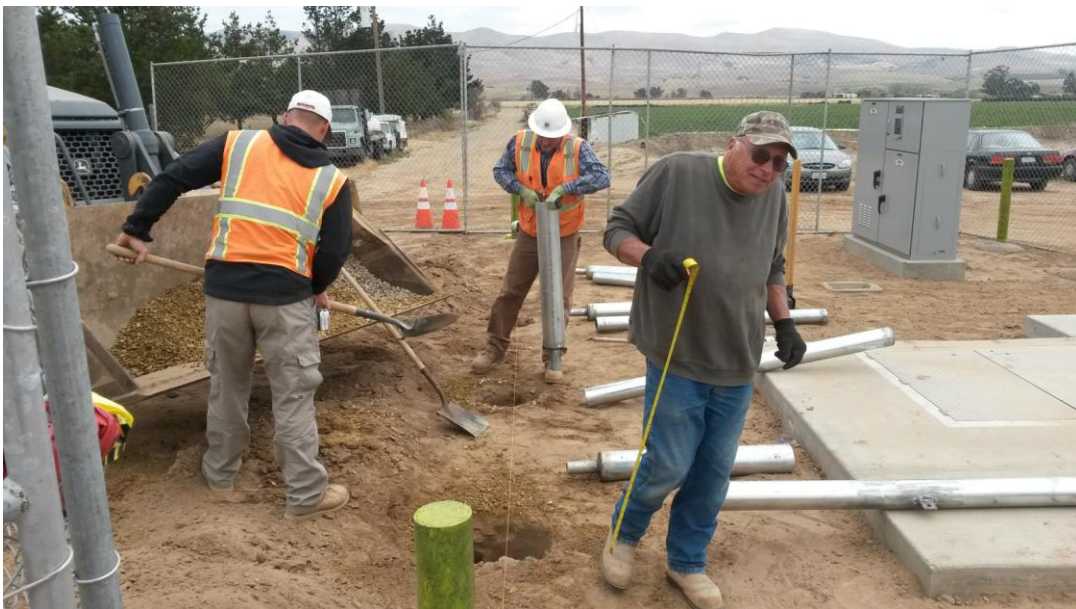
Spies setting removable bollards at PRV vault.