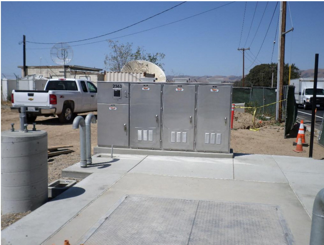
Electrical panels installed.