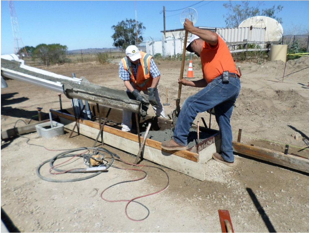
Spies pouring concrete for the electrical panel pad.