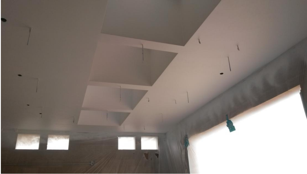
Coast Painting coating pump room ceiling.