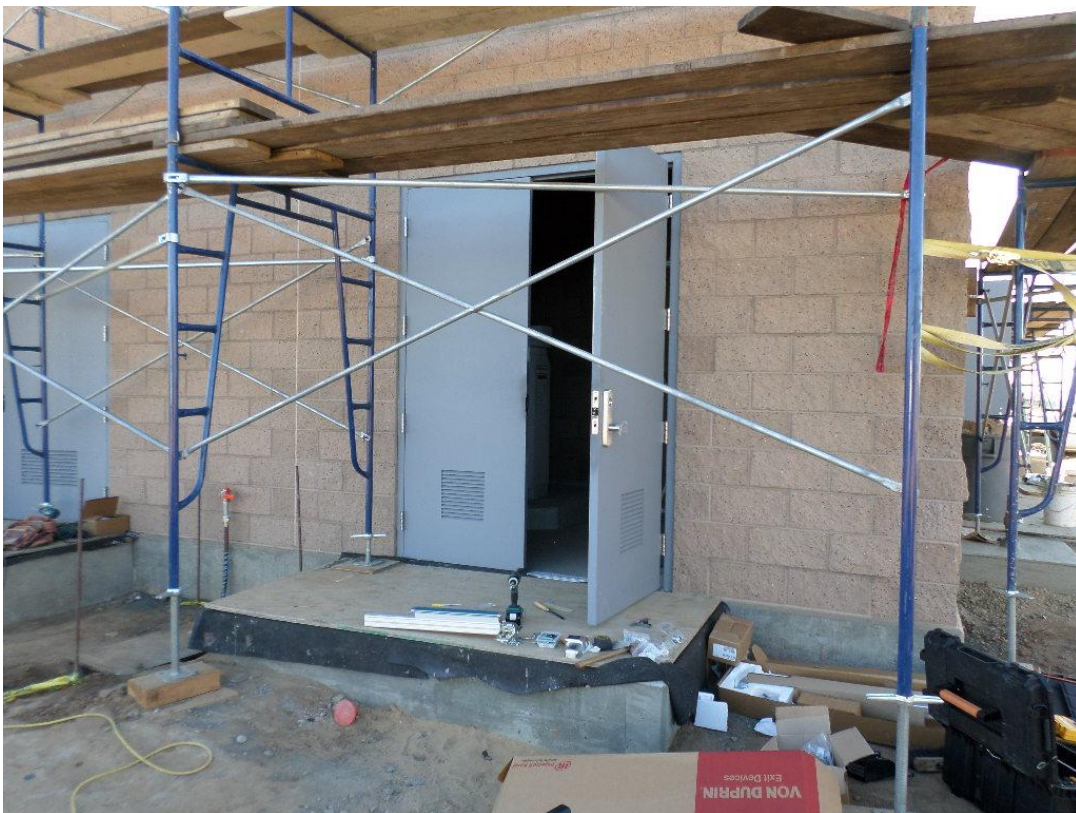
Martin Doors installing metal doors at pump station building.