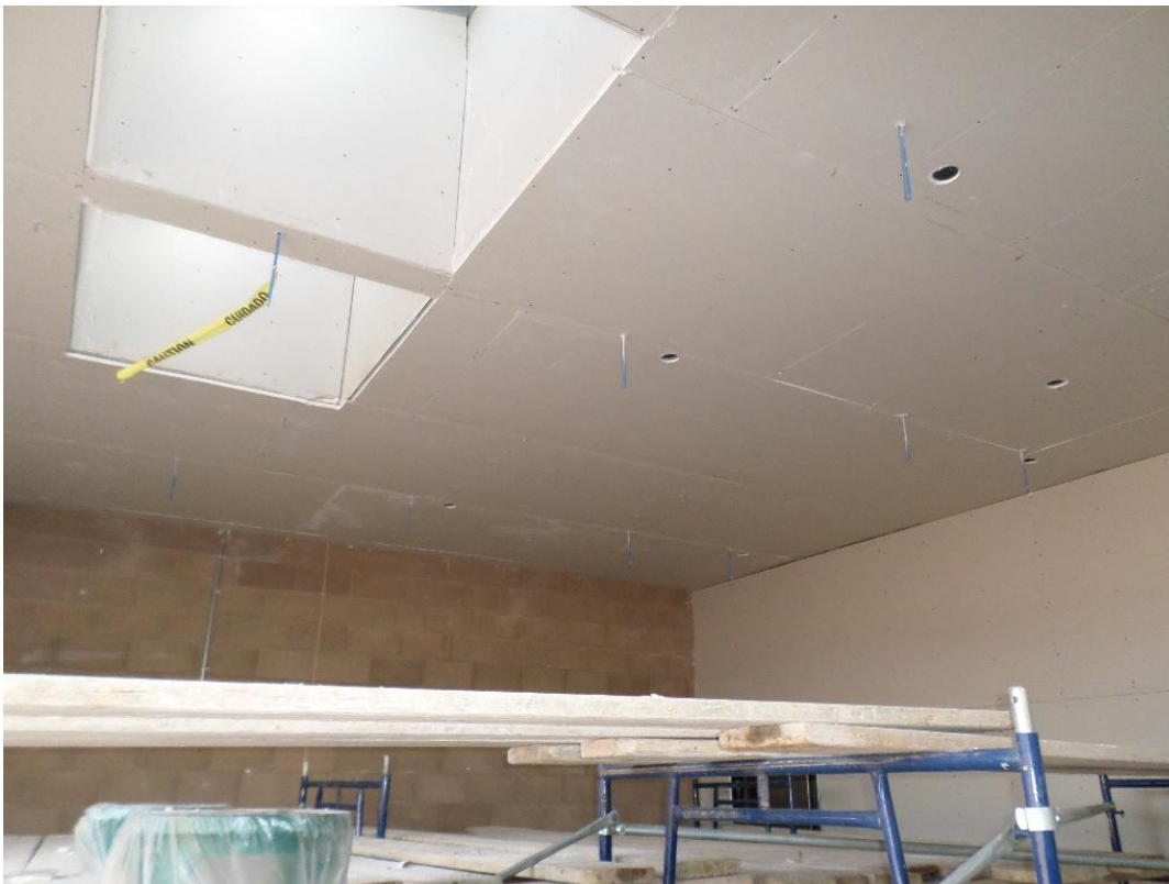
Ely Dodson Construction installing sheet rock inside pump station building.