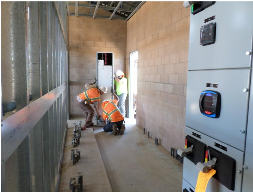
Spiess and St. Denis Electric staging electrical equipment inside pump station building.