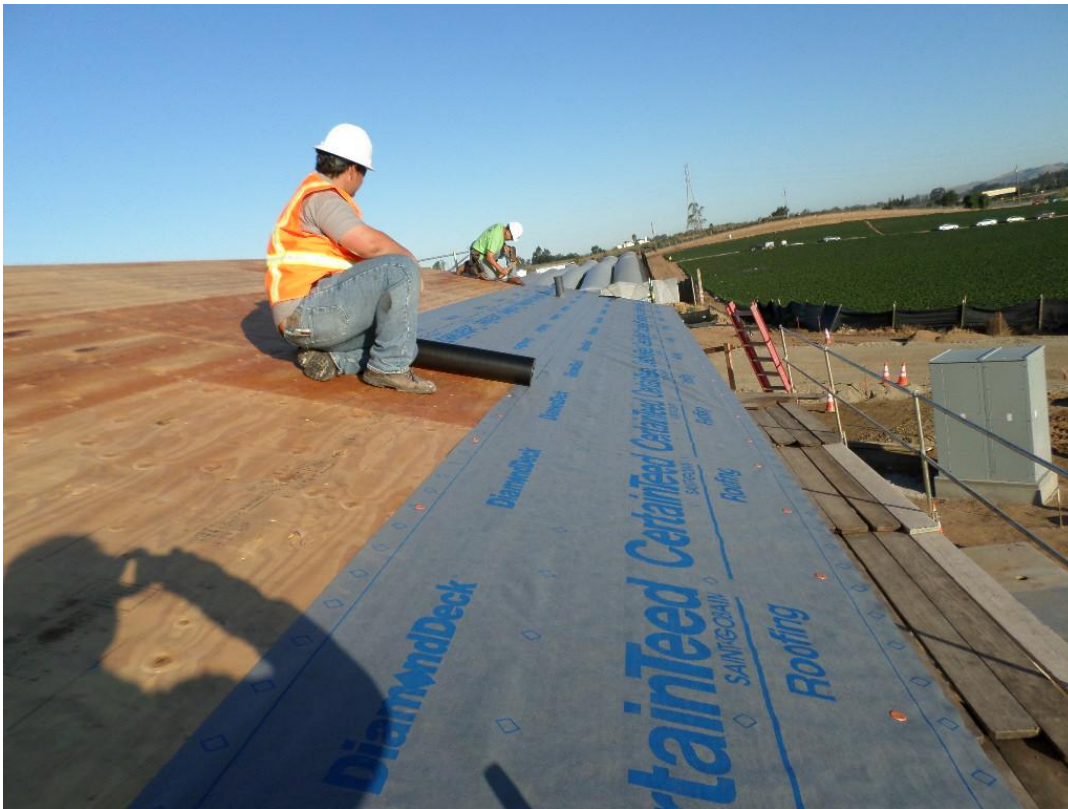
Quaglino Roofing installing moisture barrier on pump station building roof.