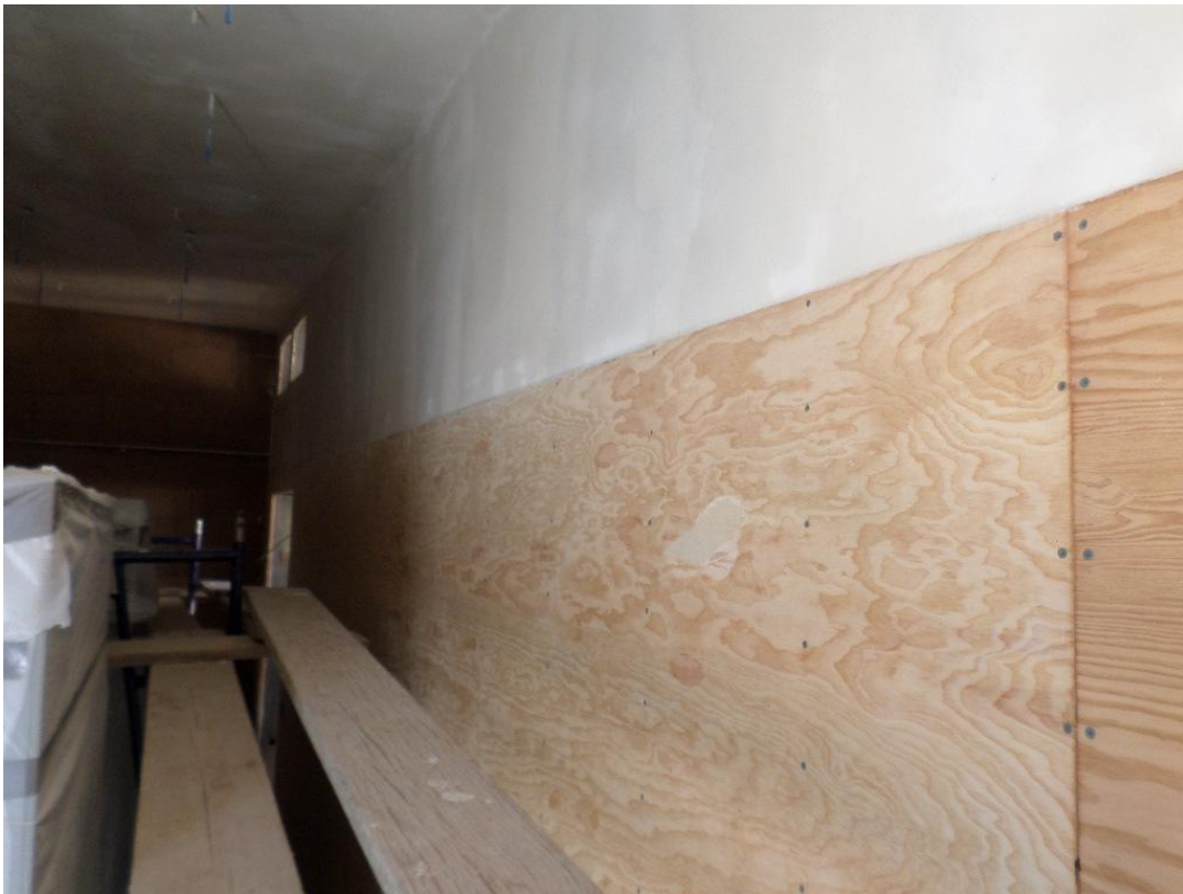
Ely Dodson Construction installing plywood on wall between pump room and electrical room.