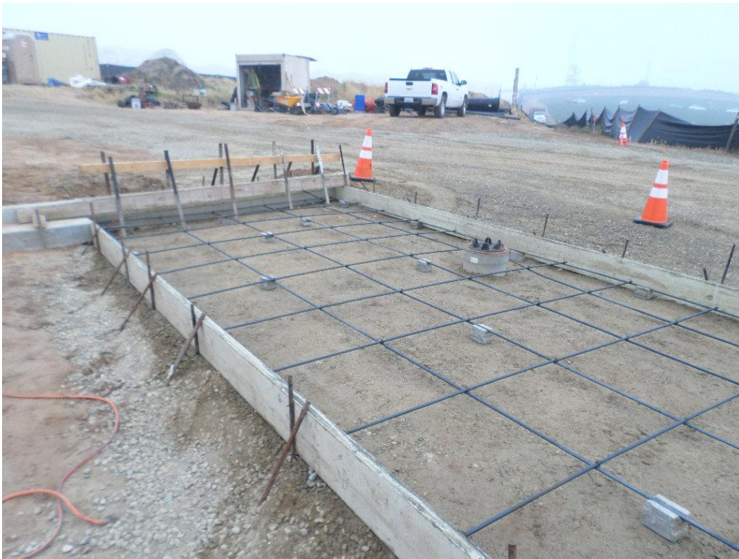
Reinforcing installed for driveway approach.