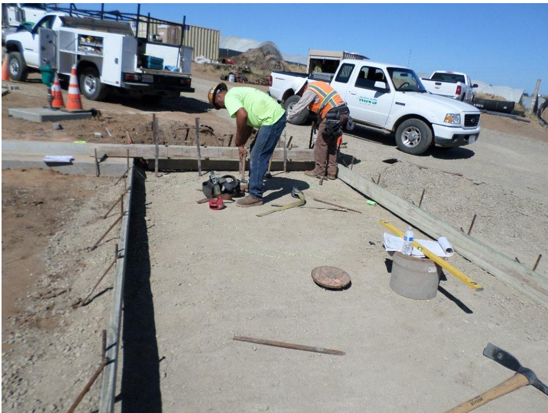
Spieß forming driveway approach at pump station.