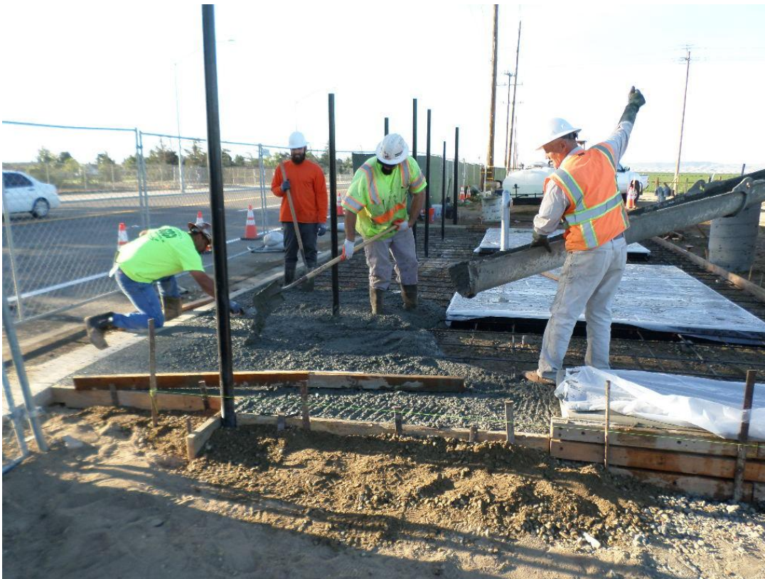
Spiess pouring sidewalk and concrete around vaults.