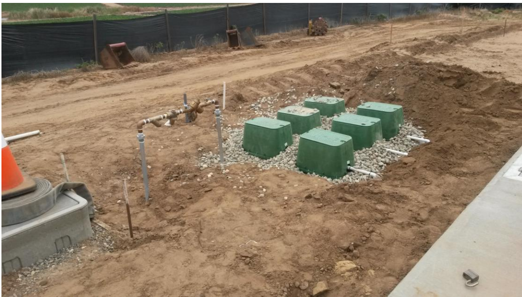
Controllers and meters installed for landscaping at pump station site.