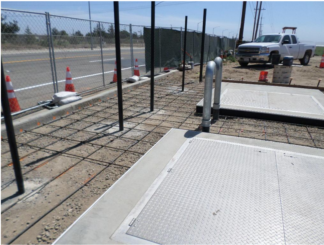
Spiess forming and installing reinforcing for sidewalk and concrete around vaults.