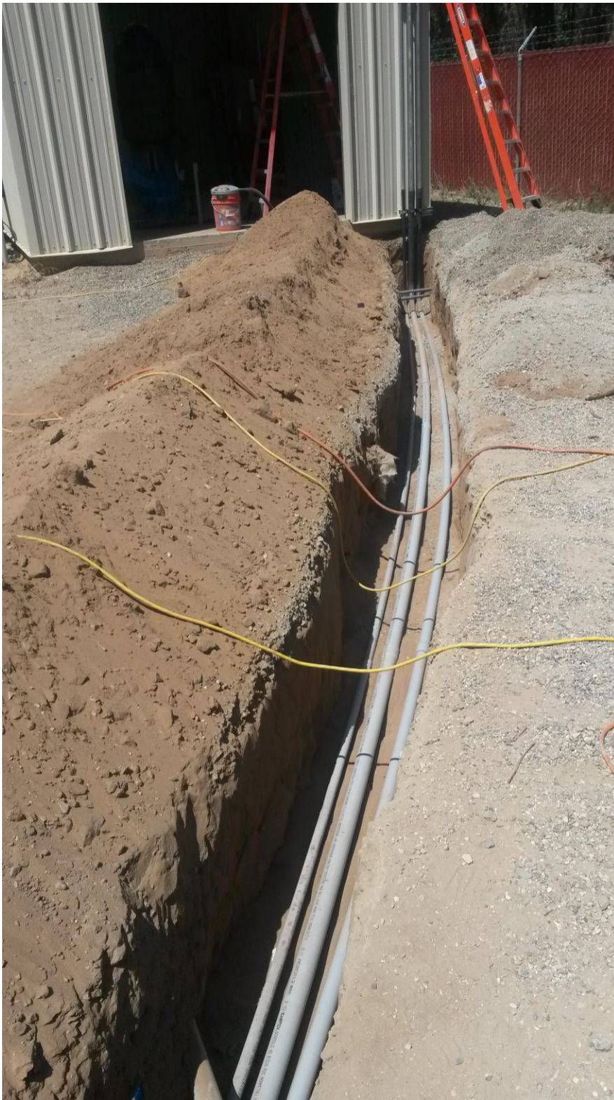
St. Denis Electric installing underground conduit from existing building to new chemical building.