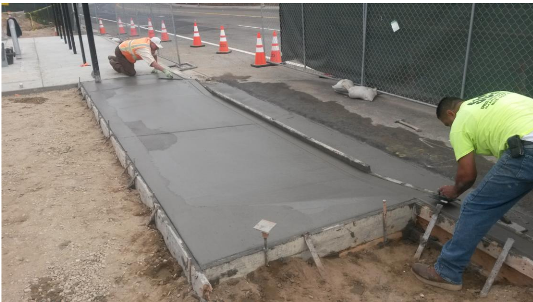
Spiess finishing concrete for driveway approach.