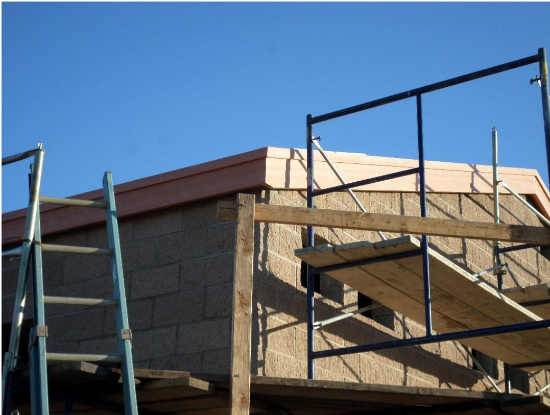
Coast Painting coating the pump station building fascia.