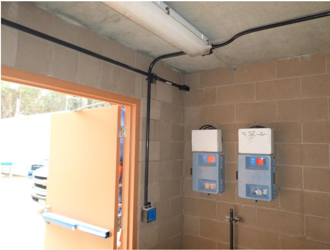
St. Denis Electric installing conduit and receptacles in chemical building.