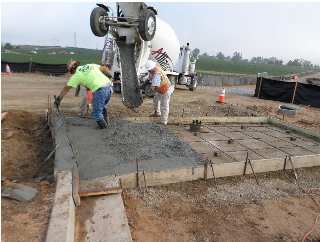
Spies pouring concrete for driveway approach.