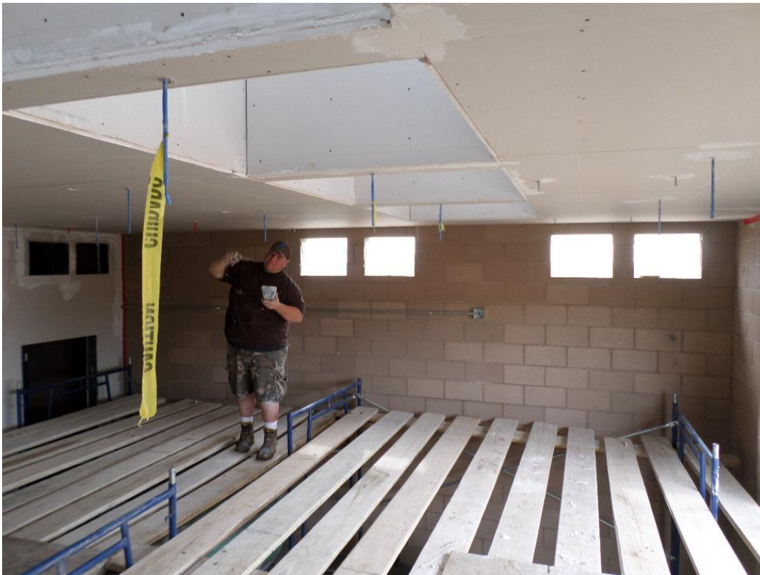
Ely Dodson Construction installing sheet rock inside pump station.