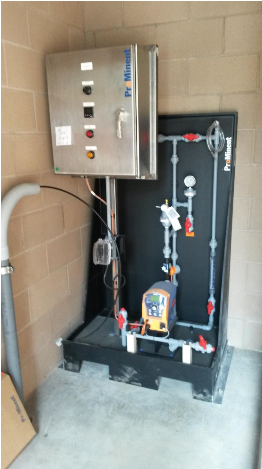
Chemical metering skid installed.