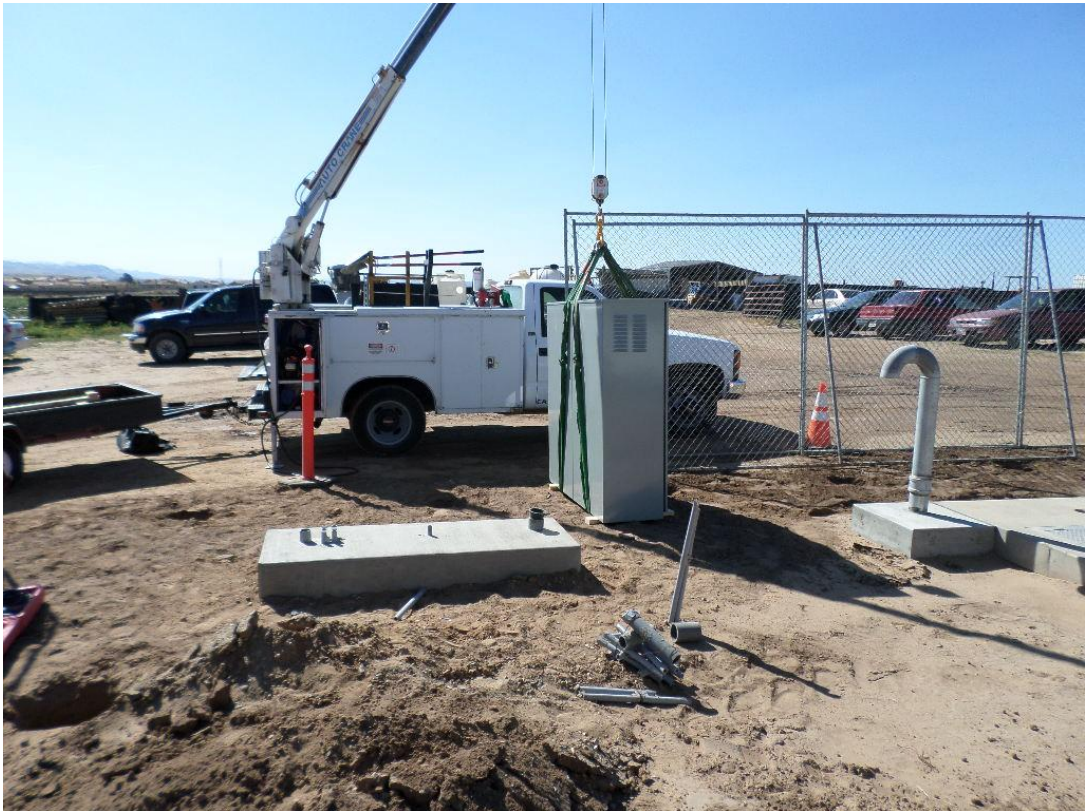
St. Denis Electric installing PLC at PRV vault.