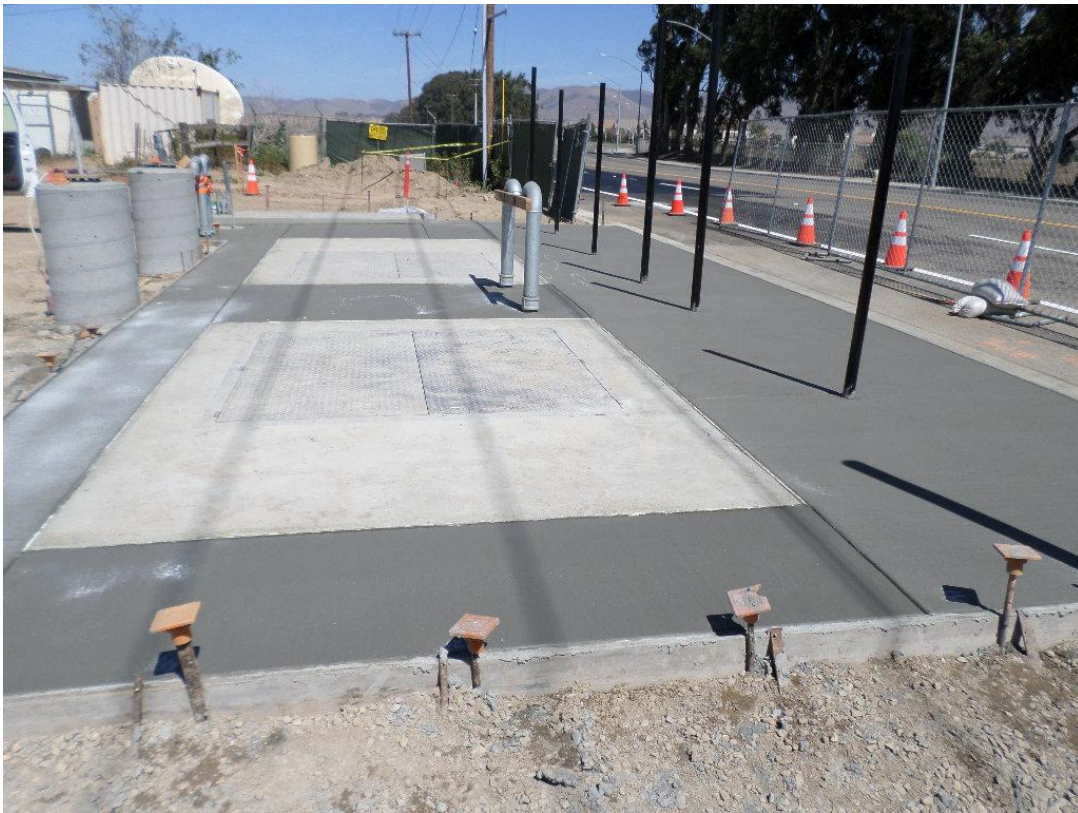
Completed sidewalk and concrete around vaults.