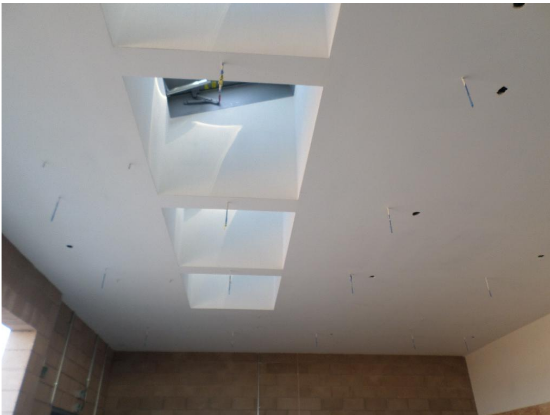
Pump room ceiling completed and ready for coating.