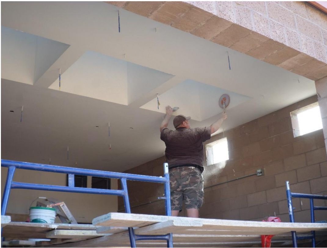
Ely Dodson Construction sanding the finish on the pump room ceiling.