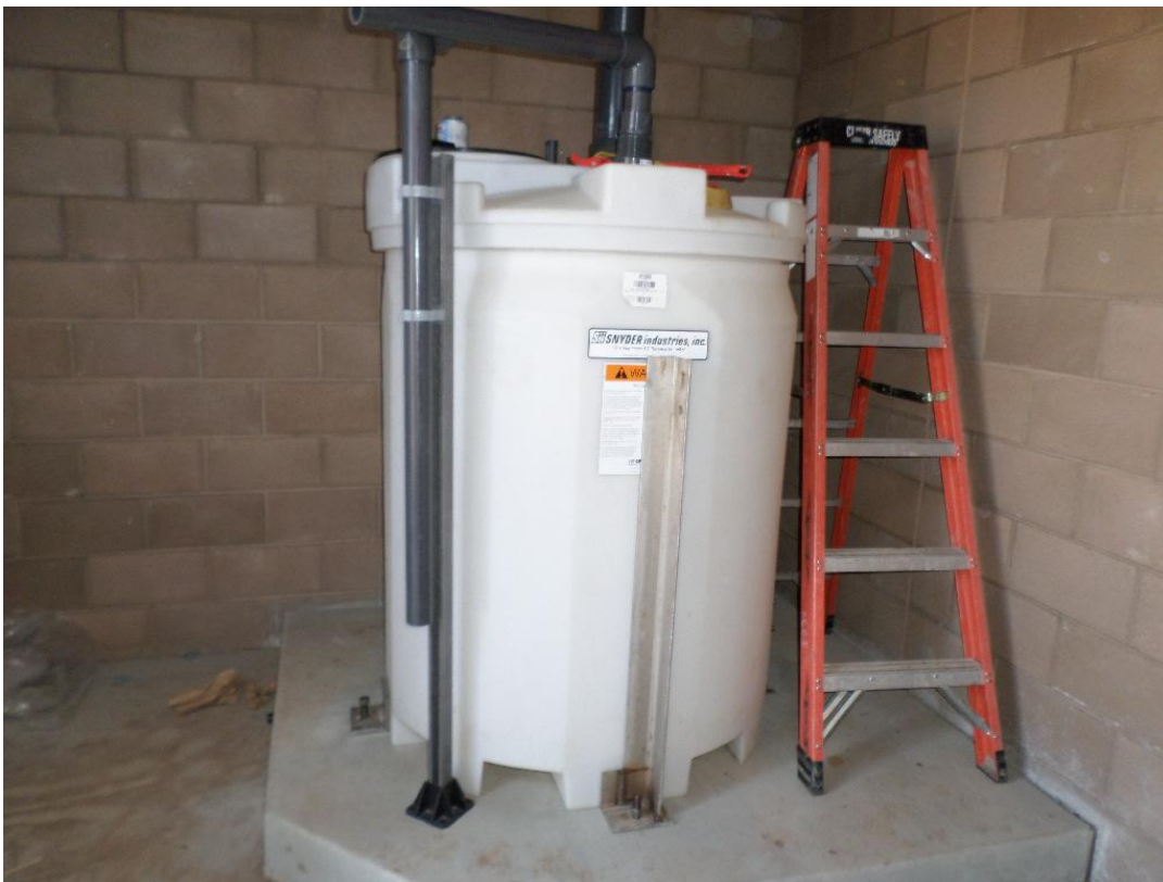
Spieß installing chemical tank hold downs and fill piping in both chemical rooms.