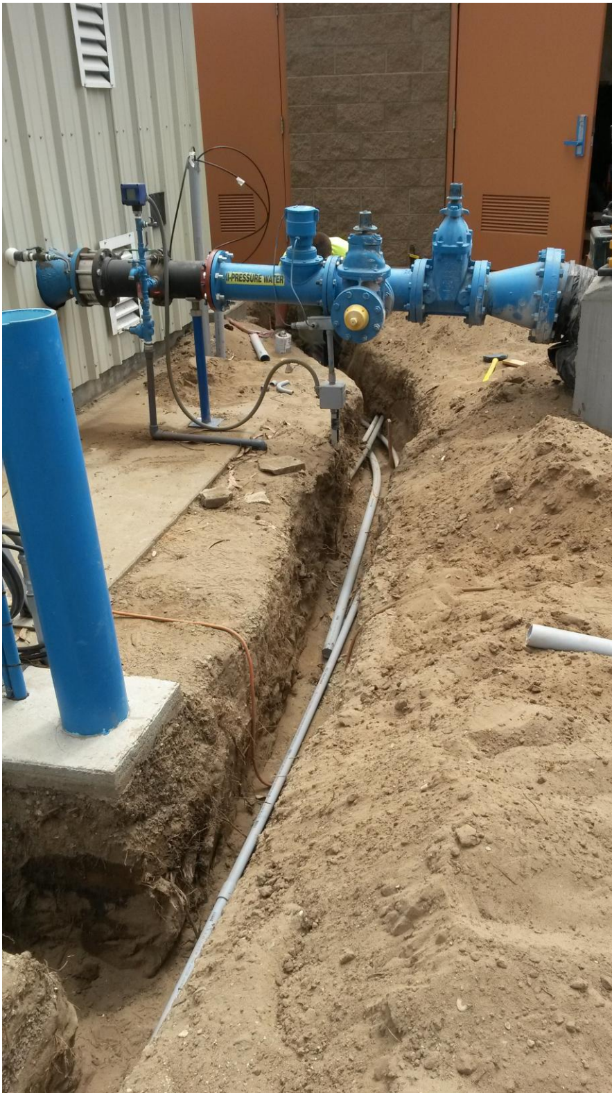
St. Denis Electric installing underground conduit.