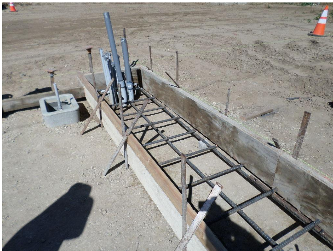
Forms and reinforcing for electrical panel pad.