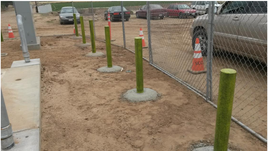
Coast Painting priming stationary bollards at the PRV vault.