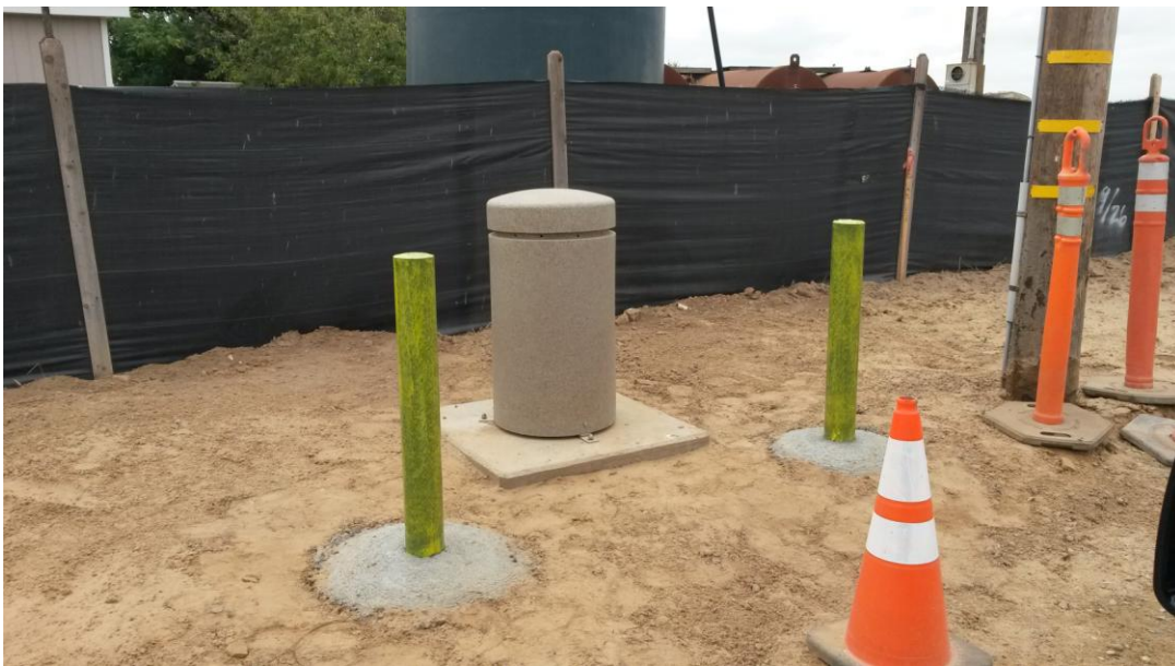
Coast Painting priming stationary bollards along access road.