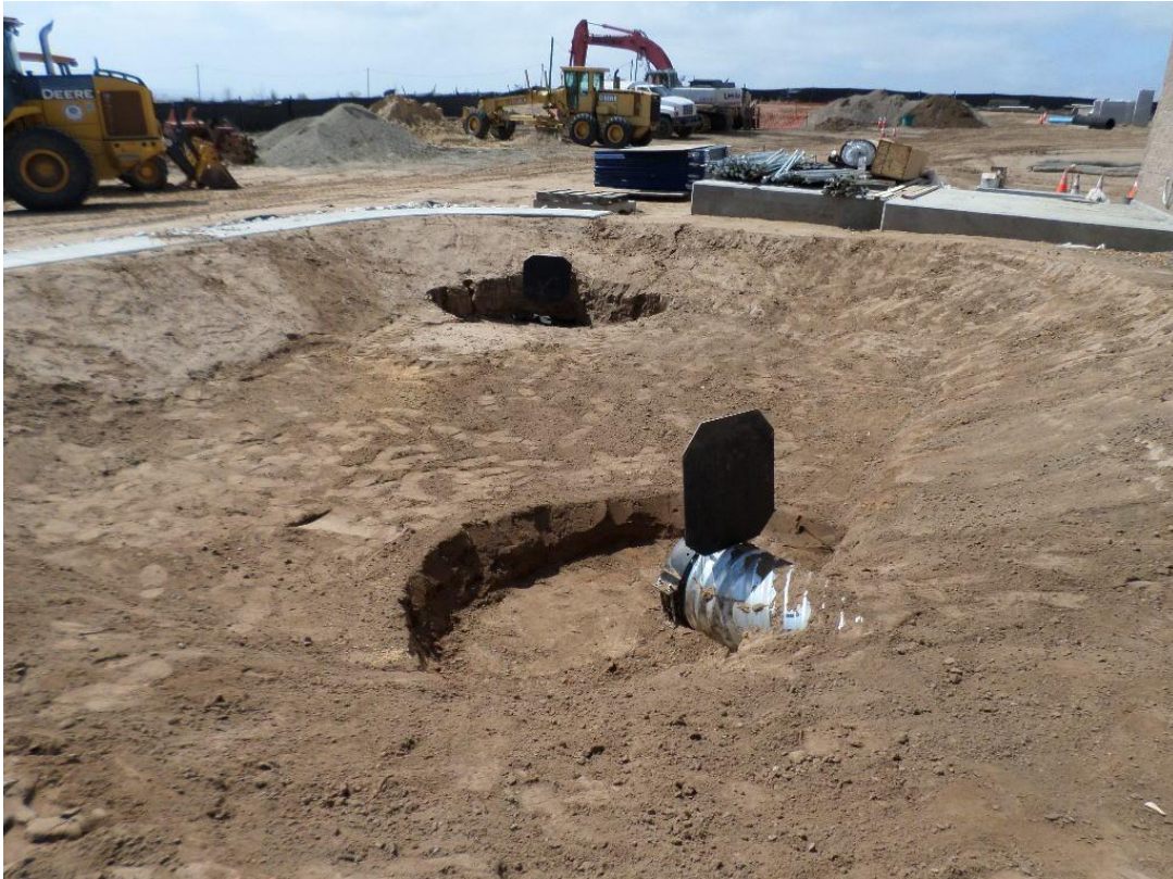
Excavation for rip rap at storm drain inlets in retention basin.