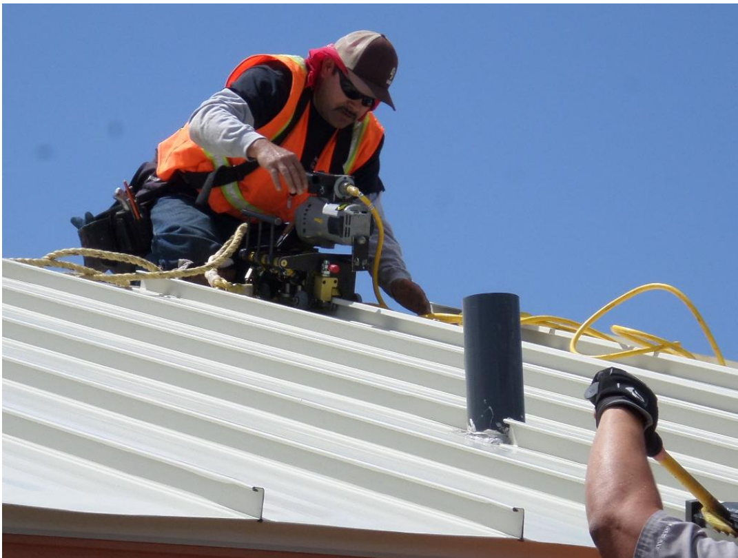
Quaglino Roofing installing seamless metal roof on pump station building.