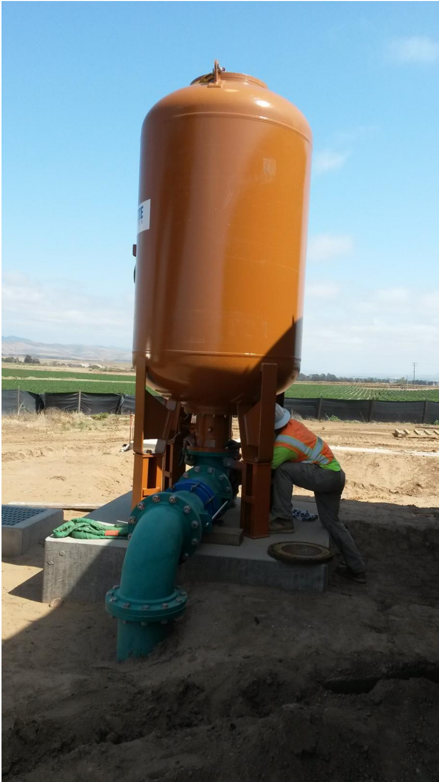
Surge tank in place on concrete pad.