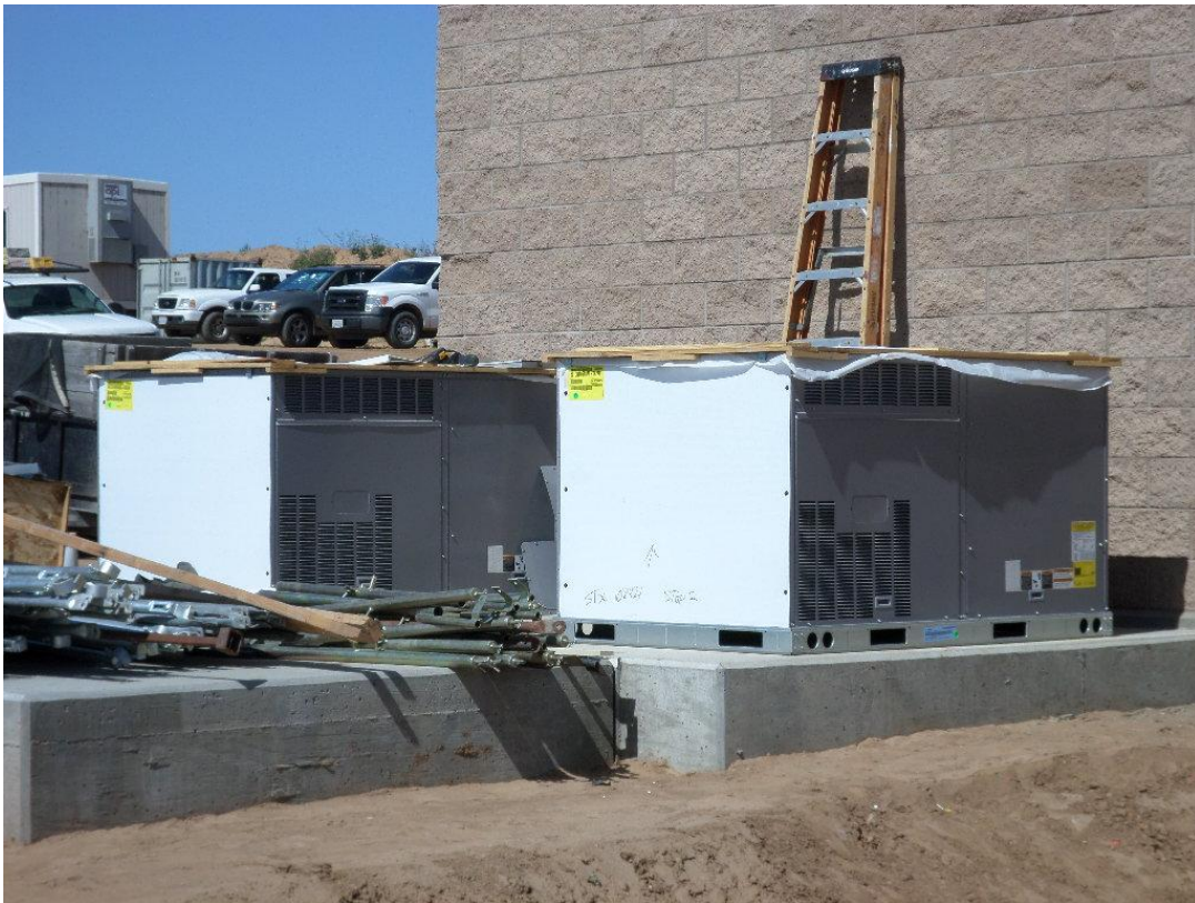
AC units delivered, set and anchored by Dahl Air Conditioning.