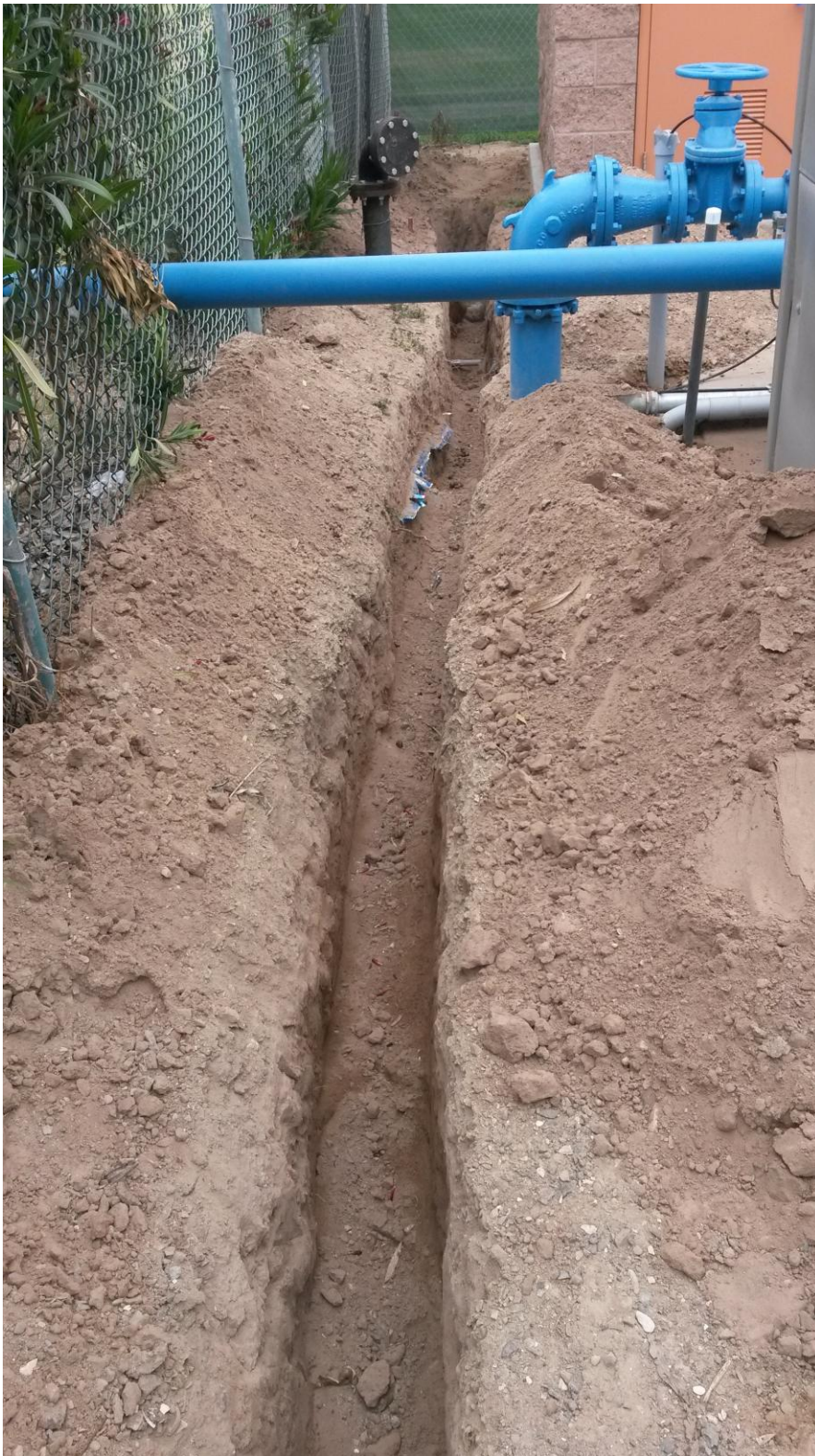
St. Denis Electric working on trench and installation of underground conduit.