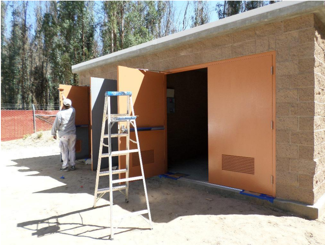
Coast Painting priming metal doors.