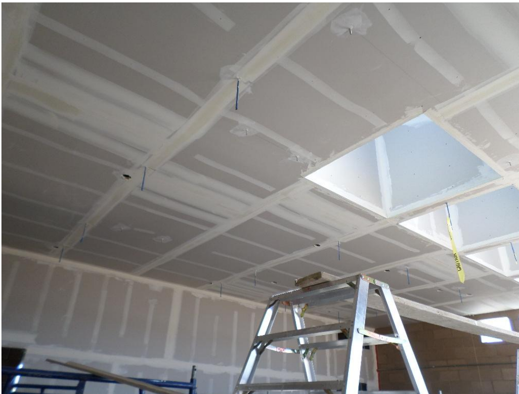
Ely Dodson Construction taping sheet rock inside pump station.