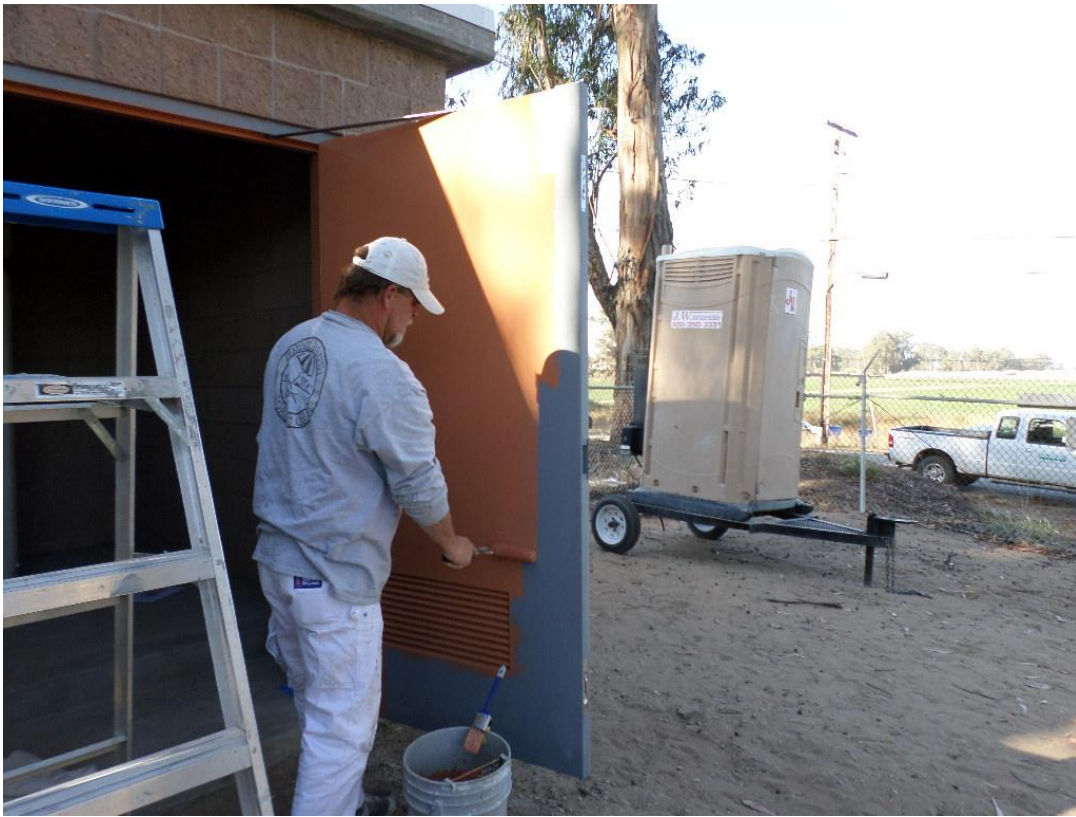
Coast Painting applying prime coat to metal doors.