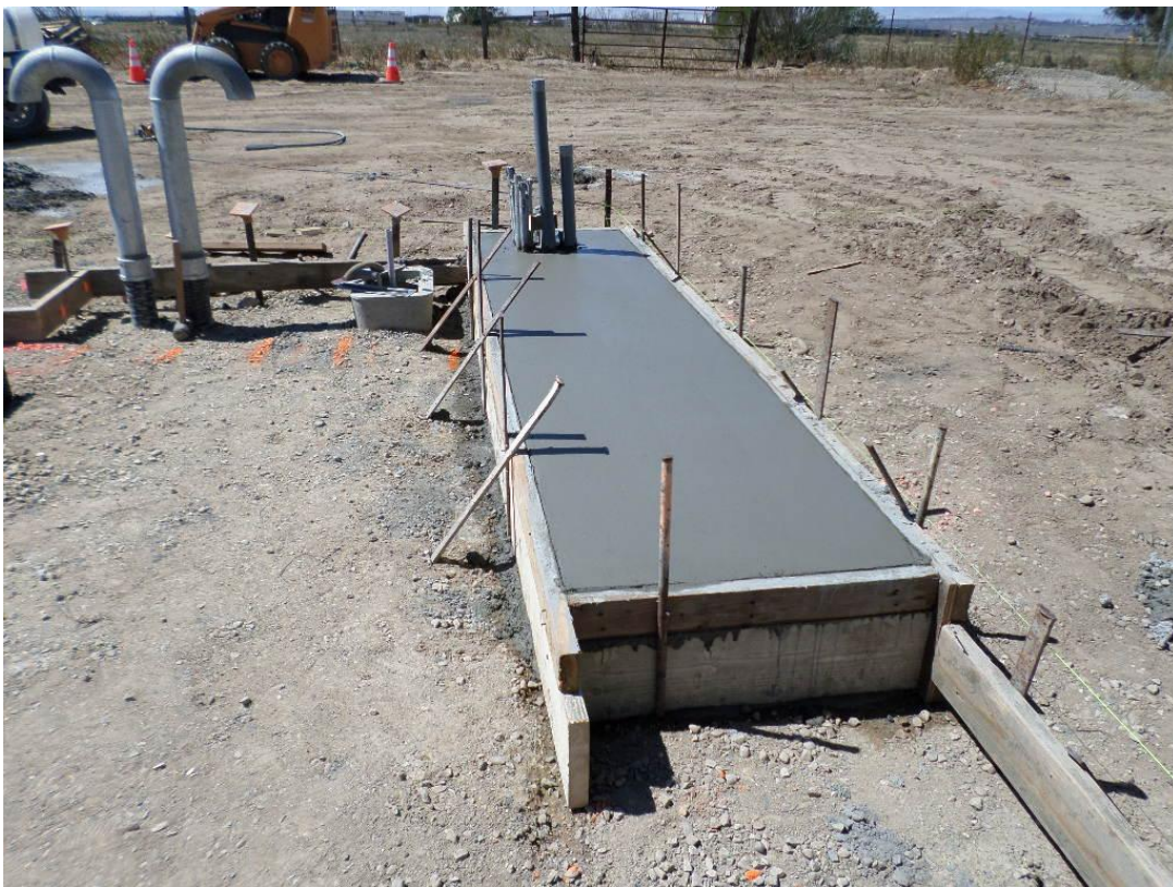
Completed pad for electrical panel.