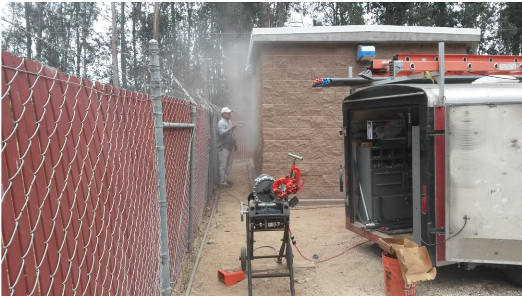
Coast Painting sealing outside of building.