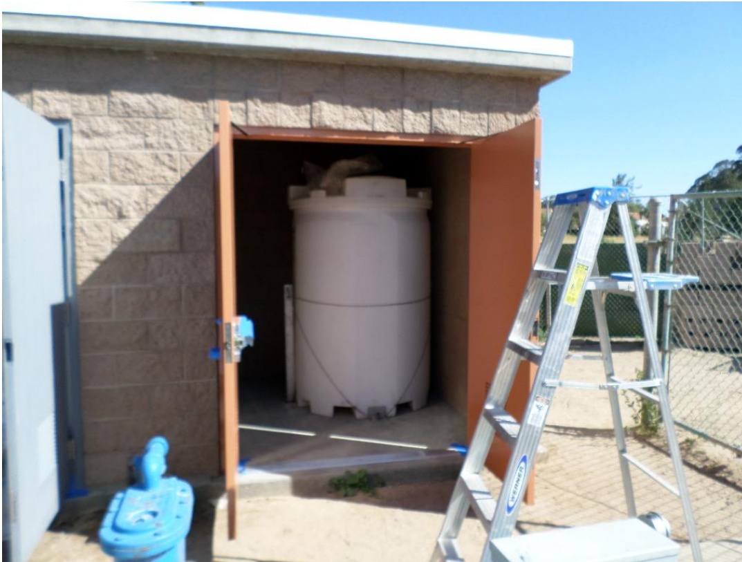
Coast Painting applying primer on doors.