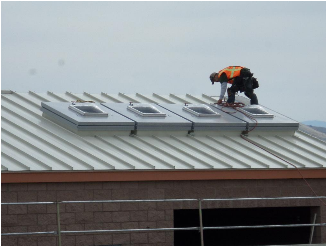
Quaglino Roofing completing seamless metal roof on pump station building.