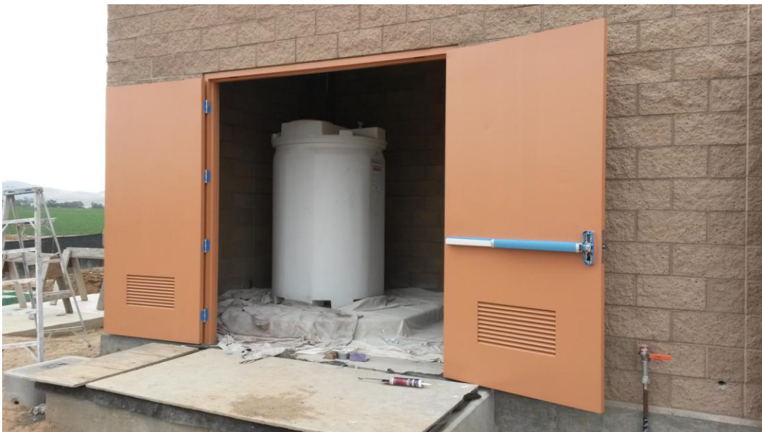
Coast Painting applying prime coat to interiors of doors at pump station.