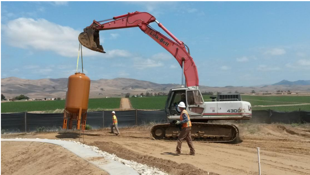
Spiess moving surge tank into place on concrete pad.