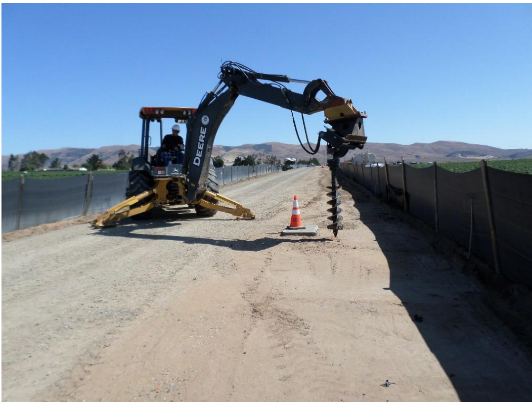
Spies auguring holes in access road for bollards at AT&T pull boxes and other appurtenances.