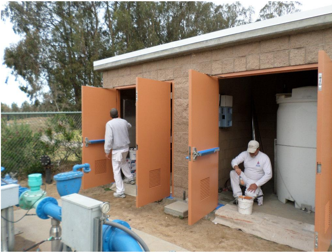
Coast Painting applying final coating to doors.