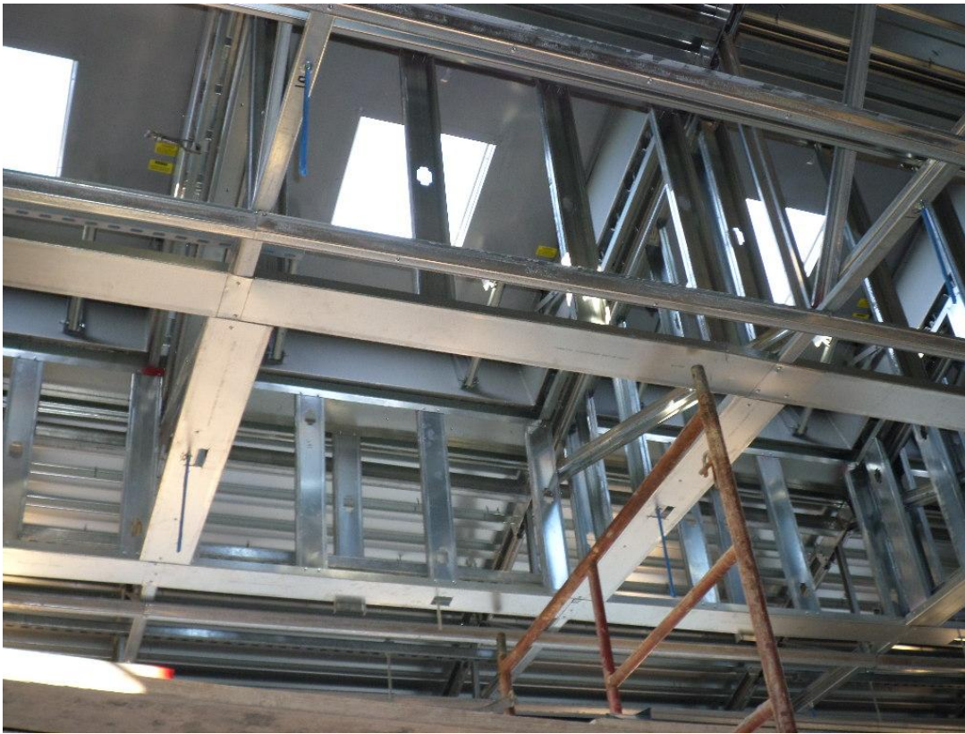
Ely Dodson Construction framing walls and ceiling at the roof hatches.