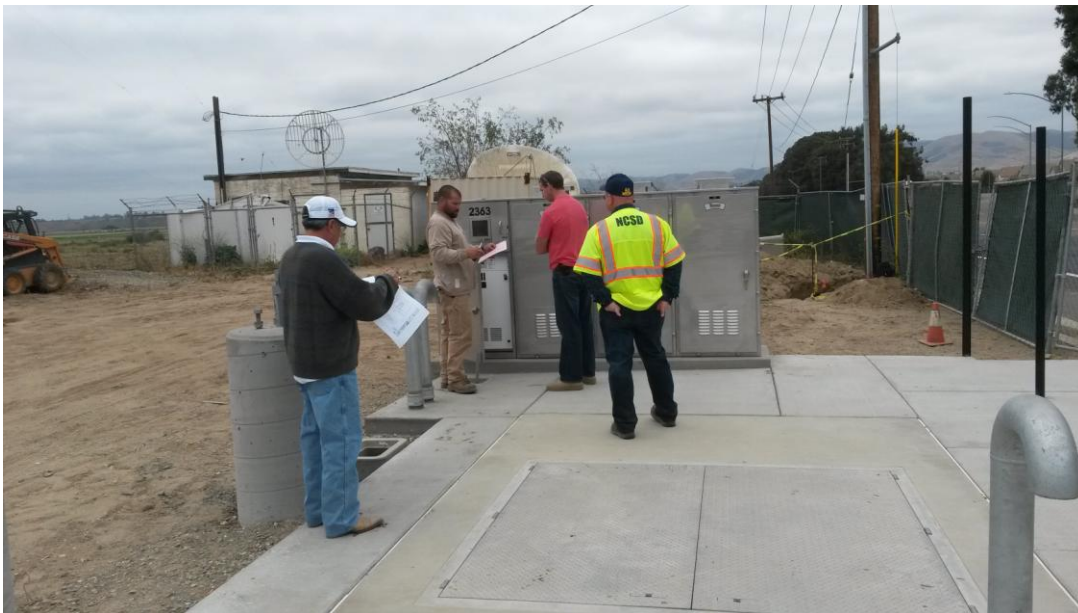
AECOM performing electrical inspection for PG&E to allow service connection.