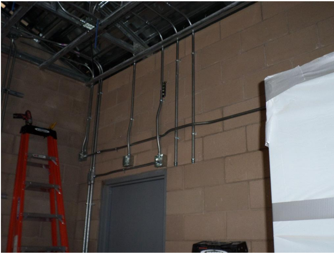
St. Denis Electric installing conduit and receptacles inside electrical room at pump station.