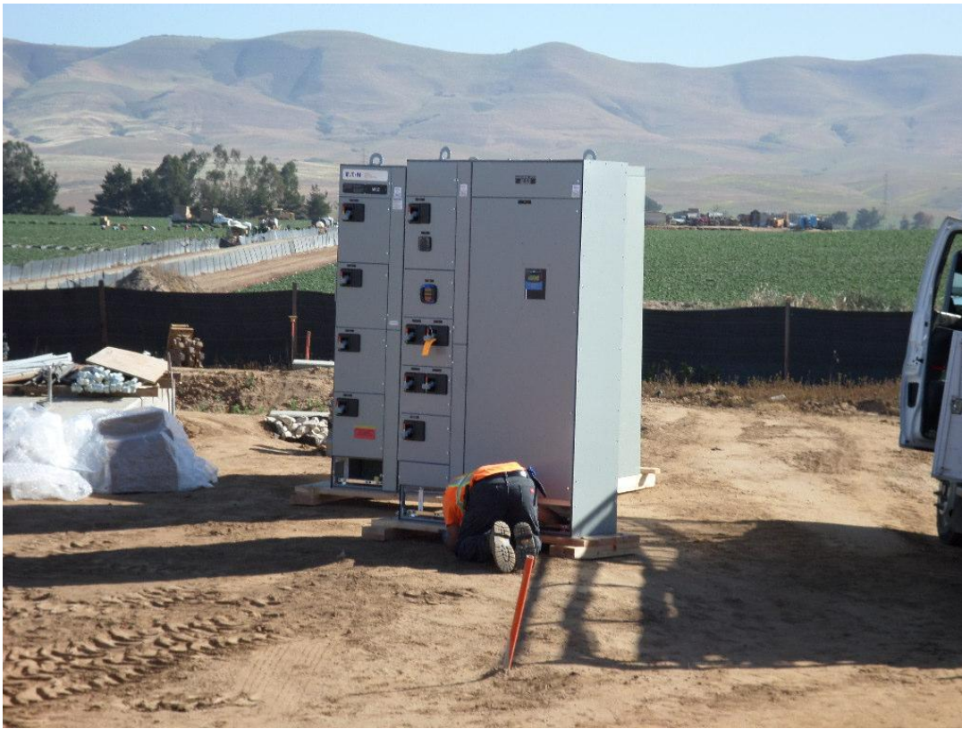
Electrical gear delivered to pump station site.