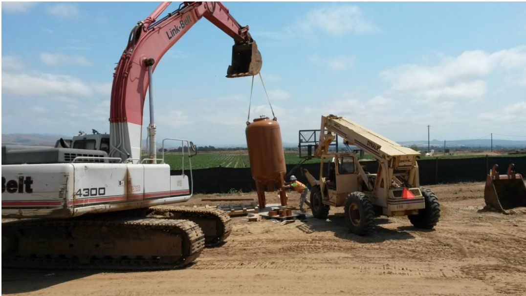
Spiess moving surge tank into place on concrete pad.