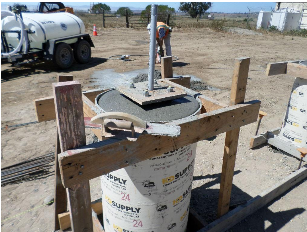
SCADA tower base poured.