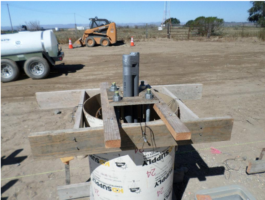
Forms, reinforcing and anchor bolts in place for SCADA tower base.