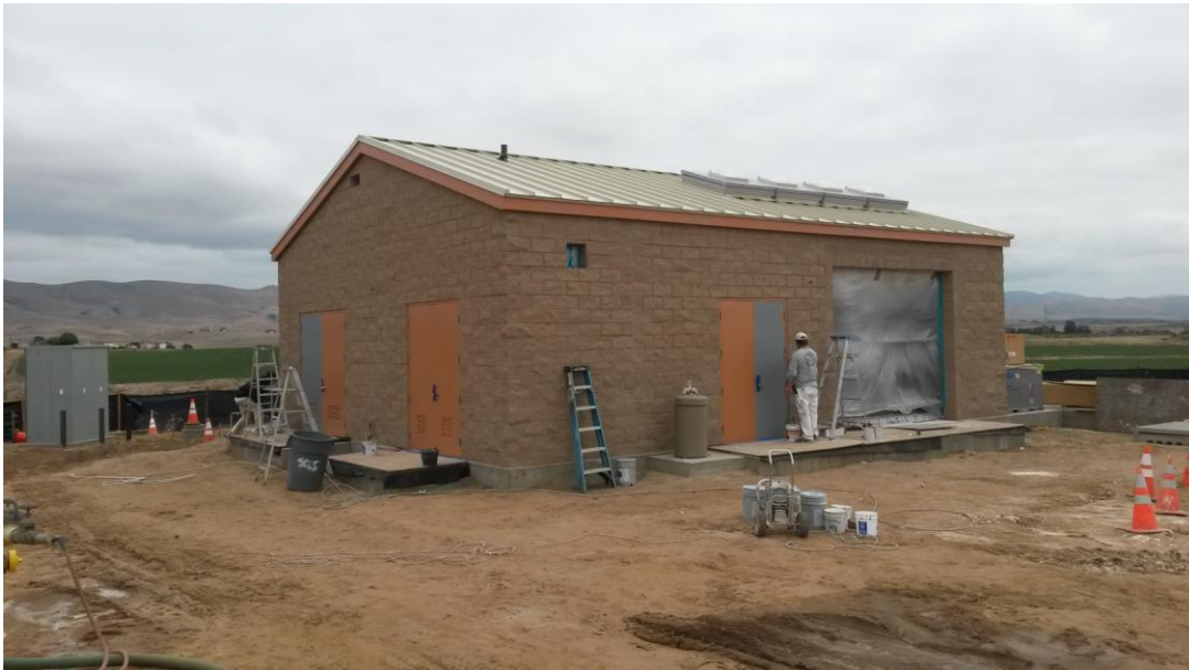
Coast Painting priming metal doors at pump station building.