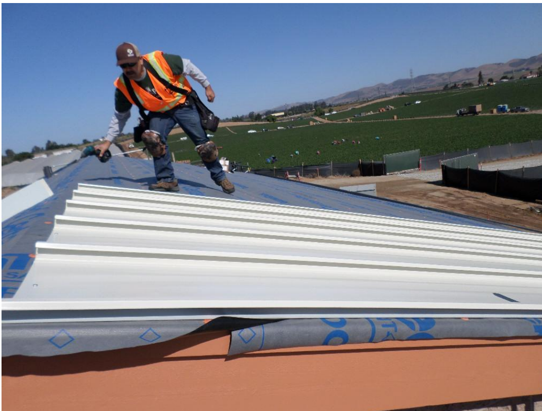
Quaglino Roofing installing seamless metal roof on pump station building.