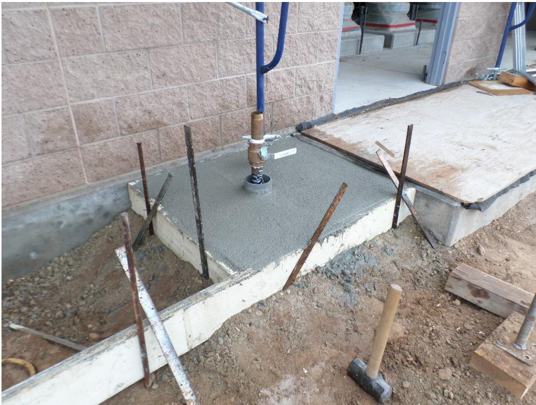
Concrete pad poured for air release valve at pump station.