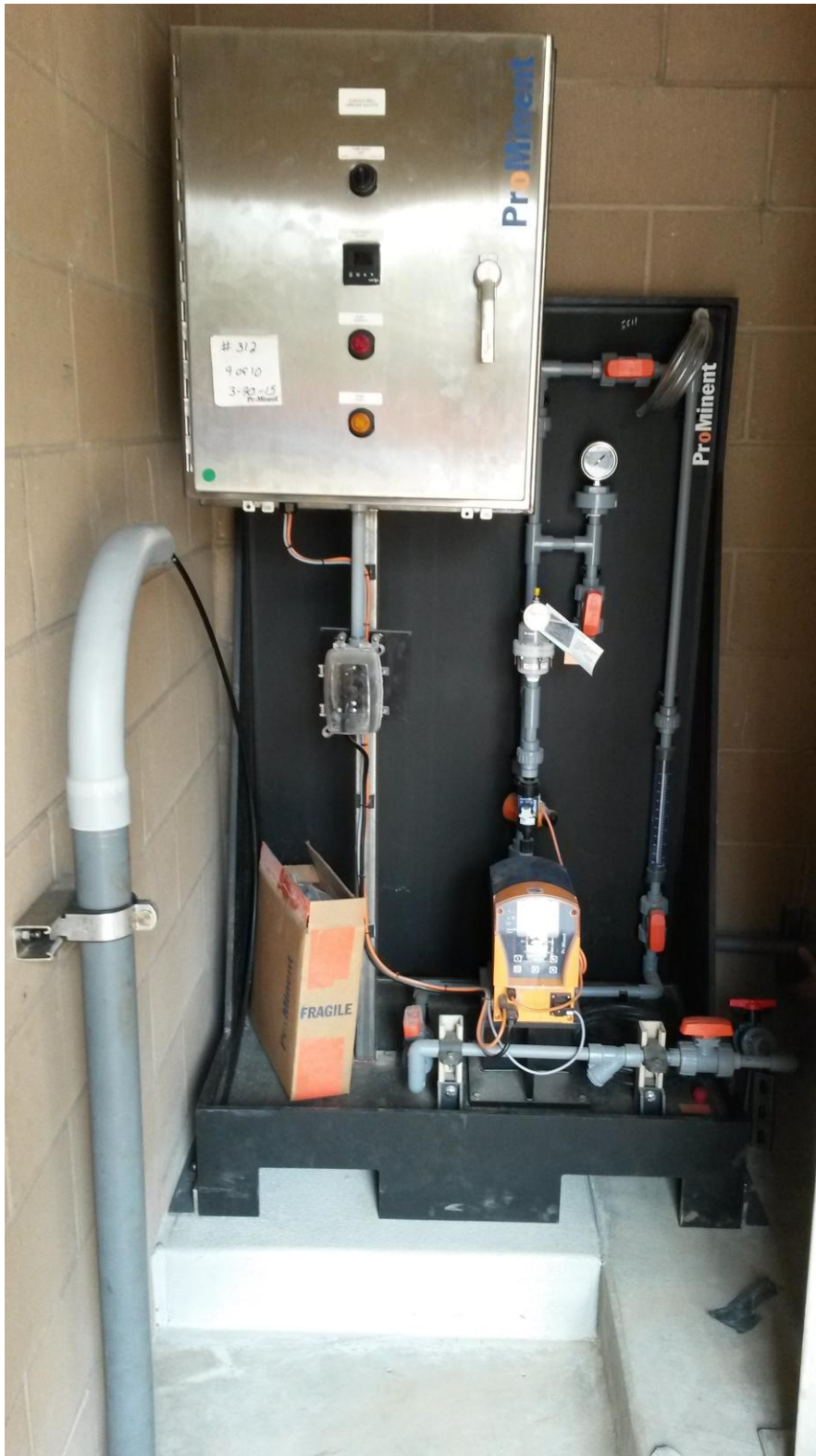
Chemical feed skid delivered and installed.