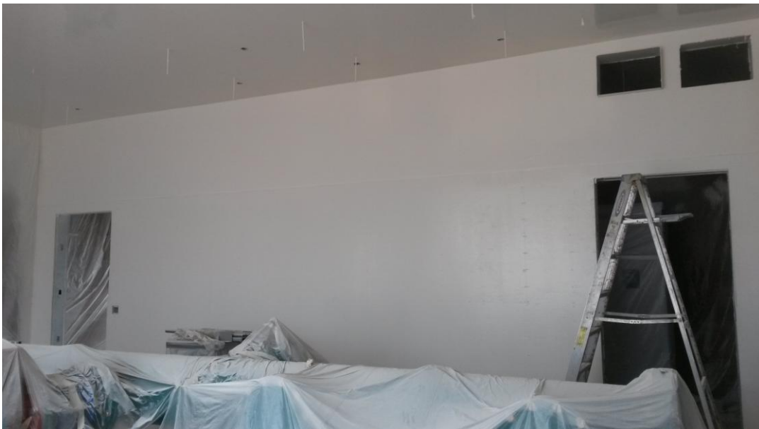
Coast Painting coating wall between pump room and electrical room.