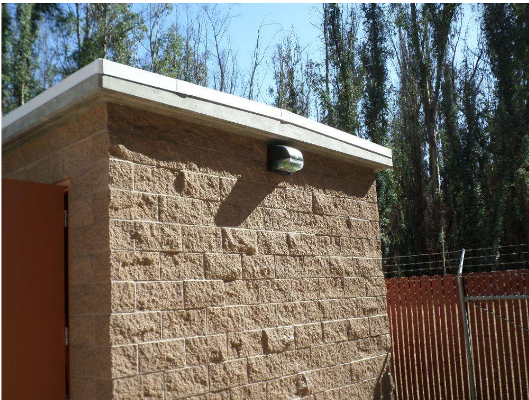
Exterior lighting installed.