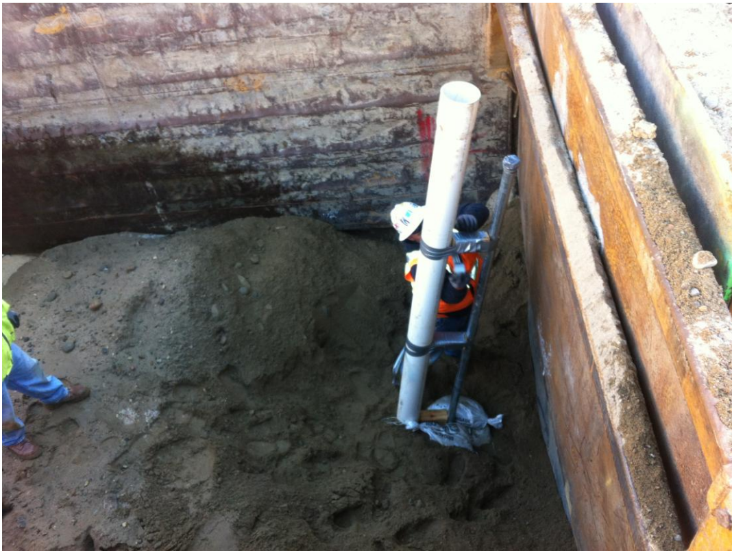
Valve can and riser with 4 X 4 struts in between for support.