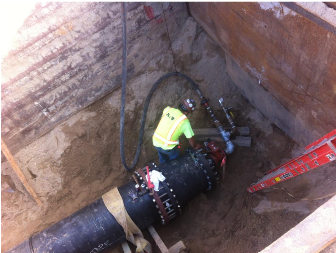
Pressure testing pipe with pump connected to south end.