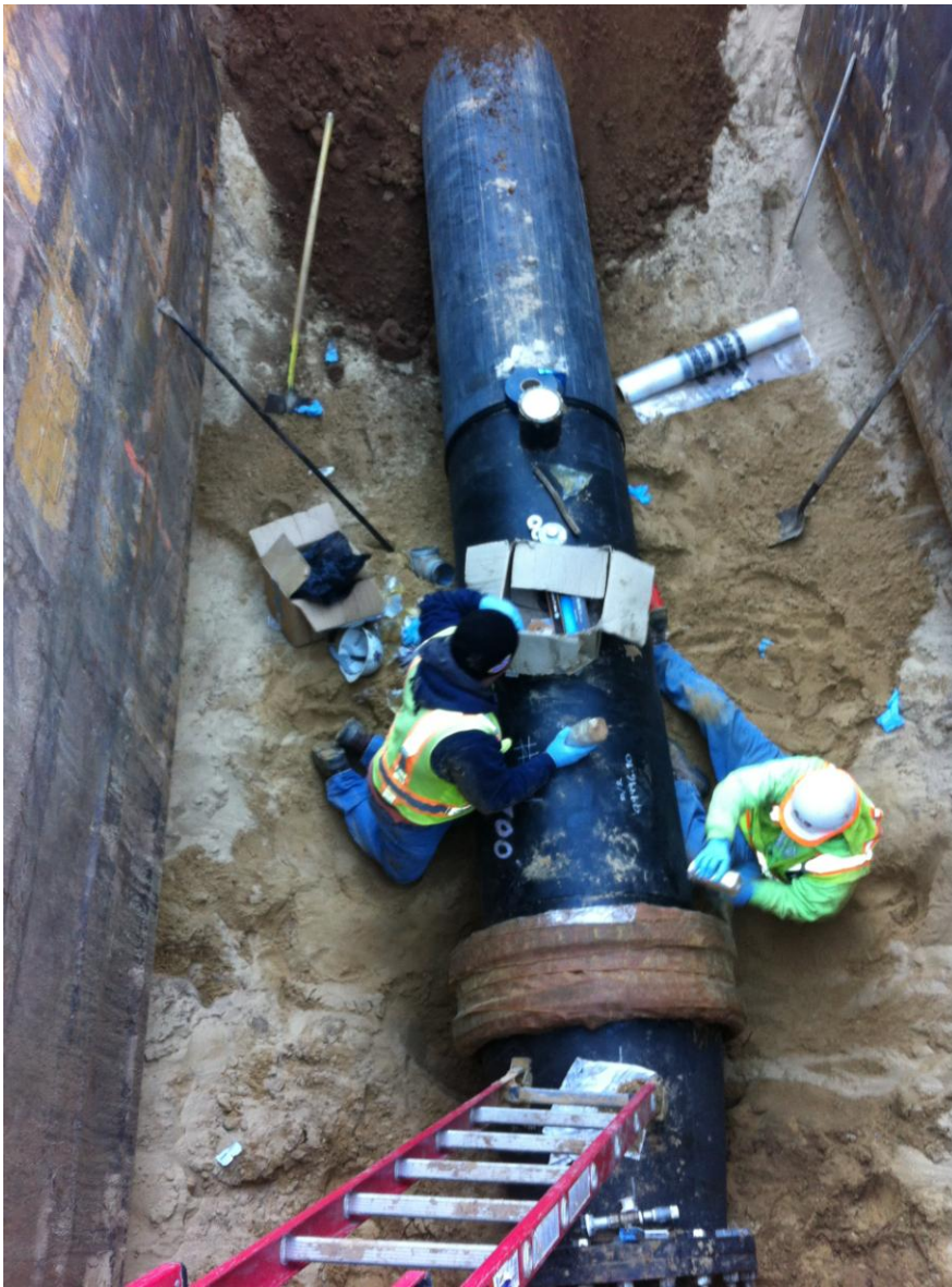
ARB placing wax tape coating on 30-inch flange around connection at reducer on end of HDPE pipe.