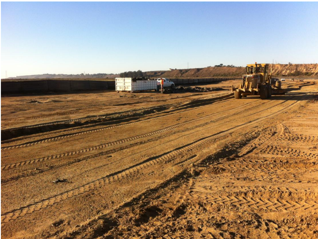
Final grading on south site.