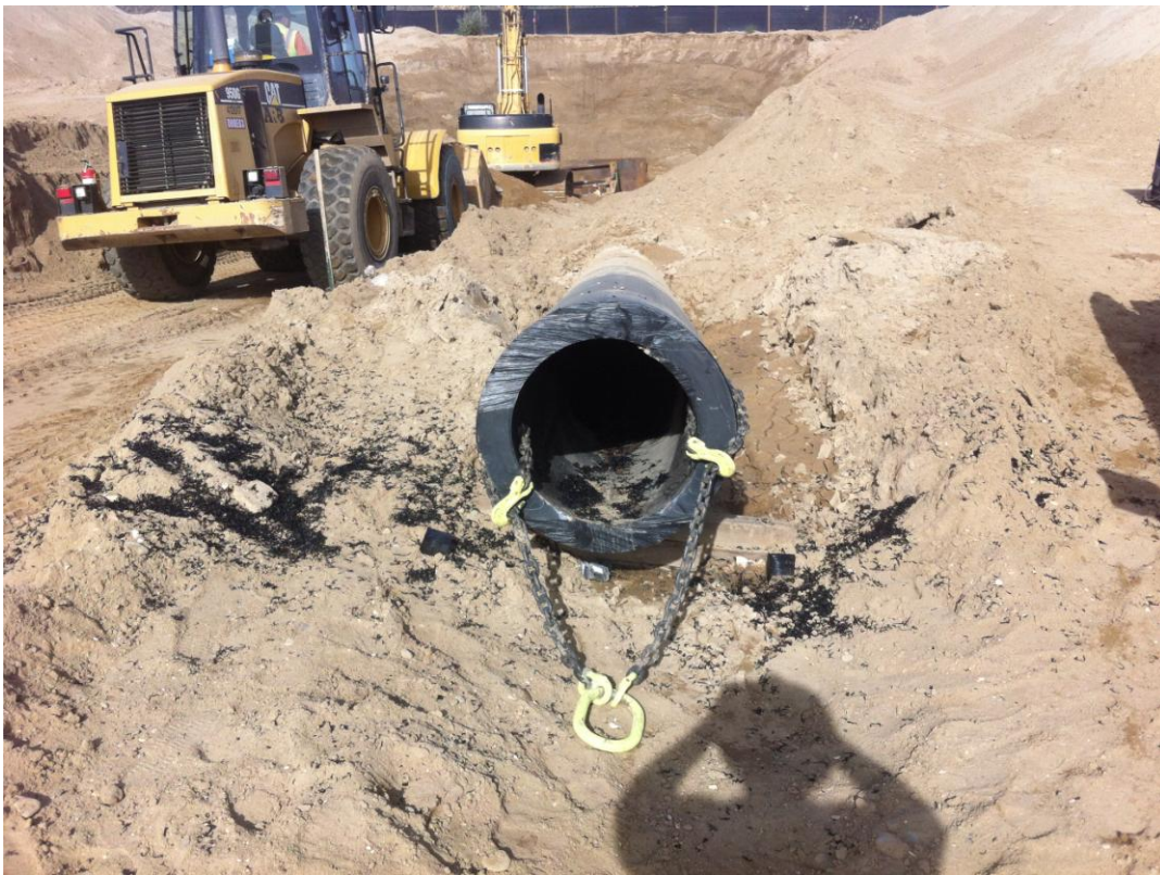
End of pipe at the surface, cut and ready for removal from remaining pipe which is at grade.