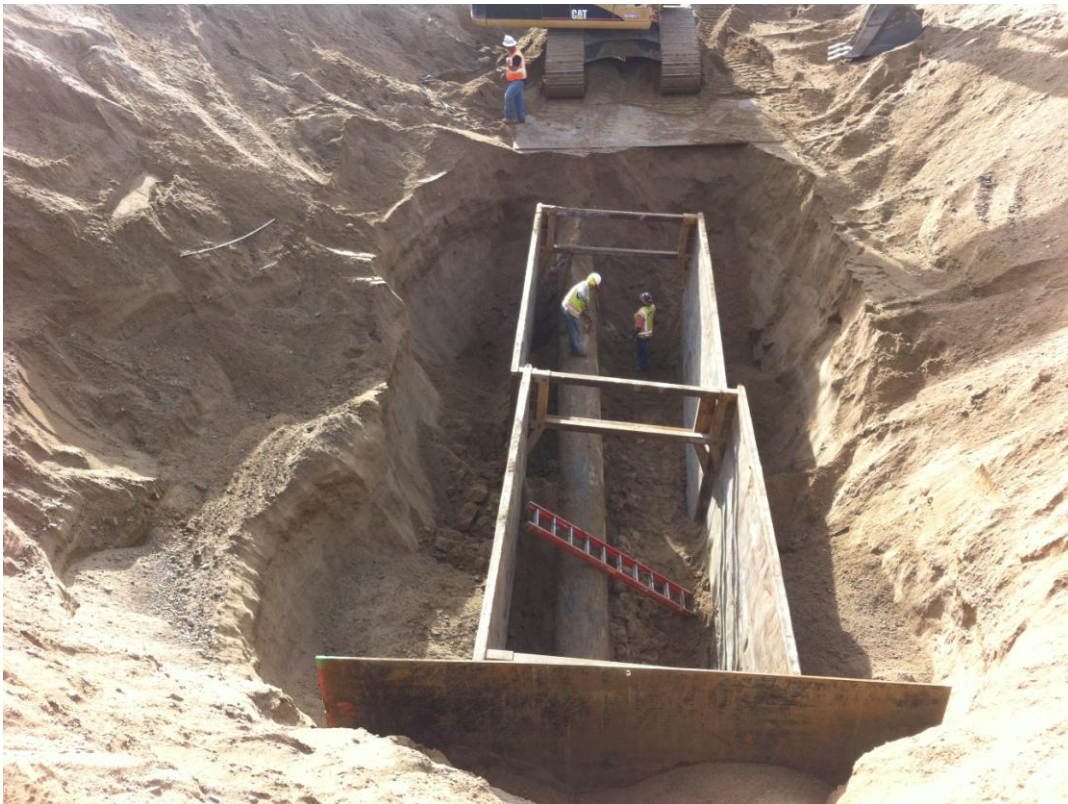
ARB continuing excavation around HDPE pipe in order to move it into horizontal and vertical alignment.