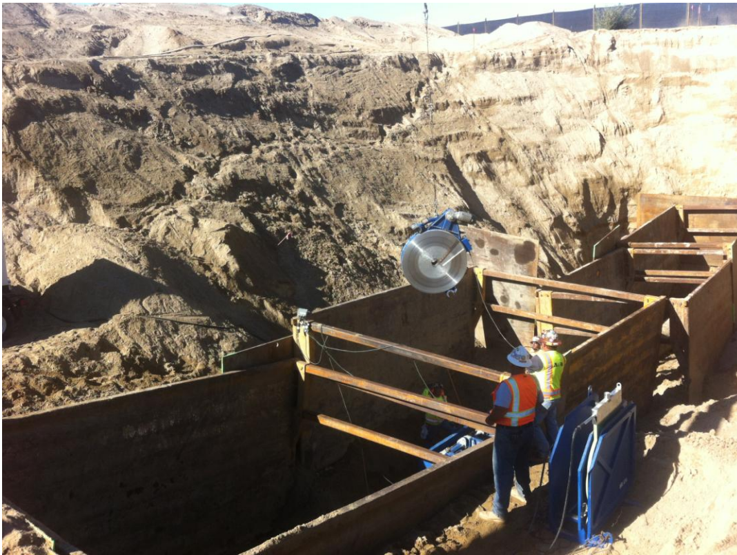
ARB lowering the pipe fusing machine into place.