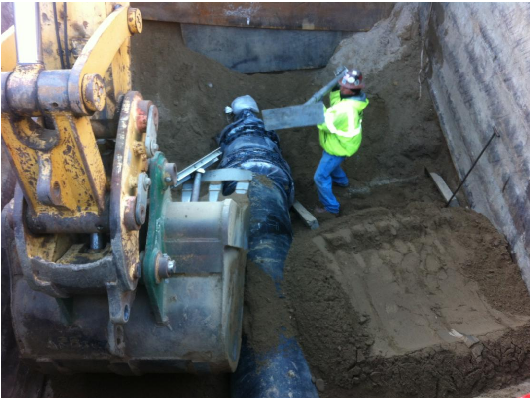
ARB removing hydraulic shoring jacks holding pipe in place after securing with compacted backfill.