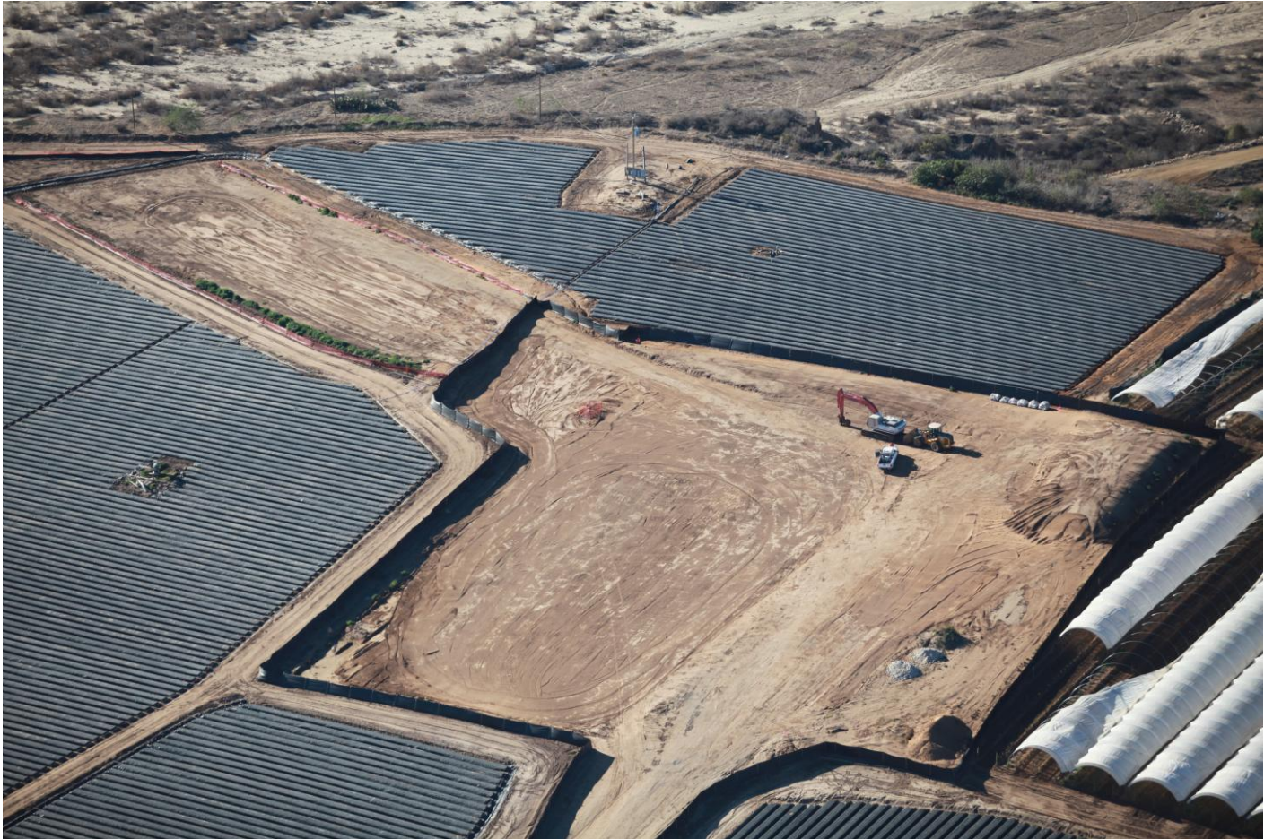
Aerial view of the north side of the project showing ARB equipment demobilized, the site and sink hole area rough graded, and Spiess Construction equipment mobilized for Bid Package #4.