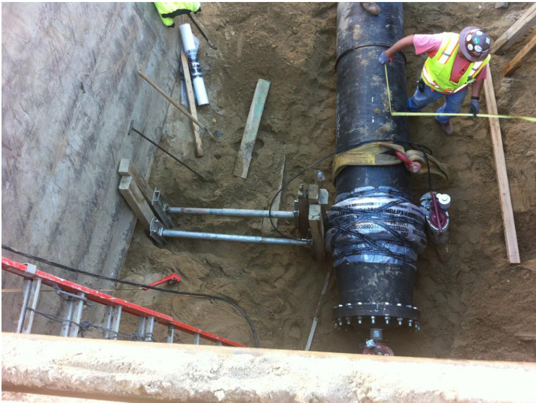
ARB and MNS making final checks of alignment in the field, before calling MNS surveyors to verify alignment and As-Built the end location.