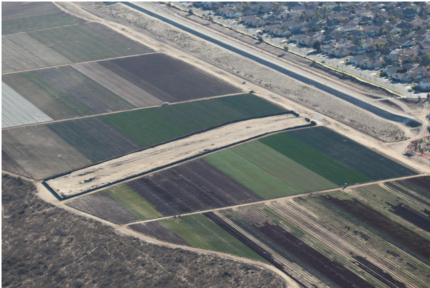
Aerial photo of the south side with all ARB equipment demobilized and the site rough graded.