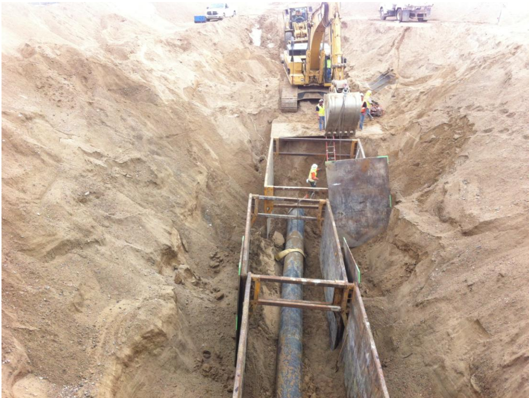
ARB continuing to place shields around pipe.