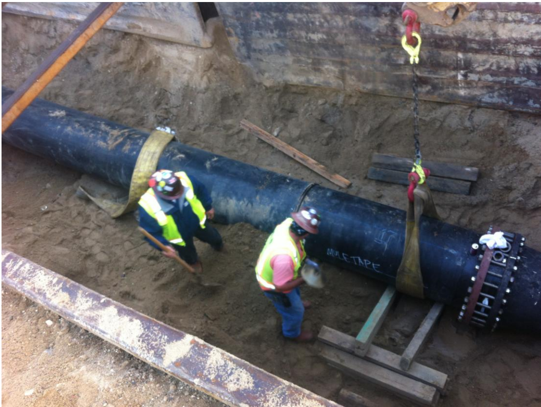
ARB shifting end of pipe to reach alignment.