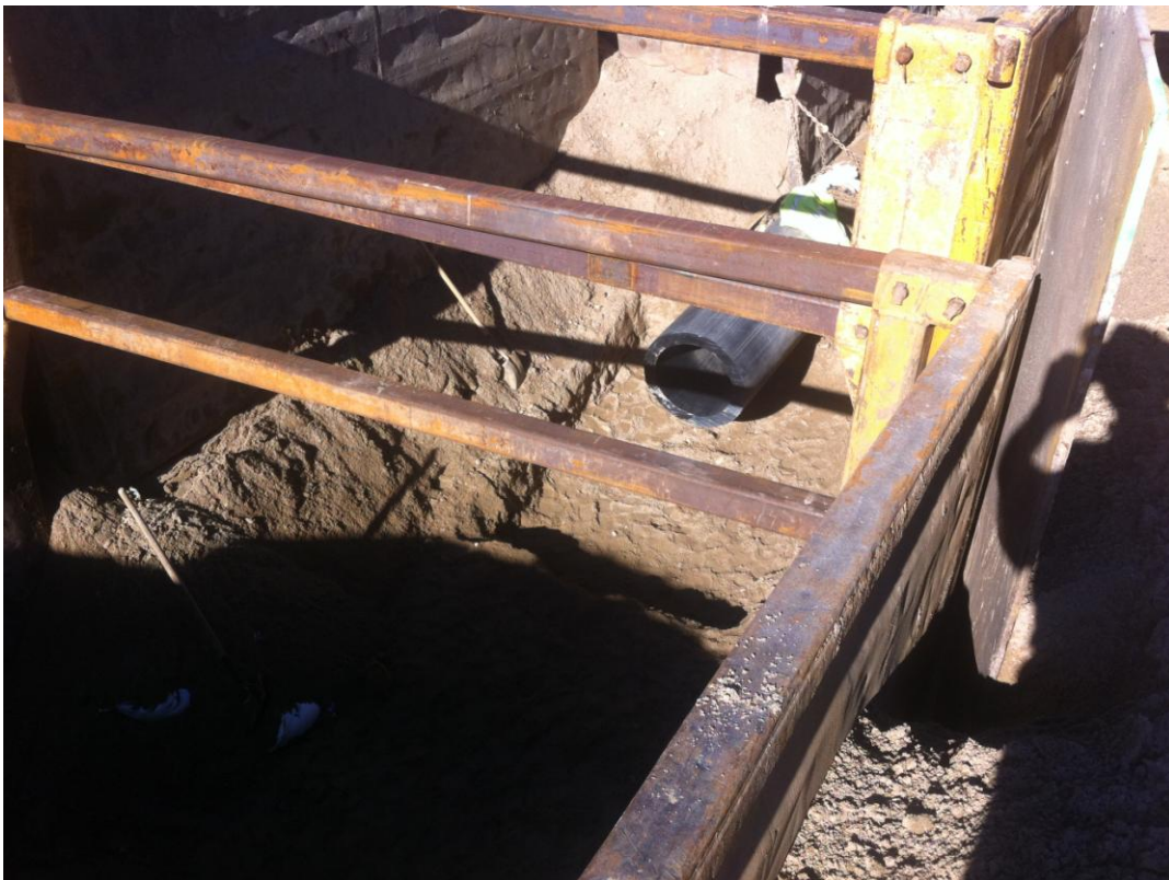
South end of HDPE pipe at grade and ready for fusing of pipe extension to put the pipe back onto the design alignment.