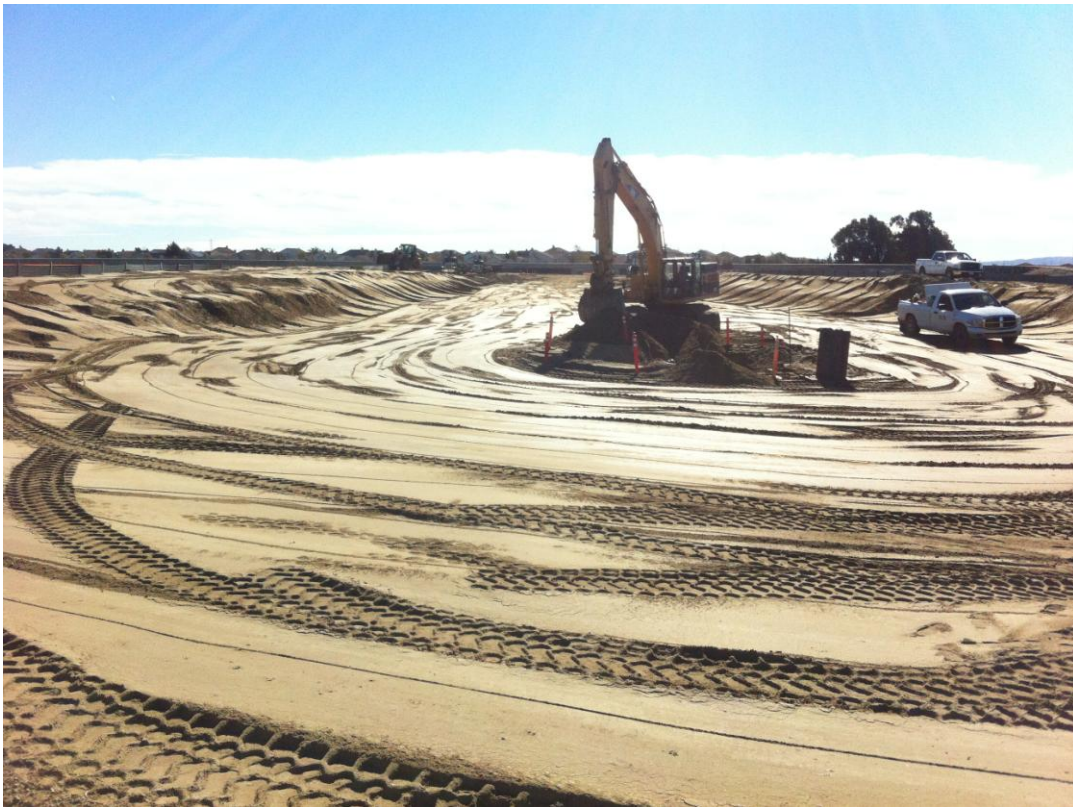
South site after demobilization. ARB continuing to complete end at riser and finish grading.