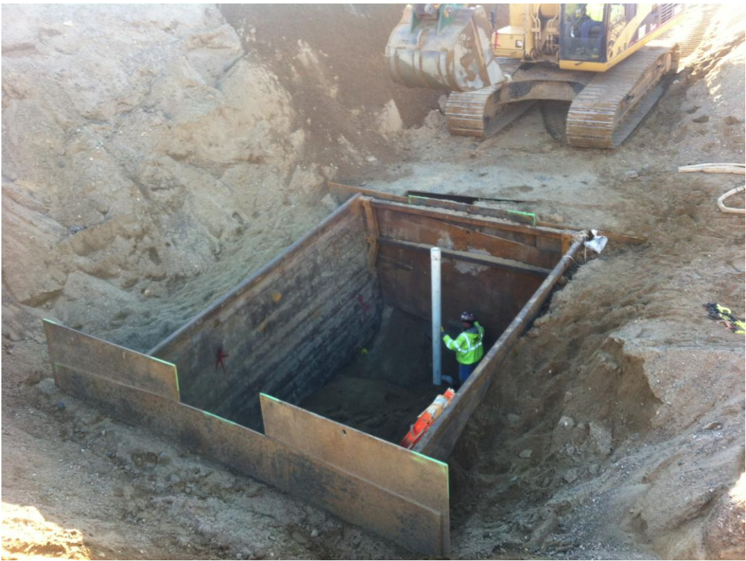
ARB installing 4-inch gate valve and riser at the end of the pipe.