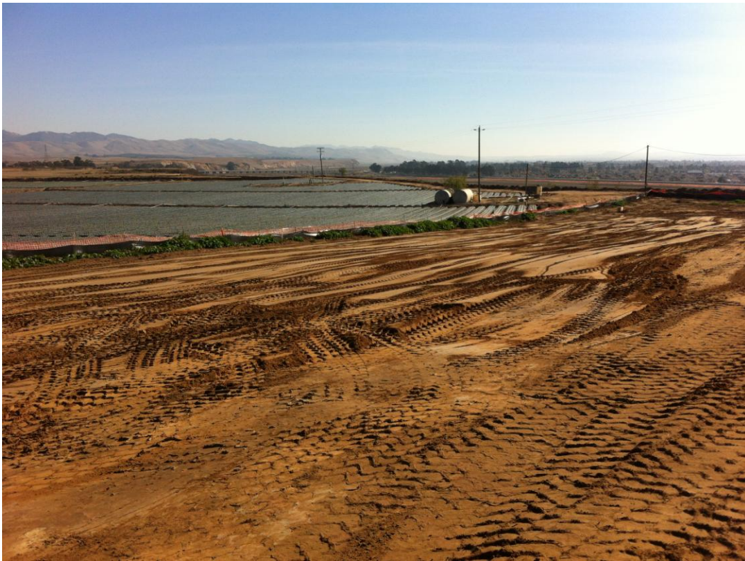
Area where sink holes occurred compacted and regraded.