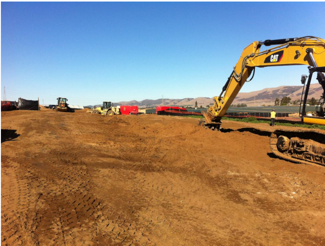
Final compaction over sink holes.