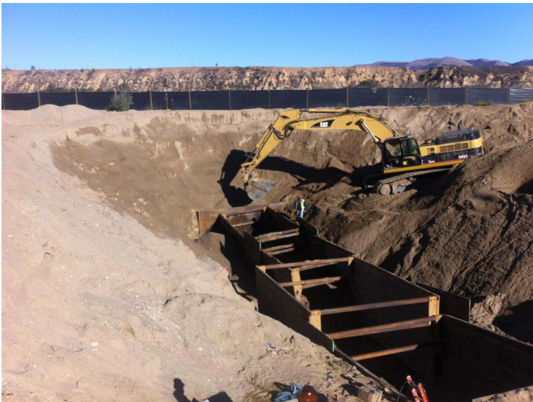
ARB removing trench shields and preparing to backfill.