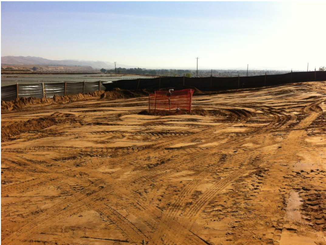
ARB demobilized, site graded and end of pipe riser protected.