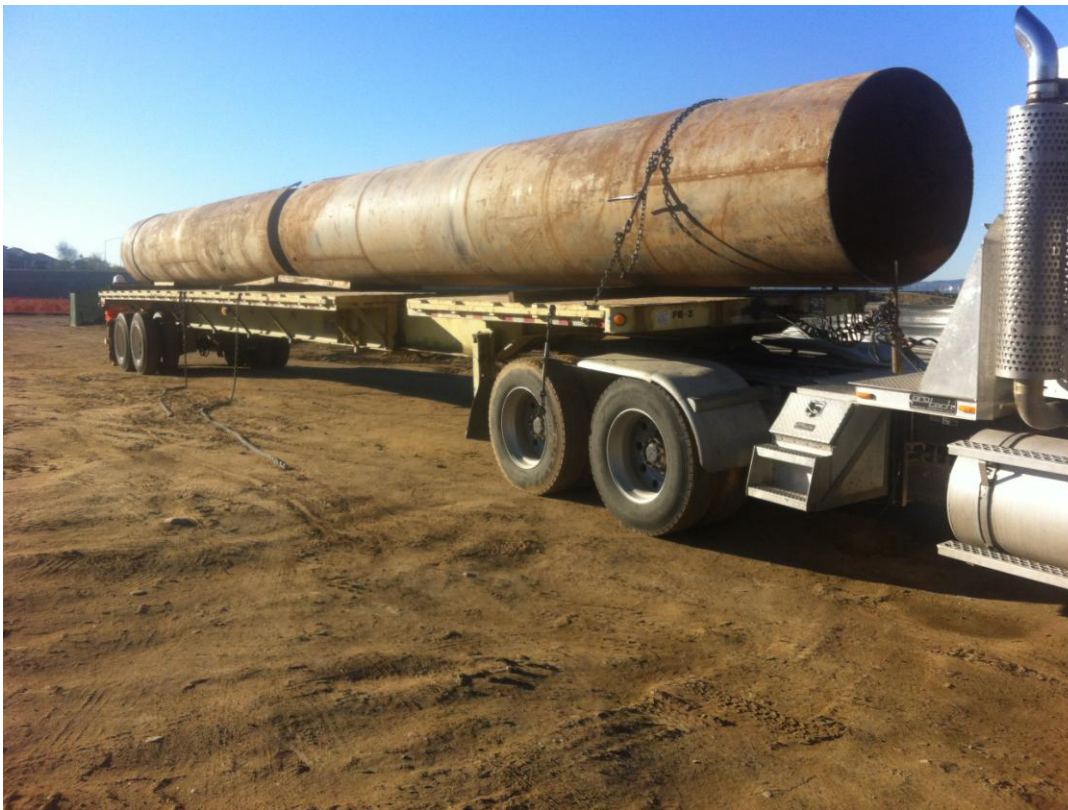
ARB removing 54-inch casing from the site.