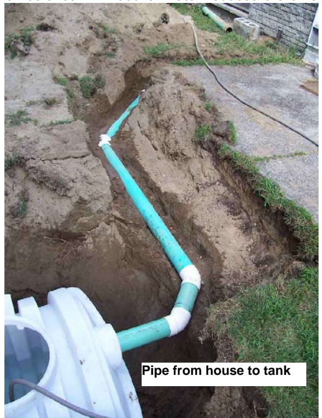
Pipe from house to tank

Front-loading washing machines use almost half the water of top-loading washers. Wash only full loads, and adjust load level settings for small loads. Distribute wash loads evenly throughout the week to avoid overloading the system with large volumes of water.