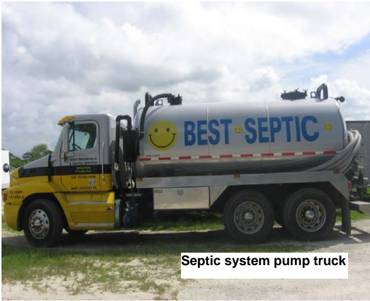
Septic system pump truck

A septic system evaluation should be conducted as soon as the property is placed on the market so that necessary repairs can be made to the system. The evaluation should be completed before the sale is final.