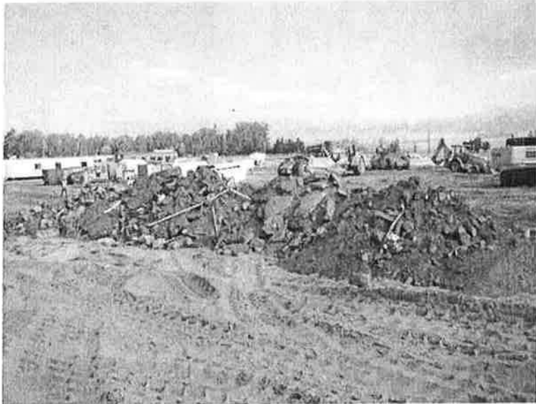
Debris to be hauled from site