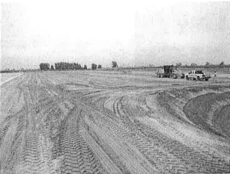
Sludge drying bed subgrade compacted and ready for aggregate base