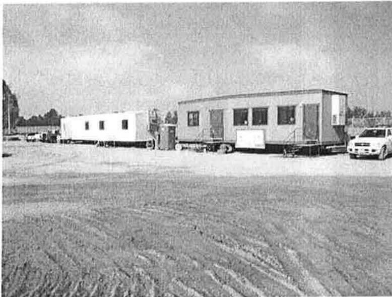
MNS Engineers and Cushman field office trailers