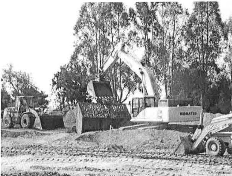
Separating debris from sand with Grizzly