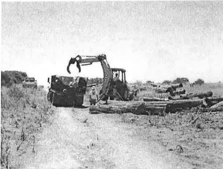
Removing eucalyptus logs and debris from the site