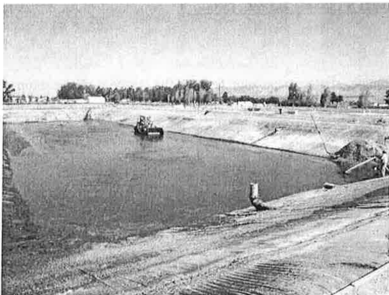
Removing sludge from Pond No. 1