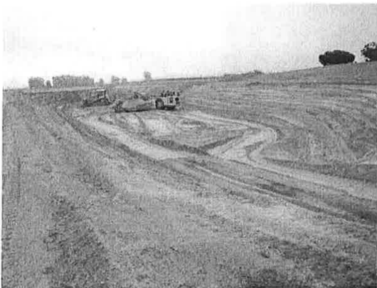
Continued excavation of Clarifiers No 1 & 2