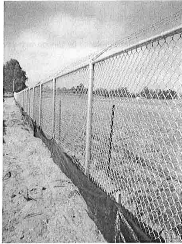
New chain link fence with exclusionary fence