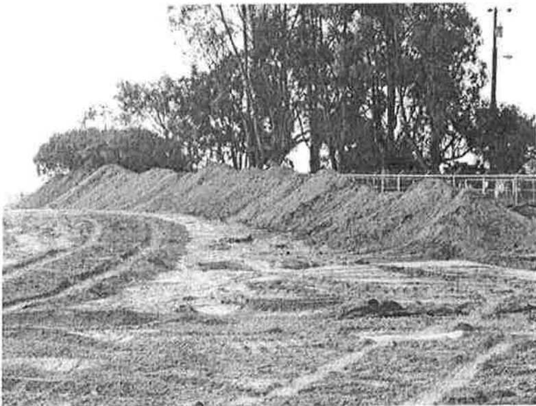
Remaining sand material after buried debris was separated out