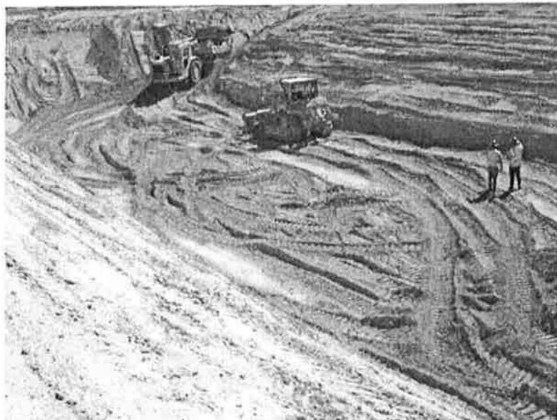
Excavation approximately 75% complete