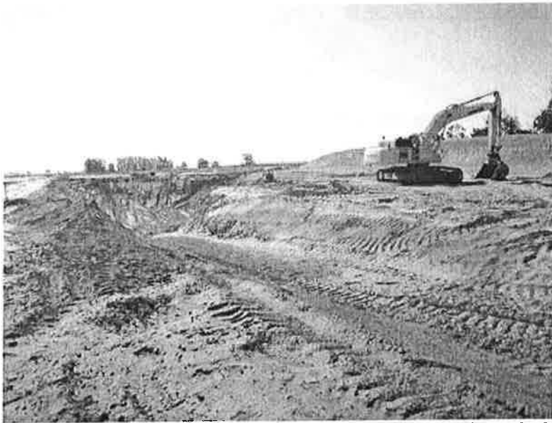
Continued excavation for Clarifiers No. 1 & 2, approximately 65% complete