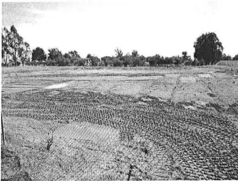
Prepping staging area for trailers, parking and equipment