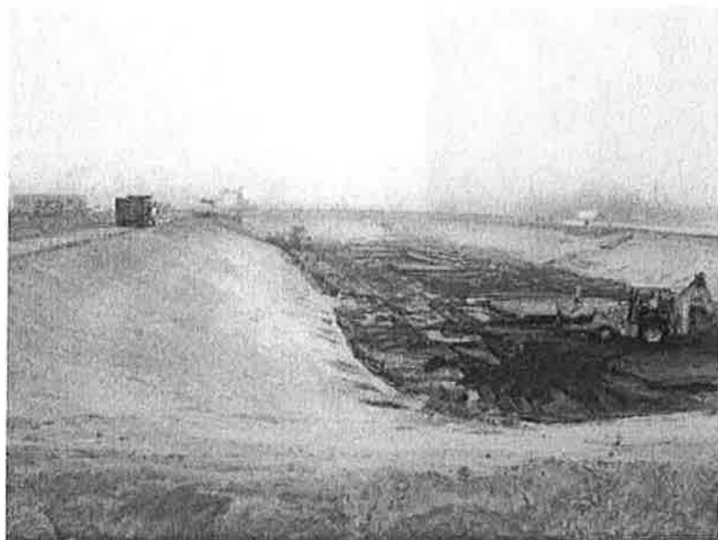
Liner removed and continued removal of sludge from Pond No. 1