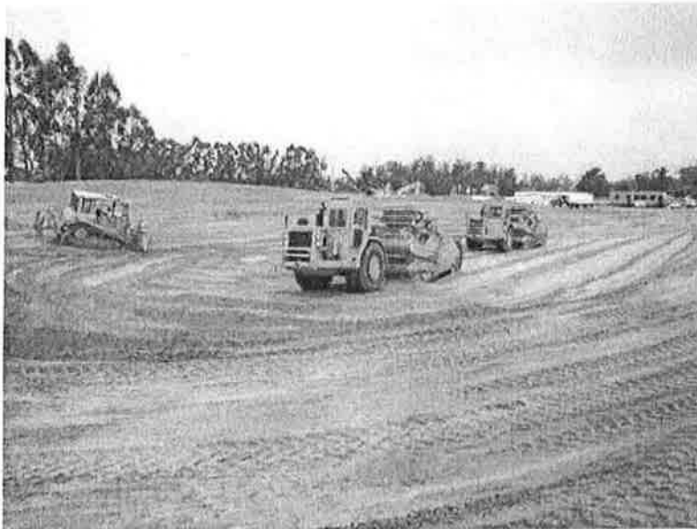
Starting excavation for Clarifiers No. 1 & 2