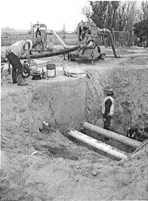
Pond No. 1 bypass