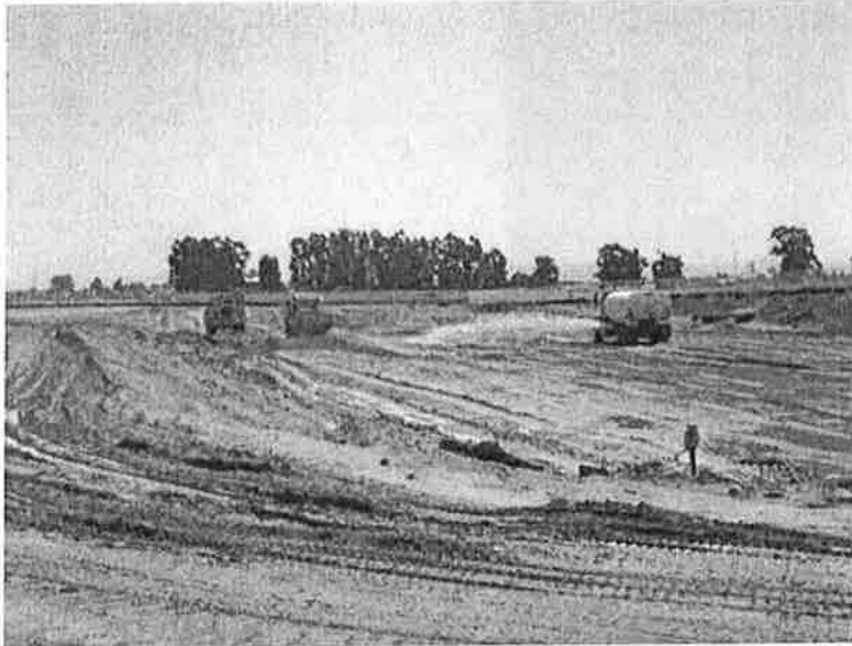
Excavation of sludge drying beds